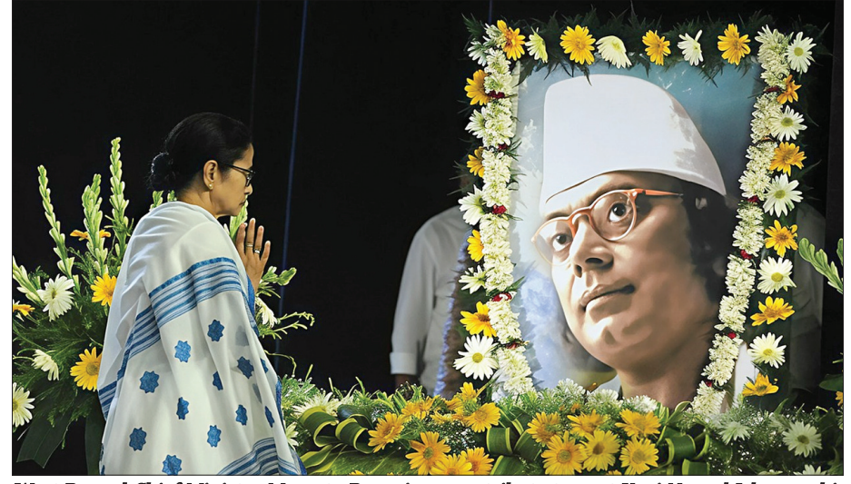
West Bengal Chief Minister Mamata Banerjee pays tribute to poet Kazi Nazrul Islam on his birth anniversary at a programme organized by the State Information and Cultural Affairs Department at Rabindra Sadan in Kolkata on Monday.

News Service, Kolkata:On the occasion of the 126th birth anniversary of Kazi Nazrul Islam, West Bengal Chief Minister Mamata Banerjee on Monday paid a heartfelt tribute to the legendary poet, whose powerful verses and revolutionary vision continue to inspire generations. In a unique confluence of homage and cultural expression, the Chief Minister not only extolled Kazi Nazrul Islam's timeless legacy but also took to the stage with