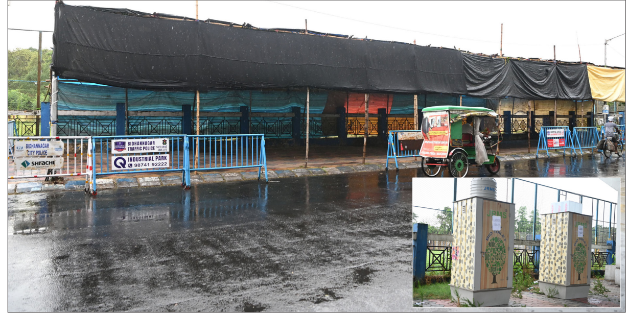
Temporary shelters and bathrooms have been set up for protesting unemployed teachers and non-teaching staff who lost their permanent jobs after the Supreme Court verdict, near Bikash Bhawan, Salt Lake in Kolkata on Monday