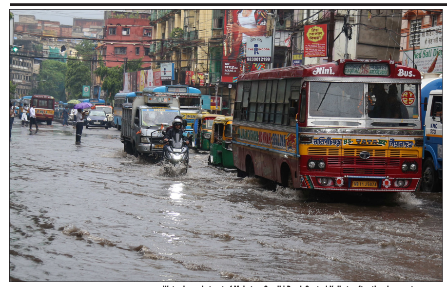
Water logged street of Mahatma Gandhi Road, Central Kolkata after the shower at noon on Monday