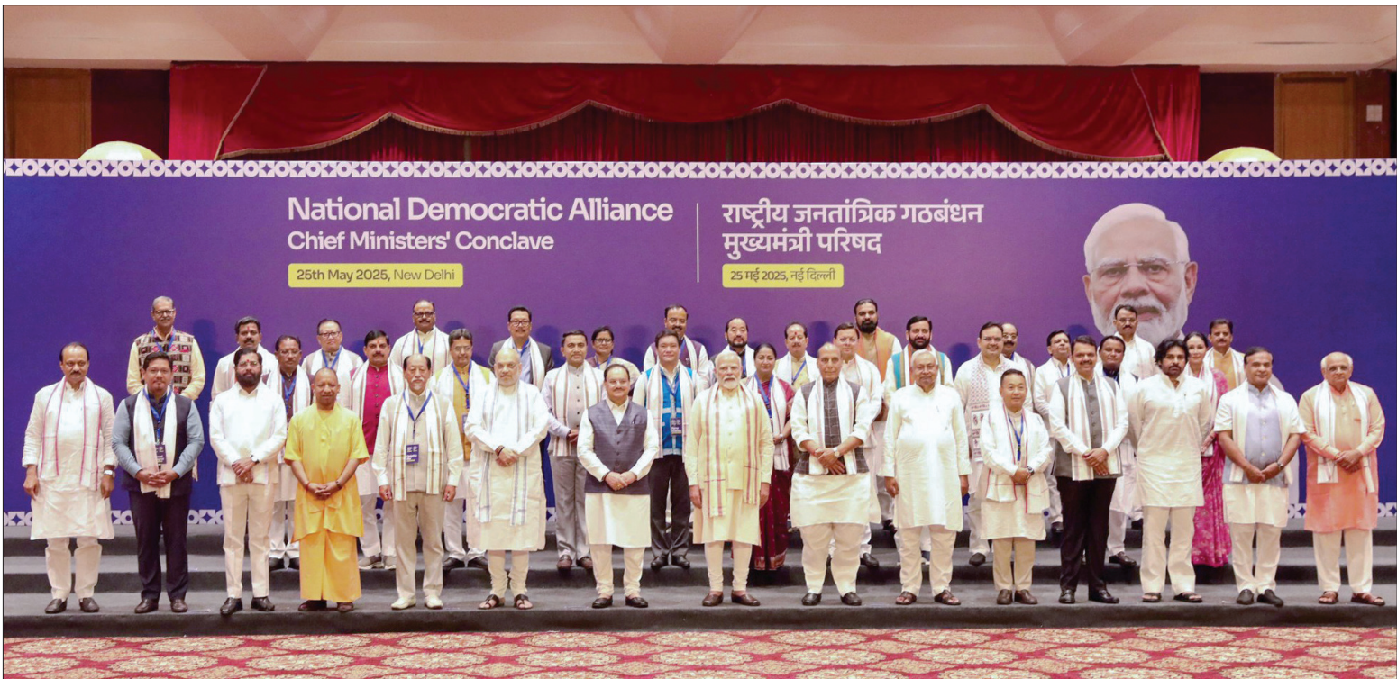
Prime Minister Narendra Modi, Union Home Minister Amit Shah, Defence Minister Rajnath Singh, Union Health Minister and Bharatiya Janata Party National President JP Nadda pose for a picture with NDA CMs and Dy CMs during the National Democratic Alliance Chief Ministers and Deputy Chief Ministers meeting, at Ashok Hotel in New Delhi on Sunday.