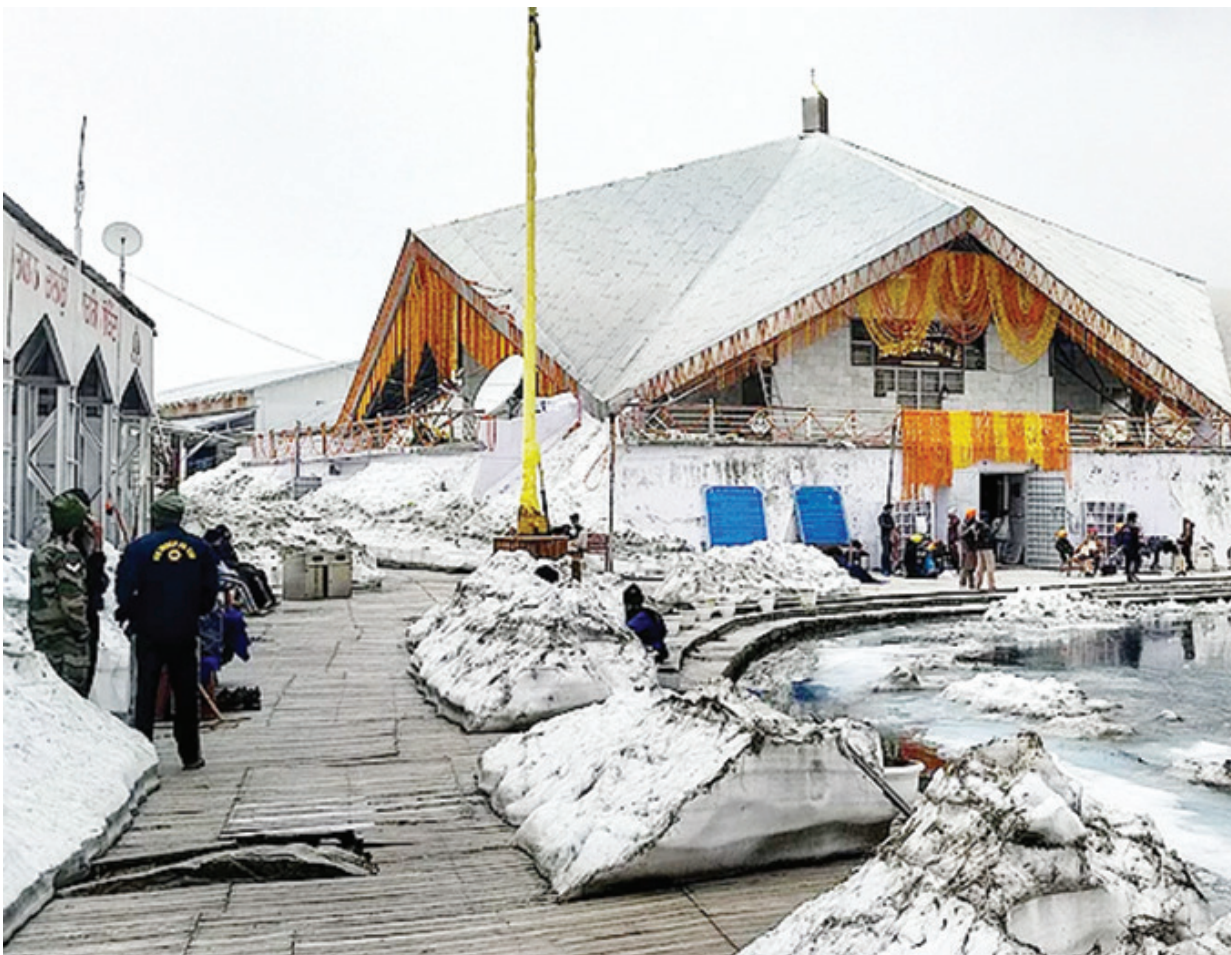
Preparations underway at Gurudwara Hemkund Sahib ahead of its opening for public, in Chamoli district, Uttarakhand.