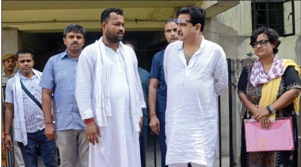
Unemployed teachers (six members delegation team) who lost their permanent jobs after the Supreme Court verdict met with former justice of the Calcutta High Court and BJP MP Abhijit Gangopadhyay, at his Home, Salt Lake in Kolkata.

A part of Central Park is also under the custody of the state forest department. There are paved walkways, and many go there for morning walks.