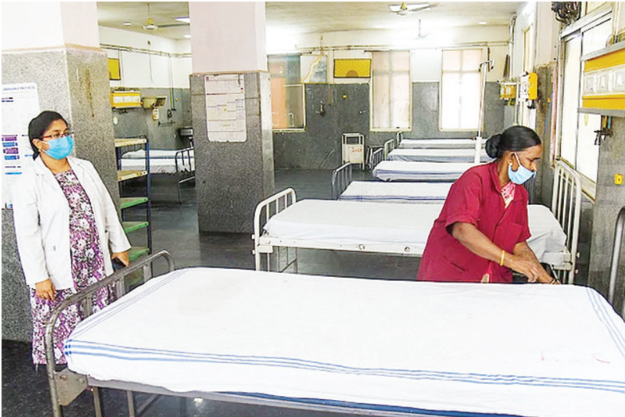
Medics prepare a ward for COVID-19 patients at Gandhi Hospital in the wake of several states reporting Covid cases, in Hyderabad.