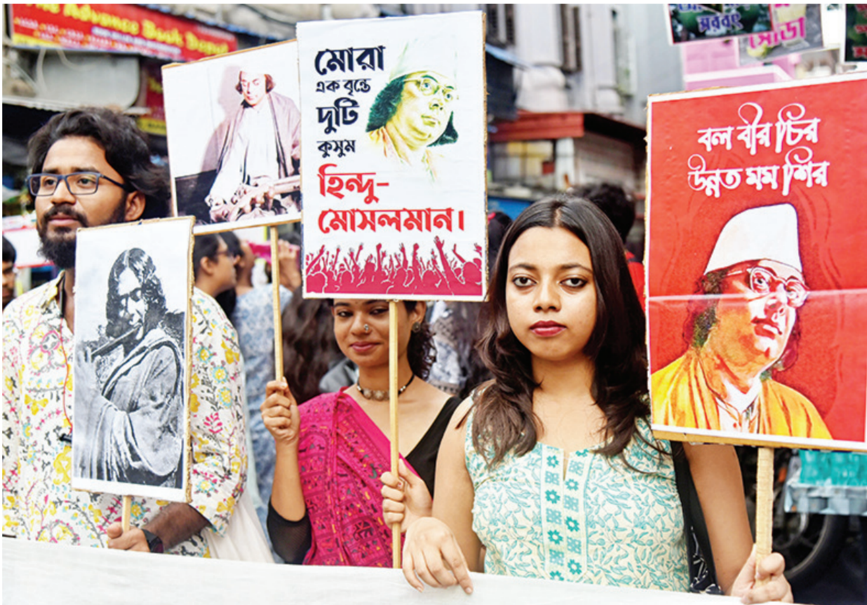
Harmony rally observed across caste and religion on the occasion of the birthday of rebel poet Kazi Nazrul Islam in Kolkata.