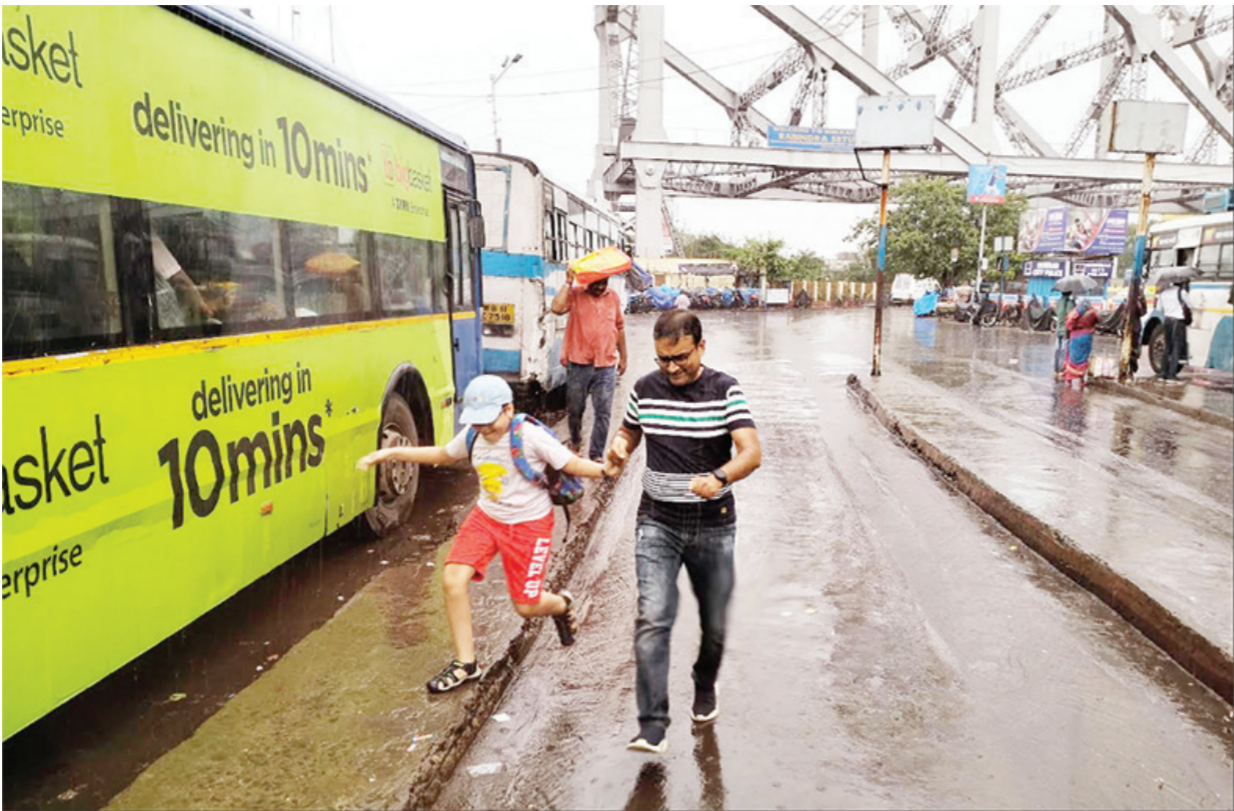
A boy in perky mood near Howrah Bridge during an afternoon shower at Howrah on Saturday.

MI News Service, Kolkata: In an unusual turn of weather events, Kolkata has been experiencing relatively cooler temperatures compared to the Kashmir Valley, which is currently reeling under an intense heatwave. On Friday, Srinagar recorded a maximum temperature of 34.4°C, making it the third hottest May day in the city in 133 years. The temperature was approximately 8°C above normal, causing considerable discomfort to local residents. Meanwhile, Kolkata saw some relief from the heat, with intermittent rainfall and gusty evening winds reported in several districts. According to the Alipore Meteorological Department, the city recorded a maximum temperature of 32.4°C on Friday—around 3°C below the seasonal average. The contrast in weather conditions is stark, especially given Kashmir's typical reputation for cooler climes.