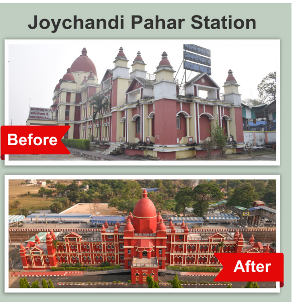
Redevelopment of Joychandi Pahar Station under Amrit Bharat Sation Scheme

Joychandi Pahar station in Purulia District of West Bengal serves as a vital point for passenger and freight transportation. The redeveloped station under Amrit Bharat Station