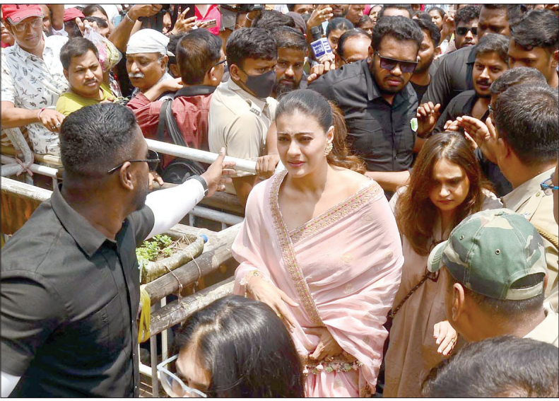
Celebrated actress Kajal paid a visit to Dakshinেশ্বর Temple in Kolkata on Thursday. Kajal came to Kolkata for the promotion of her new film 'Maa'.