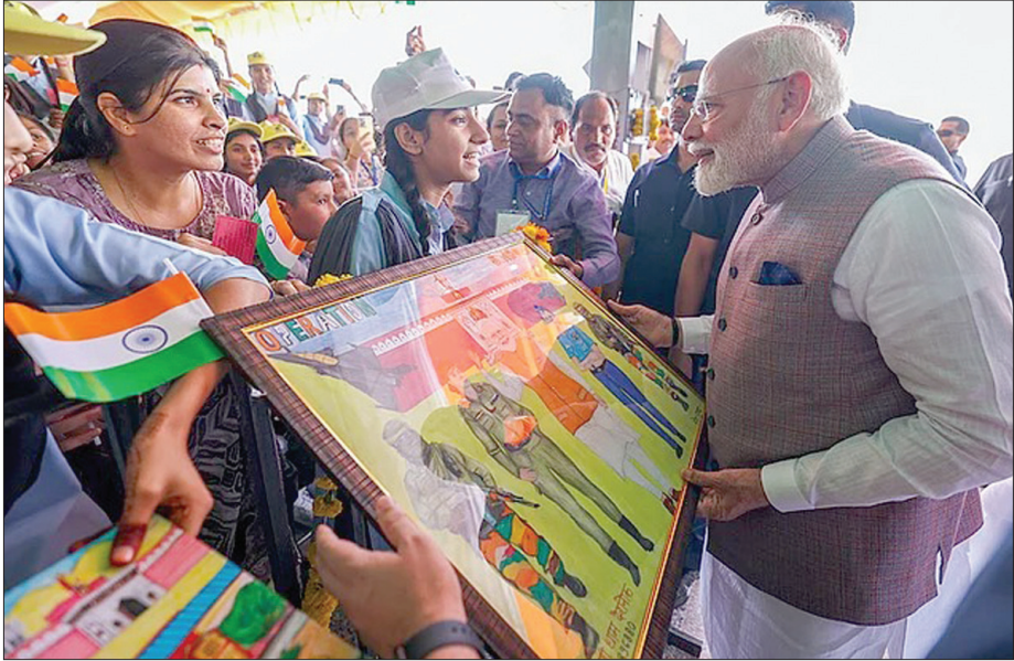
Prime Minister Narendra Modi meets students during inauguration of the redeveloped Amrit Bharat Deshnoke Railway Station and flagging off ceremony of the Bikaner-Mumbai express train, in Bikaner district, Rajasthan.