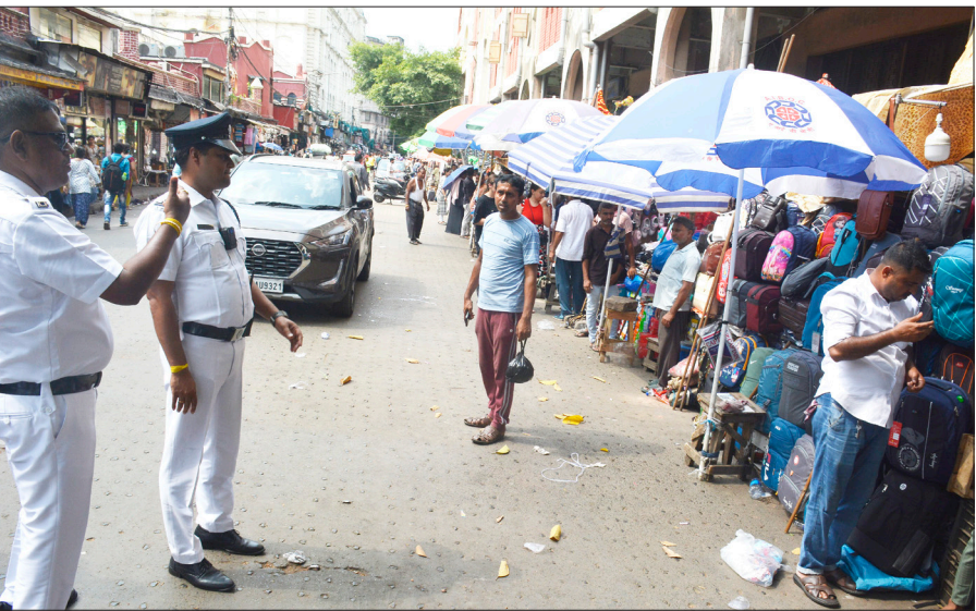
Kolkata Police got engaged in hawkers aviation at New Market area in Kolkata on Tuesday.