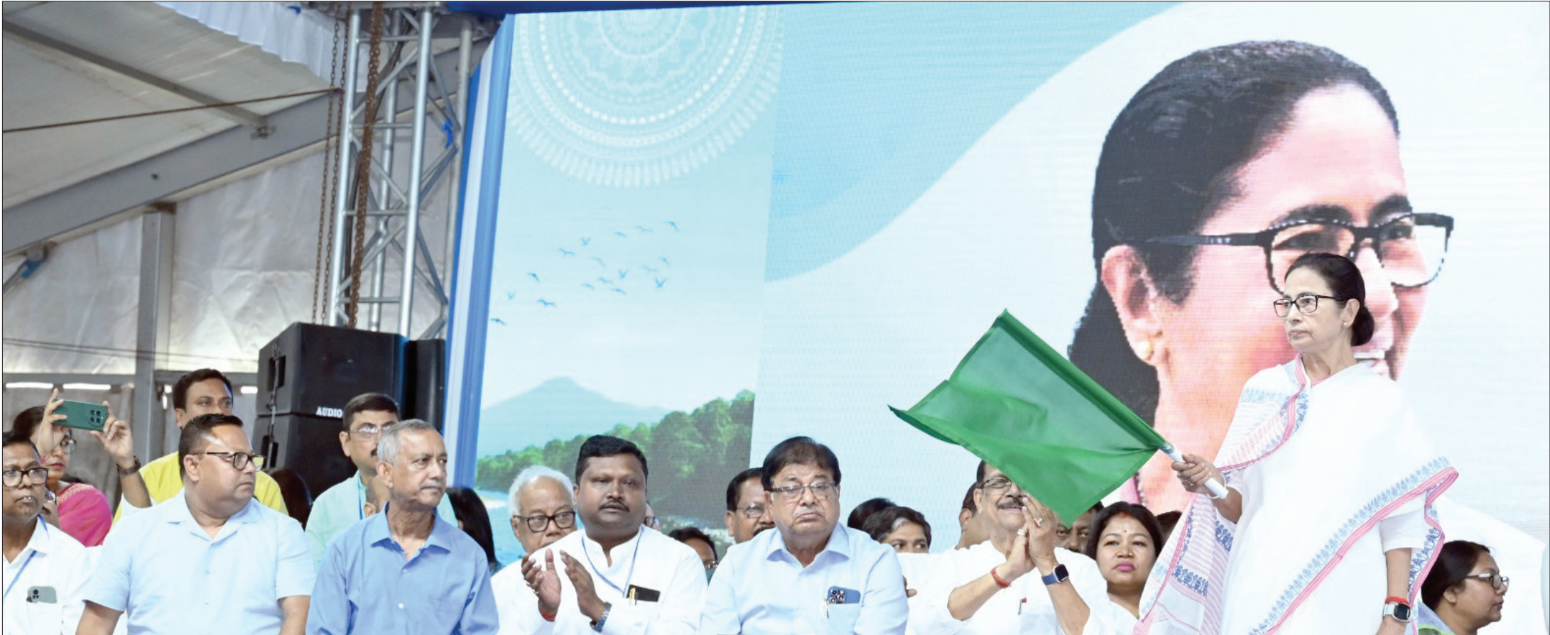
West Bengal Chief minister Mamata Banerjee is flagging off a welfare project at the Administrative meeting at Phulbari at Jalpaiguri on Tuesday.