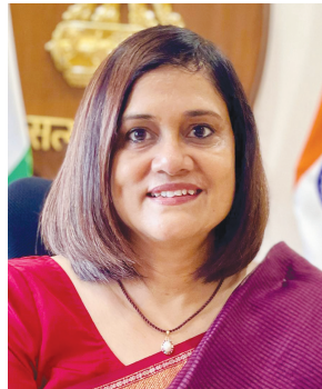
Jaya Varma Sinha Ex. Chairman, Railway Board.

MI News Service, Delhi: India's transformation today is swift and visible—not just in policy docu- ments or political statements, but in its phys- ical landscape. The changes are apparent in newly built roads, high- speed expressways and world-class airports that rival international stan- dards. These develop- ments reflect a deeper shift in how India connects its cities and empowers its people. Once neglected, the railway sector is now emerging as a crucial part of this progress, shedding its image of overcrowded and outdated stations to become a showcase of cul- ture, efficiency and inno- vation.