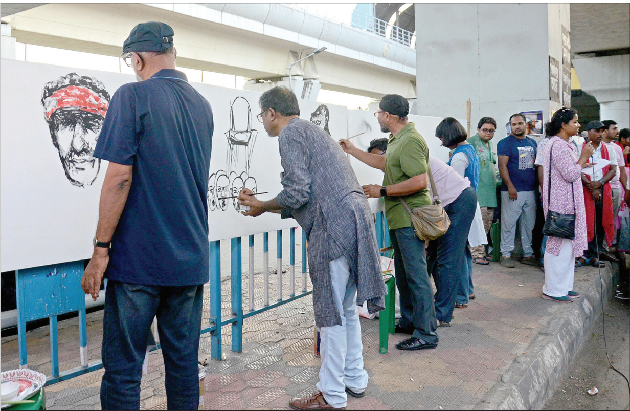
Artists paint outside Bikash Bhawan, Salt Lake on Tuesday to show solidarity towards teaching and non-teaching staff who recently lost their jobs due to Supreme Court verdict.

►► From PG 1 Astrophysics Group expanded and acquired international standing. In 1988, the University Grants Commission invited Dr Narlikar to set up the proposed Inter-University Centre for Astronomy and Astrophysics (IUCAA) as its Founder Director. He held the directorship of IUCAA until his retirement in 2003. Under his direction, IUCAA has acquired a worldwide reputation as a centre for excellence in teaching and research in astronomy and astrophysics. He was an Emeritus Professor at IUCAA. In 2012, the Third World Academy of Sciences awarded Dr Narlikar their top prize for setting up a centre for excellence in science. Apart from his scientific research, Dr Narlikar was internationally famous as a science communicator through his books, articles, and radio and TV programmes. He is also known for his science fiction stories. For all these efforts, he was honoured by UNESCO in 1996 with the Kalinga Award for popular science works.