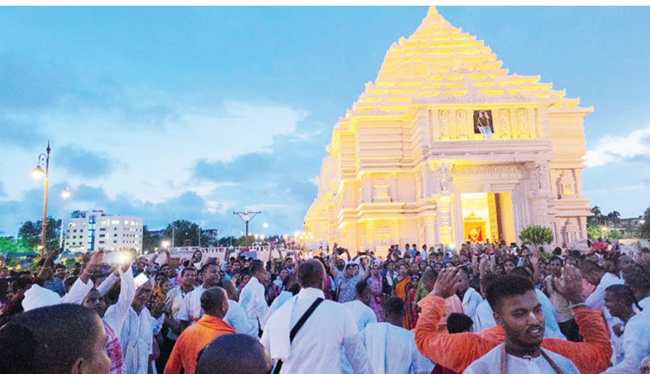
Devotees throng at Jagannath Temple in Digha to watch Special Aarti on Sunday.