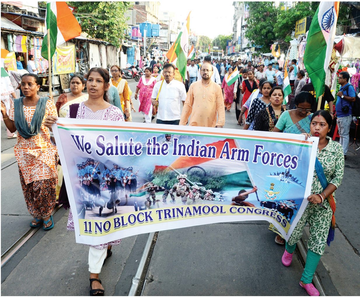
Salute to Indian Soldiers: TMC Tiranga Rally at Bidhan Sarani in Kolkata on Sunday.