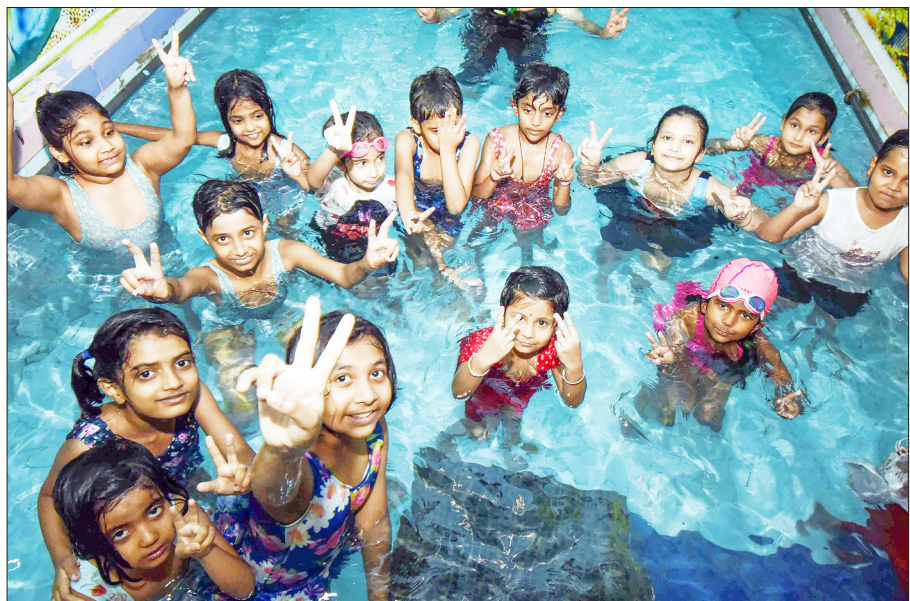
Kids swim in a swimming pool on a hot summer day, in Patna on Sunday.

The Union Minister said that before 2014, the health budget of the country was Rs 37 thousand crore, but PM Modi increased it to Rs 1 lakh 37 thousand crore in the year 2025-26. He said that by increasing the budget of the health sector, PM Modi set up the National Digital Health ecosystem, started the Ayushman Bharat scheme and built Ayushman Arogya Mandir.