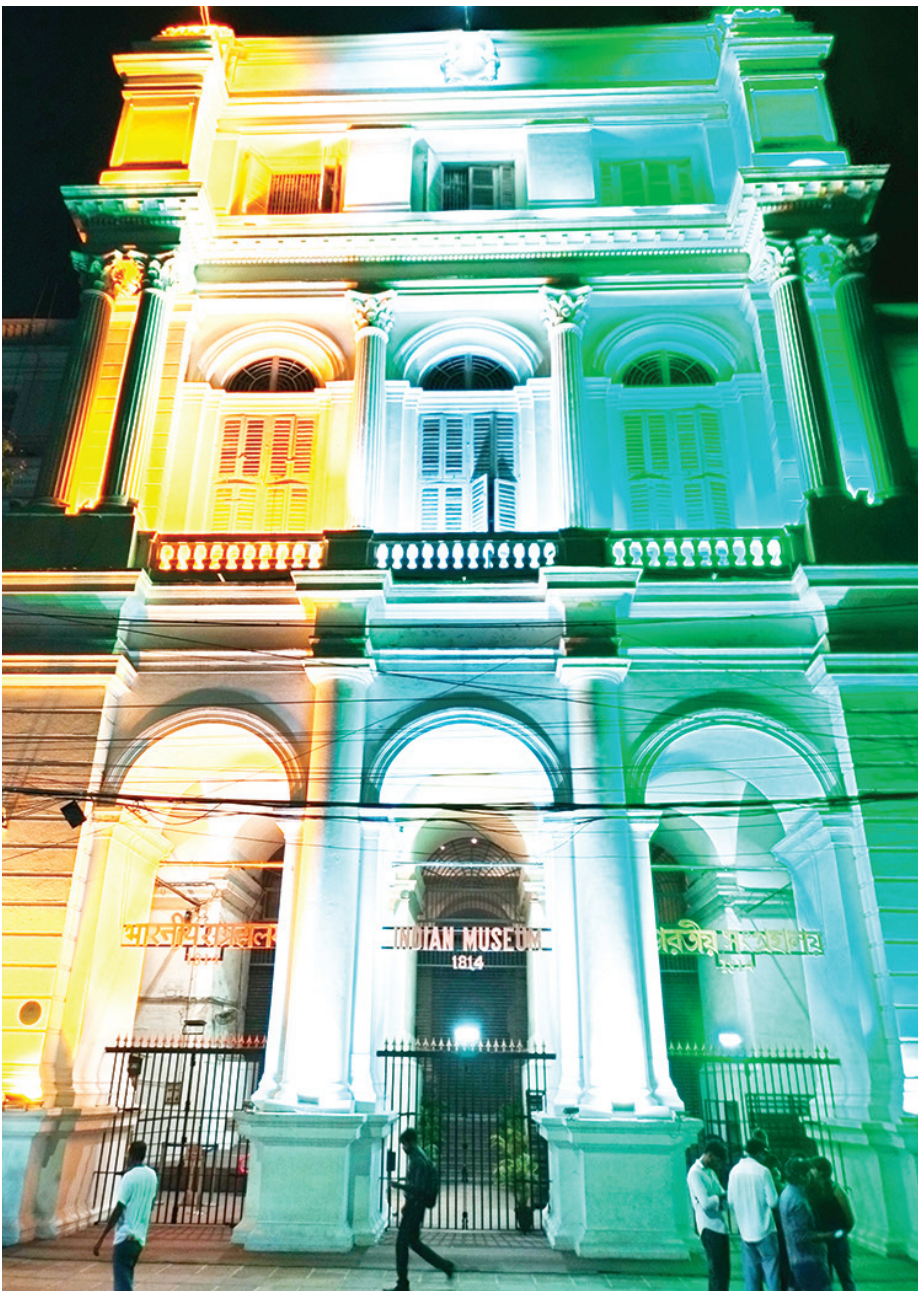
Indian Musium illuminated with tricolour effect on International Museum Day in Kolkata on Sunday.