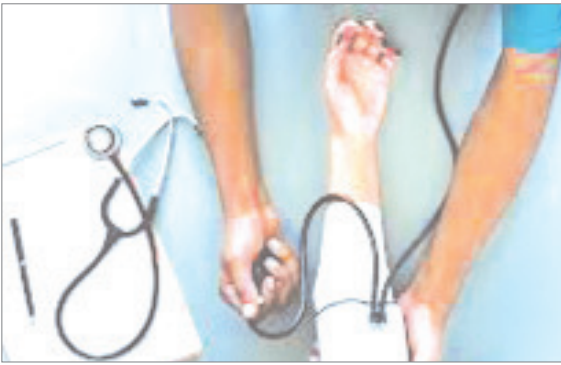
"When treating patients with circulatory shock, it is essential to maintain adequate blood pressure targets, yet standard goals are not personalized to individual patients. We have developed a new metric that can identify individuals with inadequate tissue perfusion who are at risk for adverse outcomes."

Development of the new approach utilized high reso-