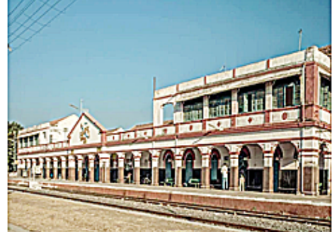
Old Barddhaman Station