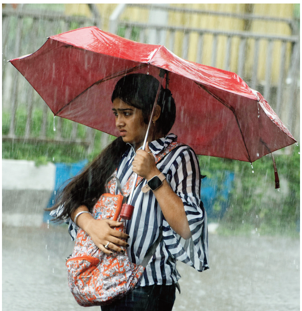
A spell of rain brings bit of relief in Kolkata on Sunday.

A couple of days ago, the KMC had said that multiple agencies would be part of preparing a set of standard operating procedures (SOPs) for rooftop establishments. But the hearings would be conducted by the KMC alone, the civic body had said. The KMC had sent a draft SOP to the chief secretary last week, Calcutta mayor Firhad Hakim had said earlier. Nabanna's stamp on the draft is still pending. There was still no clarity on the SOP. On Saturday, KMC sources said the hearings would include fire safety and other officials. A representative of one of the three restaurants said it had yet to receive any formal communication from the KMC on the hearing. The owners of the two others did not respond to calls and messages. Sources in the industry said rooftop establishments were almost certain that a minimum of 50 per cent open space on the terrace would be a non-negotiable condition for continuing operations. "There is no clarity on anything else. We are waiting for at least one hearing," said a restaurateur.