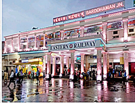
Modern Era Barddhaman Station

MI News Service, Kolkata: As the Howrah Railway Division celebrates its 100th anniversary, Barddhaman Junction Railway Station stands as a powerful symbol of India's railway heritage, weaving together the threads of historical significance, cultural richness, and modern connectivity. Situated in the ancient city of Barddhaman, West Bengal, this key station within the Eastern Railway zone has played a pivotal role in shaping the region's identity as a hub of culture, spirituality, and revolutionary history. As the Howrah Division marks a century of service, Barddhaman Junction exemplifies its enduring legacy of progress and connection.