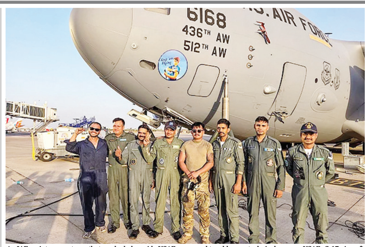
An IAF maintenance team that worked alongside USAF personnel to address a technical snag on USAF- C-17 aircraft,

nected to terrorist outfits. These actions come in the wake of continued efforts by law enforcement to maintain peace and security in the region. Authorities reaffirmed their commitment to a zero-tolerance policy towards terrorism and stressed that such operations would continue until the threat is fully neutralized. Further details are expected as the investigation progresses.