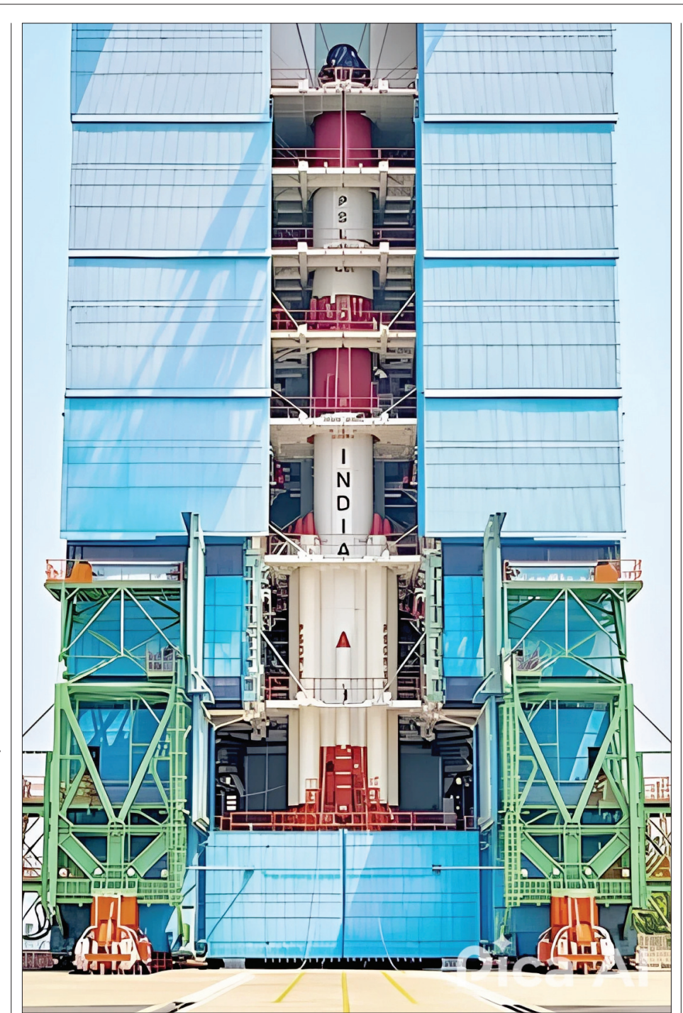
Preparations are underway for the launch of ISRO's PSLV-C61 carrying the Earth Observa-tion Satellite (EOS-09), at the Satish Dhawan Space Station, in Sriharikota, Andhra Pradesh.