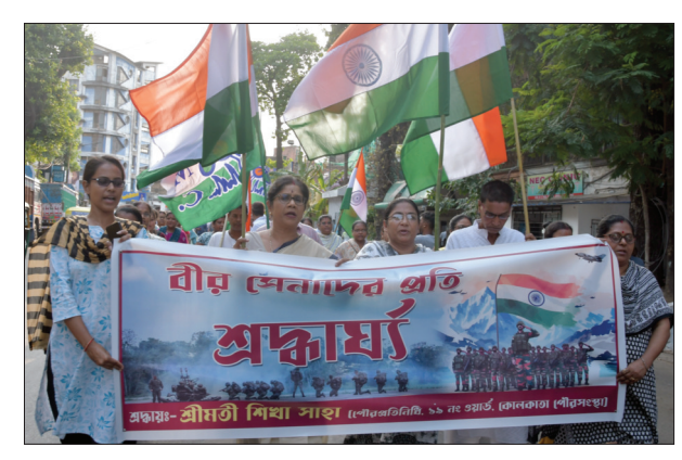
State Minister of Women and Child Development and Social Welfare Shashi Panja, along with others, took part in a rally to honour the contributions of the Indian Army and to extend condolences to the families of those who died in the recent India-Pakistan conflict in Kolkata, on Saturday.

These concerns are further amplified by India's high medical inflation rate, which stood at 14 per cent in 2021—higher than that of China (12 per cent) and Indonesia (10 per cent). This steep inflation has placed significant financial pressure on policyholders, making them increasingly aware of the limitations in their current health insurance plans.