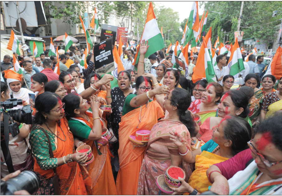
In a vibrant display of patriotism and cultural pride, women played with sindoor during the Tiranga Yatra, marking the success of Operation Sindoor and honouring the bravery of the Indian Armed Forces, in Kolkata on Friday.