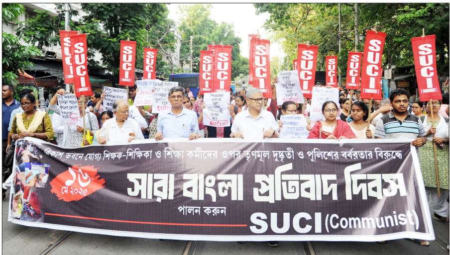
Expressing solidarity with eligible teachers, the activists of SUCI (Communist) held a rally from College Street to Dharmatala in Kolkata on Friday.