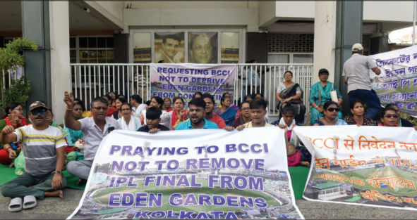
Cricket lovers agitate in front of Eden Gardens Stadium, protesting against the BCCI over the removal of the IPL 2025 Playoff match from the venue, in Kolkata.