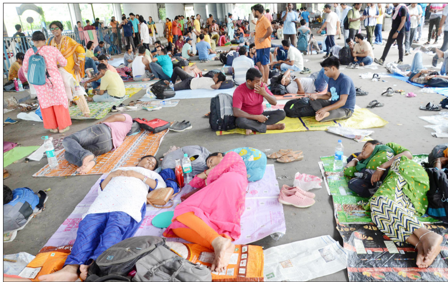
Teachers and non teaching staff who lost their permanent jobs after the Supreme Court verdict took part in a protest, demanding to restore their permanent jobs in front of Bikash Bhawan, Salt Lake in Kolkata.

manufacturer. In any state of India, medical equipment means surgical. This time I am ready to spread my knowledge worldwide. This company will work jointly with different countries. With new technology and low cost, it is possible to create more advanced equipment which can be used in international trade. Will create noise. Many jobs will be created as a result.