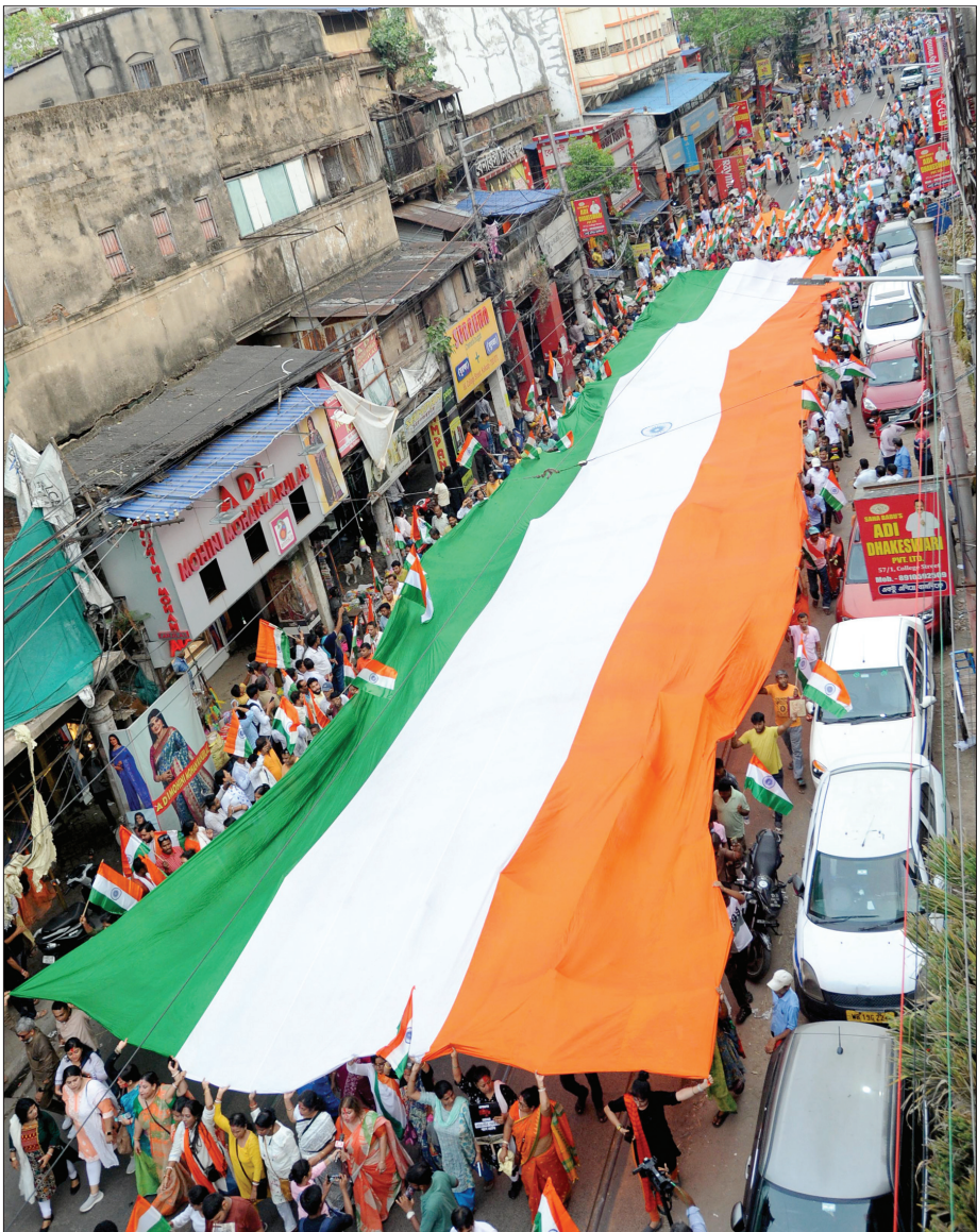
The Tiranga Yatra was solemnly organised to celebrate the resounding success of Operation Sindoor and to pay heartfelt tribute to the unmatched valour and sacrifice of the Indian Armed Forces. The rally marched from College Square to Shyambazar in Kolkata, on Friday.