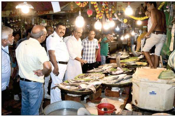
Members of the Task Force visit market to inspect prices of essential commodities at Gariahat area in Kolkata.