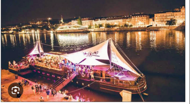
SMP Kolkata opens doors to turn iconic pilot launches into floating heritage & hospitality landmarks.

SMP, Kolkata is seekproposals from ing tourism operators, hospitality companies, event managers, restaurant