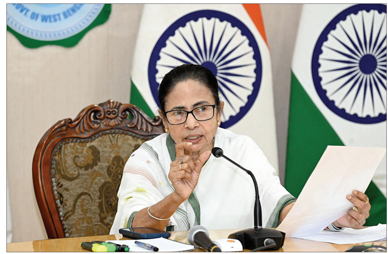
West Bengal Chief Minister Mamata Banerjee addressing a press conference at Nabanna on Wednesday.

Rs. 3 KOLKATA PGS, YEAR-11, ISSUE-341 RNI NO.: WBENG / 2014/ J 56803). WEBSITE: WWWLLVETYLCOM