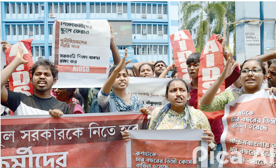
All India Democratic Students' Organisation (AIDSO) took part in a protest during their 'March to Bikash Bhawan' over Teachers recruitment scam, at Salt Lake in Kolkata on Tuesday.

The protesting job seekers accuse the state Primary Education Council of unduly delaying their recruitment despite the absence of any irregularities in the 2022 TET. They argue that this unwarranted delay is causing significant hardship and anxiety. The demonstrations in Bankura on Tuesday serve as a clear indication of their growing impatience, and the TET qualifiers have warned of escalating their movement in the coming days if their demand for immediate issuance of appointment letters is not met.