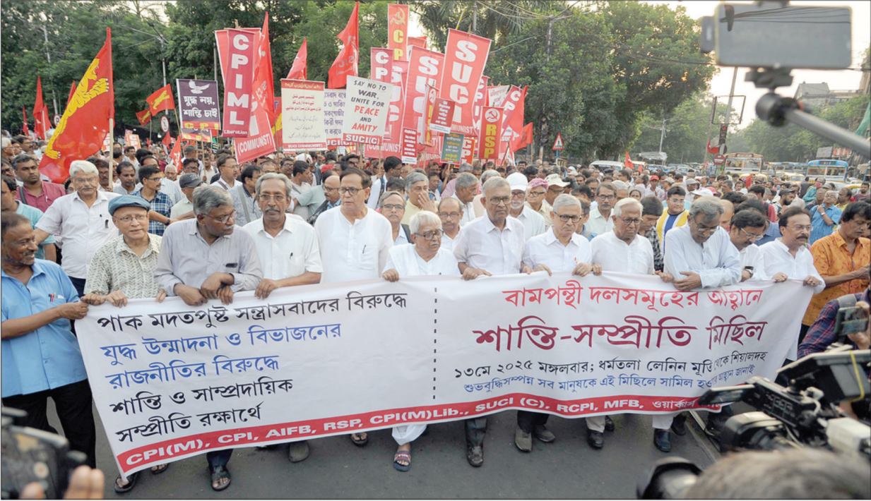
Left parties, including CPI(M), CPI, AIFB, RSP, CPI(ML) Liberation, SUCI(C), RCPI, MFB, Workers' Party, and Bolshevik Party, participated in a procession calling for communal harmony against war and terrorism. The rally started from Dharamtala and proceeded to Sealdah in Kolkata on Tuesday.

and 19,867 were girls. Among them, 21,748 boys and 18,314 girls passed the exam. The overall pass percentage in West Bengal stood at 89.16%. In a gender-wise breakdown for West Bengal, the boys' pass percentage was 86.33%, while the girls' pass percentage was an impressive 92.72%, reinforcing the national trend of better academic performance by girl students. The CBSE's seamless execution of the exams and timely result announcement has been appreciated by students and educators alike.