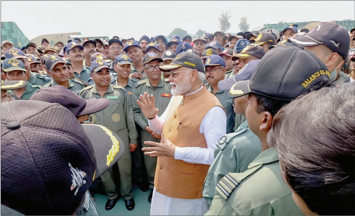
Prime Minister of India, Narendra Modi interacts with brave air warriors and soldiers during his visit to AFS Adampur, applauding their dedication and valour in service to the nation.