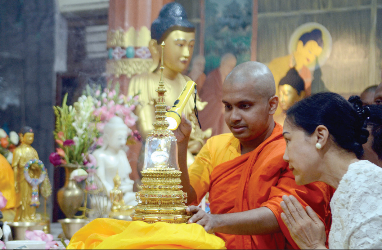
Buddhists pray to mark Buddha Purnima that commemorates Buddha's birth anniversary, at the Maha Bodhi Society in Kolkata on Monday.