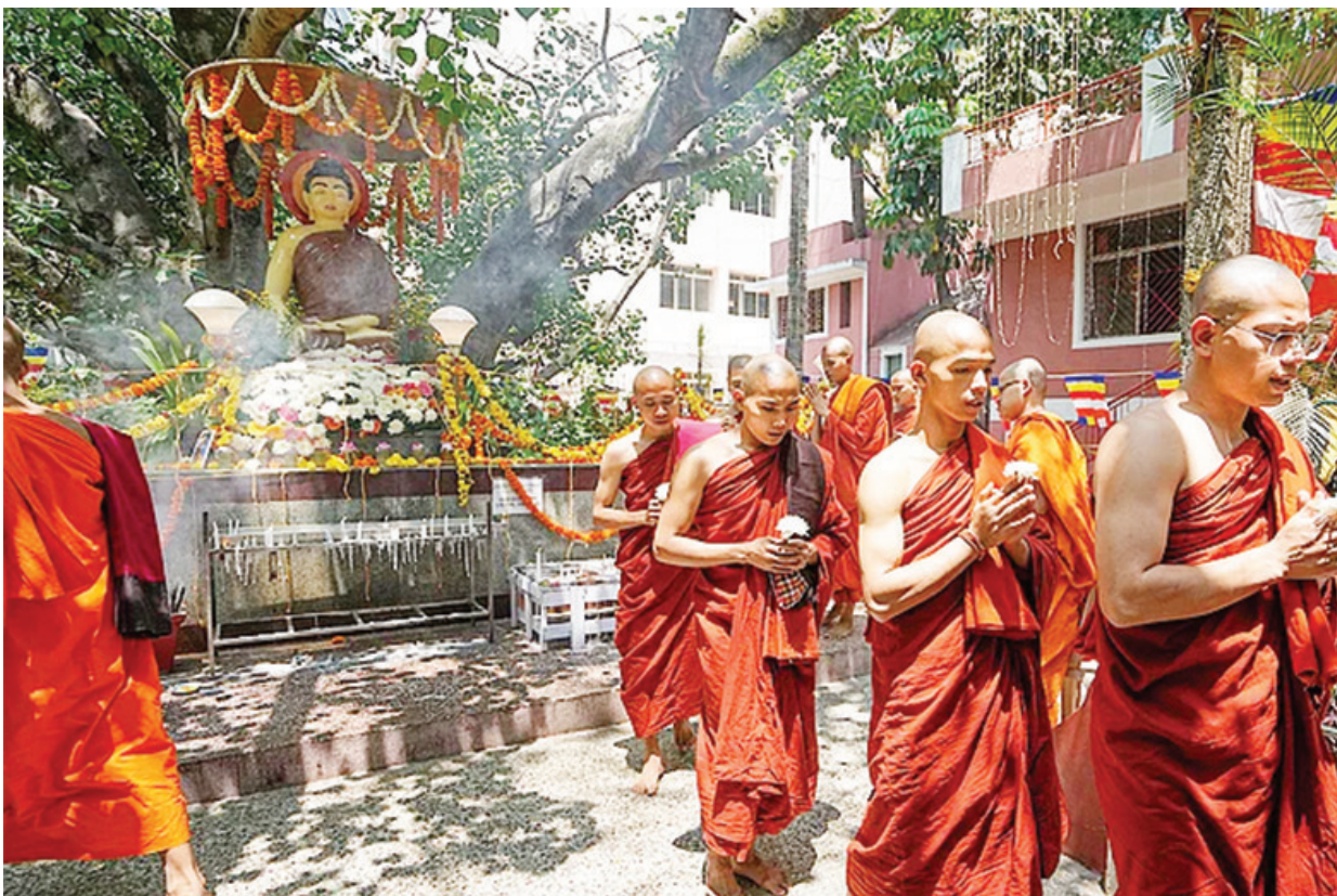
Buddhist monks participate in a prayer during Buddha Purnima celebration at Maha Bodhi Society in Bengaluru, Karnataka. Buddha Purnima also known as Buddha Jayanti or Vesak, marks one of the most sacred days in Buddhism. Observed on the full moon in the month of Vaisakha, the day commemorates the birth of Gautam Buddha and his enlightenment.