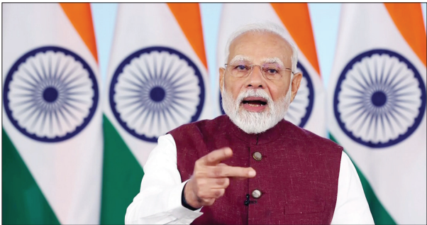
Prime Minister Narendra Modi addresses the nation on Operation Sindoor, in New Delhi on Monday.

MI News Service, New Delhi : Prime Minister Narendra Modi has cautioned Pakistan not to resort to any "Nuclear Blackmail" to create a fear psychosis among the common people about the future of any conflict, and said India would not deter from taking stringent action against Pakistan on its own terms to end the menace of terrorism from that country once and for all . Delivering his 20 minutes long power-packed 'Address to the Nation' on Monday night amid escalating tensions between India and Pakistan despite the much talked about ceasefire from Saturday evening, the Prime Minister praised the armed