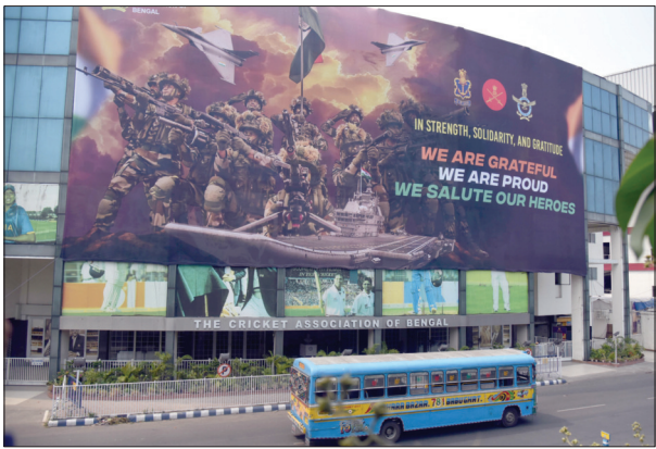
In front of Eden Gardens, the CAB paid respect and honored the Indian Army following Operation Sindoor in Kolkata on Monday.