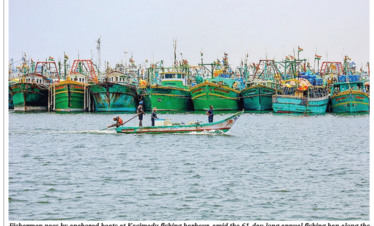
Fishermen pass by anchored boats at Kasimedu fishing harbour, amid the 61-day-long annual fishing ban along the coast of Tamil Nadu, in Chennai.

to clear hurdles to speedy construction of four hydro projects with a combined capacity of 3,014 megawatts,