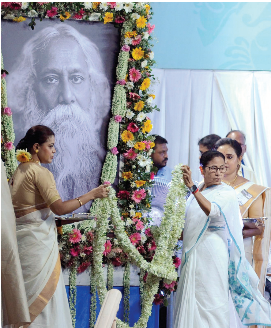
West Bengal Chief minister Mamata Banerjee is garlanding the portrait of Gurudev Rabindranath Tagore on his 164th Birth Anniversary, in Kolkata on Friday.