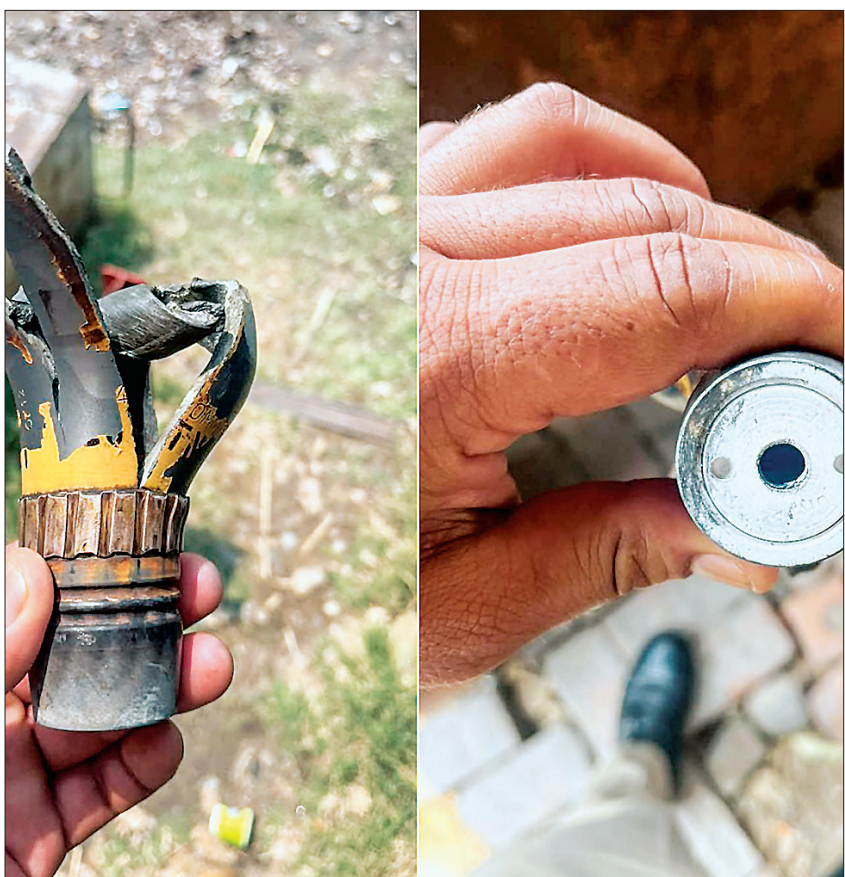
(Combo Picture) A view of the artillery shells fired by Pakistan armed forces during ceasefire violation, in Jammu on Friday.

THE DEFENCE MINISTRY HAD SAID THAT ON THE NIGHT OF MAY 7-8, PAKISTAN ATTEMPTED TO ENGAGE A NUMBER OF MILITARY TARGETS IN NORTHERN AND WESTERN INDIA INCLUDING AWANTIPURA, SRINAGAR, JAMMU, PATHANKOT, AMRITSAR, KAPURTHALA, JALANDHAR, LUDHIANA, ADAMPUR, BHATINDA, CHANDIGARH, NAL, PHALODI, UTTARLAI, AND BHUJ, USING DRONES AND MISSILES.