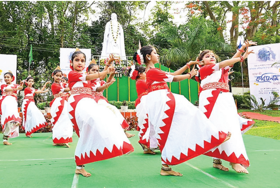
School students perform during celebration of Rabindranath Tagore Jayanti at Rabindra Kanan, in Agartala.

MI News Service, Kolkata: For Track maintenance work between Lakshmikan- tapur - Namkhana section, 34935/34914 Lakshmikan- tapur - Namkhana - Laksh- mikantapur local will remain cancelled on 10/11.05. 20 25 (Saturday/ Sunday).