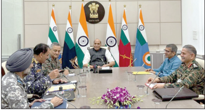
Defence minister Rajnath Singh is Presiding over a Security review meeting with three Service Chiefs of the Indian Armed forces in New Delhi on Friday.

MI News Service, New Delhi : In less than 12 hours after Indian Armed forces successfully repulsed multiple drone attacks by the Pakistani army from across the border, Defence minister Rajnath