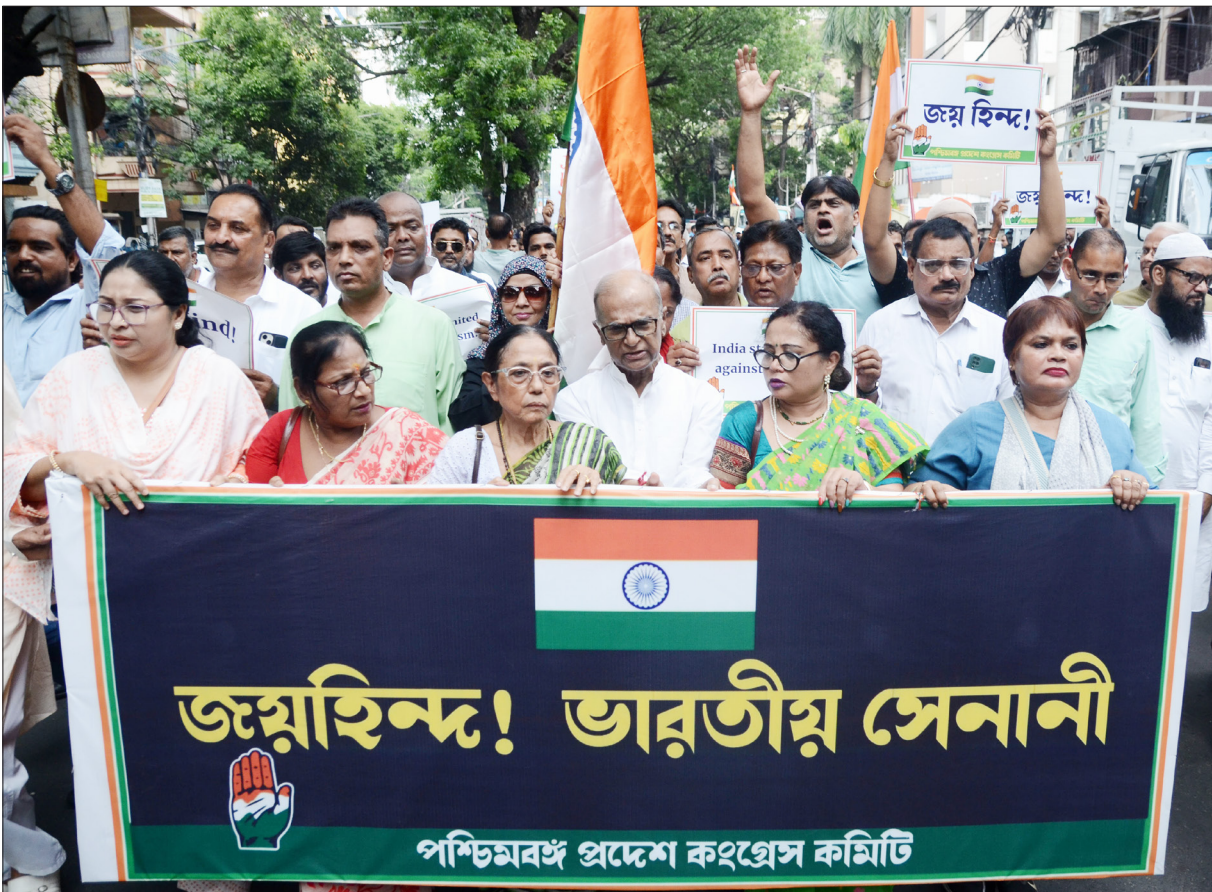
Congress holds Tiranga Yatra in support of Indian armed forces in Kolkata on Friday.