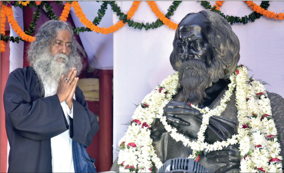
Tribute to Rabindranath Tagore at Jorasanko Thakur bari on his 164th Birth Anniversary in Kolkata on Friday.

cols at Kolkata International Airport in light of the prevailing geopolitical climate. Prior to this, the Deputy Inspector General (DIG) of CISF held a significant meeting with the Director of the Airport Authority of India and officials representing various airlines to discuss and coordinate enhanced security arrangements for passengers. Stringent security protocols have already been implemented at the airport. A no-parking policy is now in effect at both the arrival and departure areas to mitigate potential security risks. The Ministry of Civil Aviation has issued a nationwide advisory, urging all airports across the country to adopt heightened precautionary measures. Consequently, passengers traveling through Kolkata Airport are now advised to arrive at least three hours prior to their scheduled departure time, and airport gates will close one and a half hours before flight departure. These measures aim to ensure the safety and security of all passengers and airport operations during this period of heightened alert.