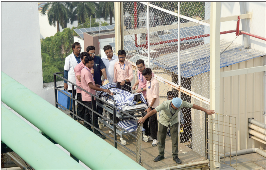
Emergency mock drill at a private hospital in Kolkata.