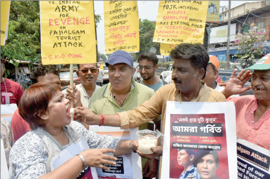
Indian army congratulated by South kolkata district congress at jadubabur bazar for destroyed terrorist camps in pakistan..