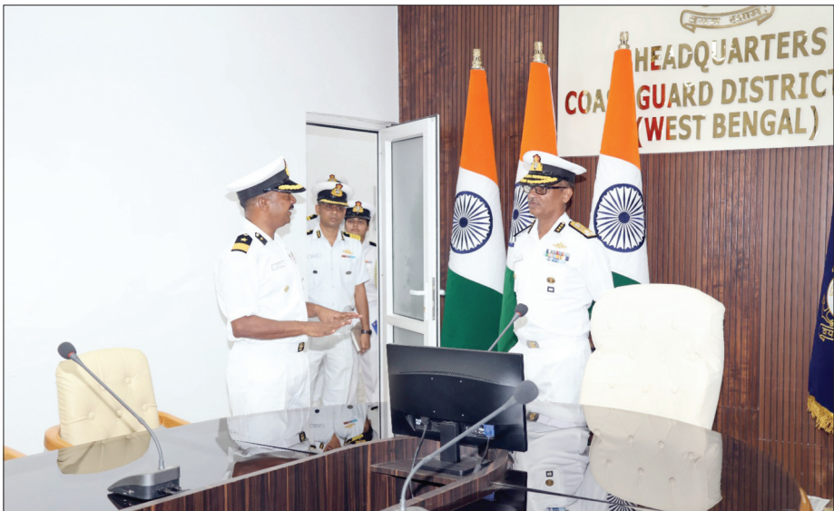
Amid war like situation between India and Pakistan, Coast Guard officials held a meeting at West Bengal Head Quarters to asses the current situation and build up war-like readiness to meet any eventualities.