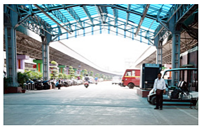
New cab road

and road transport is an unparalleled feature, especially beneficial for elderly travelers, families, and those with heavy luggage. The vision of the early planners is clearly reflected in this thoughtful design, which integrates convenience into the very structure of the station. The original road layout smartly connected the two wings of the station via the Buckland Bridge—today known as BankimSetu—facilitating smooth movement for both vehicles and passengers.