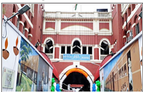
Old cab road

The Old Cab Road, which runs between platforms 8 and 9, is the largest of its kind in Indian Railways. It allows vehicles to enter the station premises and drive right up to the platforms, virtually enabling passengers to step directly into a waiting car after alighting from a train. This seamless connection between rail