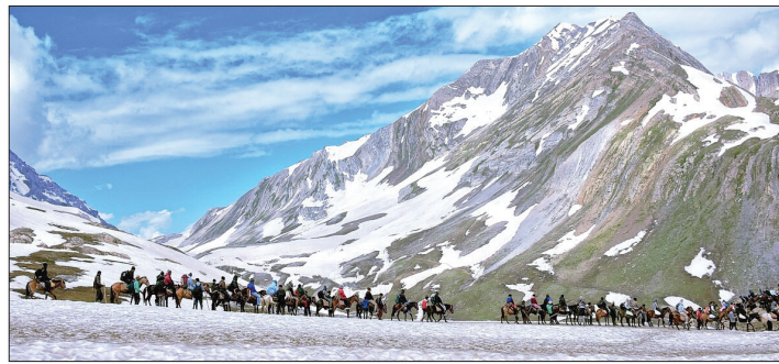
Amarnath Yatra 2025 enroute Jammu division. The meeting attended by