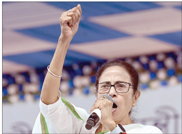
West Bengal Chief minister Mamata Banerjee is addressing a rally at Suti in Murshidabad district on Tuesday.

The Waqf Amendment Act was passed by both Houses of the Parliament