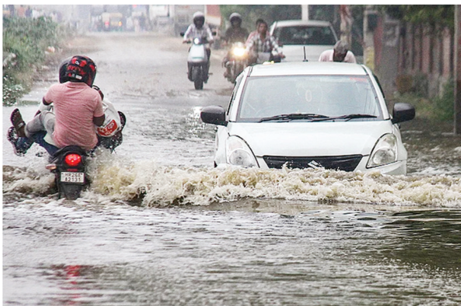
Vehicles move through a waterlogged road after heavy rain, in Gurugram.

Israel halted the entry of goods and supplies into Gaza on March 2 following the expiration of the first phase of a January ceasefire agreement with Hamas. The second phase has yet to be implemented due to a lack of consensus between the parties.