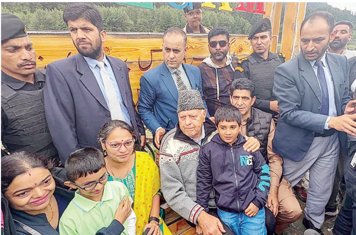
J&K National Conference President Farooq Abdullah interacts with tourists, in the aftermath of the Pahalgam terror attack, in Anantnag district, Jammu & Kashmir.

Composition for Regular Train: Two AC-2Tier, Three AC-3Tier, Two AC-3Tier Economy, 7 Sleeper Class, 4 General Second Class, 1 General Second Class cum Guard's Brake Van and 1 Generator Van. Reservation: Bookings for regular Train No. 20496 will be available from 5.5.2025 at all computerised reservation centres and on website www.irctc.co.in