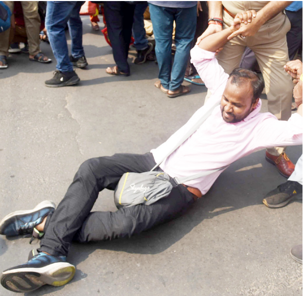
Police detain member of United Teaching and Non-Teaching Forum 2016 during their protest in Kolkata.