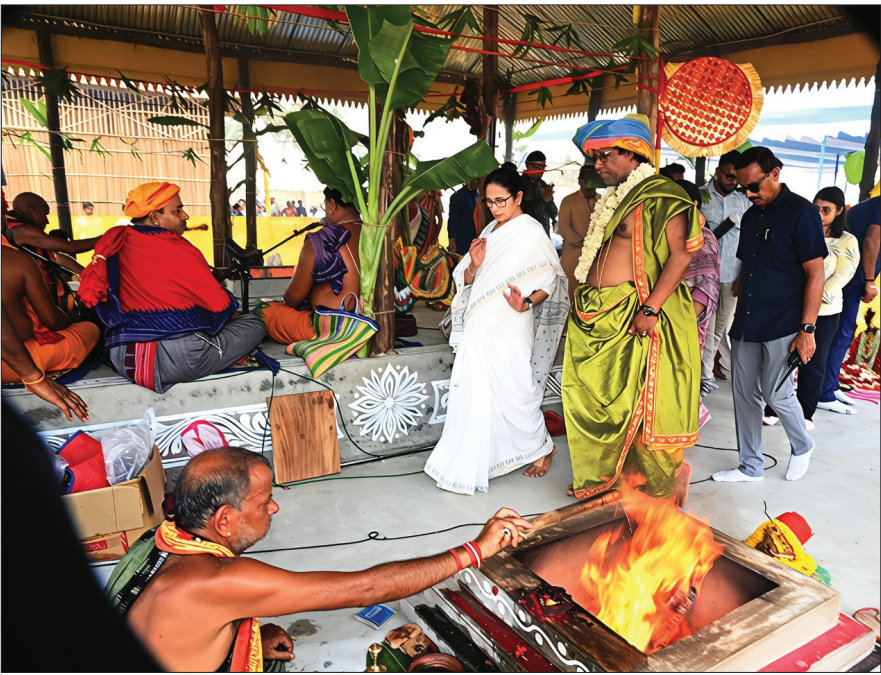
West Bengal Chief Minister Mamata Banerjee conducted an on-site inspection of the preparations and arrangements at Digha ahead of the grand inauguration of the Jagannath Temple scheduled on April 30. As part of the ceremonial proceedings, priests were seen performing yajna to invoke blessings for the wellness and prosperity of the region, in Purba Medinipur on Monday.

the entire resort town of Digha and its neighbourhood ahead of the grand inauguration of the temple on the auspicious Akshaya Tritiya day on Wednesday. Elaborate arrangements have already been made to ensure a fool proof security of not only in and around the entire temple complex but also in the entire township with hundreds of police personnel and plain clothesmen requisitioned from all nearby districts, are being deployed for smooth management of security and traffic along the national highways and at the adjacent huge parking lots near the temple complex. The new new Jagannath Dham temple of Digha , similar to that of the famous Jagannath temple of Puri in Odisha, is also known for its exquisite