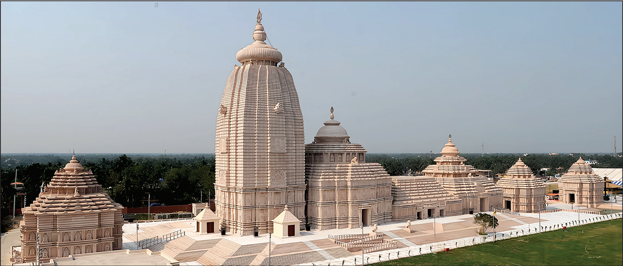
Jagannath Dham at Digha, set to be inaugurated by Chief Minister Mamata Banerjee on Wednesday, offers a serene and spiritual haven, where tranquility envelops every corner, inviting peace and reflection.