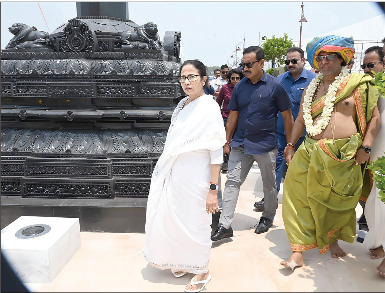
West Bengal Chief Minister Mamata Banerjee visits Jagannath Temple in Digha to oversee preparations for its grand inauguration scheduled for April 30 (Wednesday), on the occasion of Akshaya Tritiya, in Purba Medinipur.