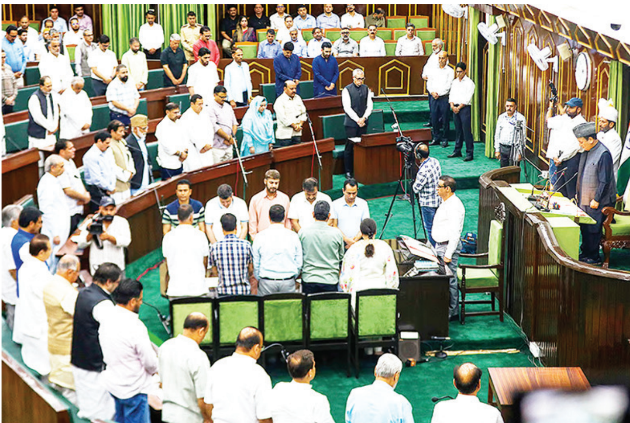
Jammu and Kashmir Chief Minister Omar Abdullah with MLAs observes silence to pay tributes to the victims of Pahalgam terror attack during the one-day special session of the J&K Assembly, in Srinagar.