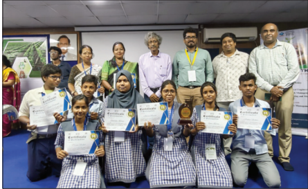
Students were awarded for projects related to clean energy, waste reduction, recycling, eco-design, water purification, and smart city innovations during a school-level project competition for 2025, organized by the Department of Mechanical Engineering at IEM.

MI News Service, Kolkata: In a remarkable celebration of young talent and environmental consciousness, the Department of Mechanical Engineering at the Institute of Engineering and Management (IEM) hosted a school-level project competition for 2025 under the themes of "Innovation, Sustainability, and Circularity." Over 100 participants, including students and teachers from leading city schools, showcased pioneering models promoting eco-friendly solutions. Five outstanding projects were awarded for excellence in areas such as clean energy, waste reduction, recycling, eco-design, water purification, and smart city innovations. Schools honored for their achievements in recycling innovation included Gobindapur Ratneshwar High School, Halisahar Rabindra Vidya Mandir, and Santoshpur Rishi Aurobindo Girls' School. Special commendations were awarded to Behala Girls' High School and Shibpur Bhavani Girls' School. Patha Bhavan and Barisha Vivekananda Girls' High School secured the Scientific Innovation Awards,