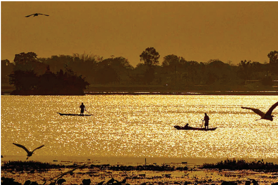
Fishermen catch fish in the waters of Dalpat Sagar during the morning hours at Jagdalpur in Bastar district.