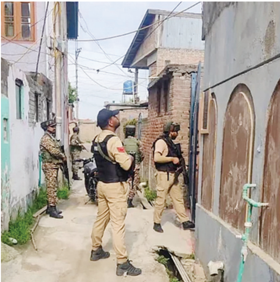
Security personnel conduct searches in the houses of terror associates under the Unlawful Activities (Prevention) Act (UAPA) cases, in Srinagar.

"Practical learning is now part of that education policy. There is a saying in English: not to teach you what to think, but to teach you how to think. There was no formal education policy. However, 10 years later, Educational institutions have reaped immense benefits. Approximately 350 and 90 universities have been established. Seven hundred new medical colleges have been opened, seventy-five thousand new medical seats have been introduced, and new IITs have been opened," Scindia said.