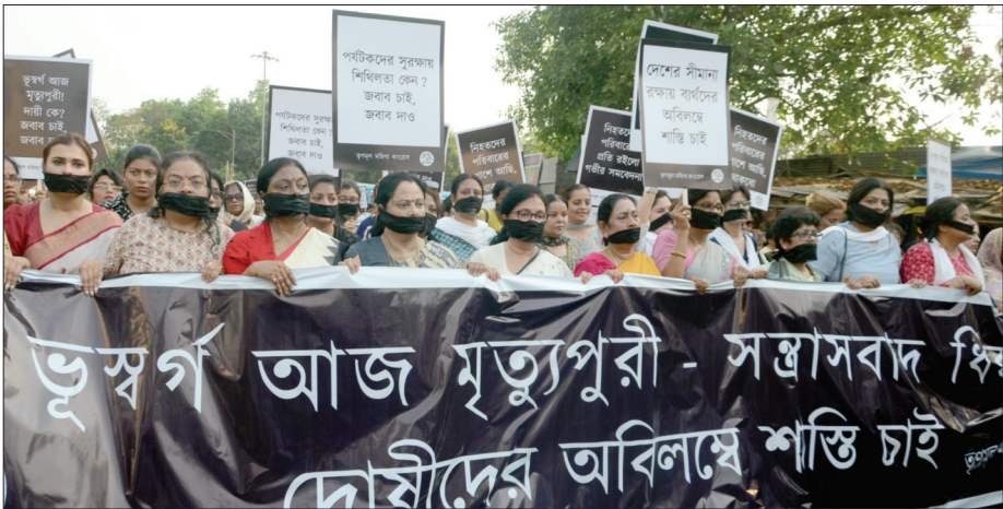
TMC women's wing participated in a silent rally to protest against the Pahalgam terrorist attack in Kolkata.