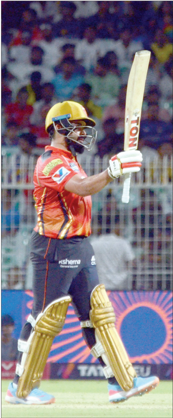
PBKS batsman Prabhsimran Singh celebrates his half-century during their match against KKR at Eden Gardens in Kolkata on Saturday.