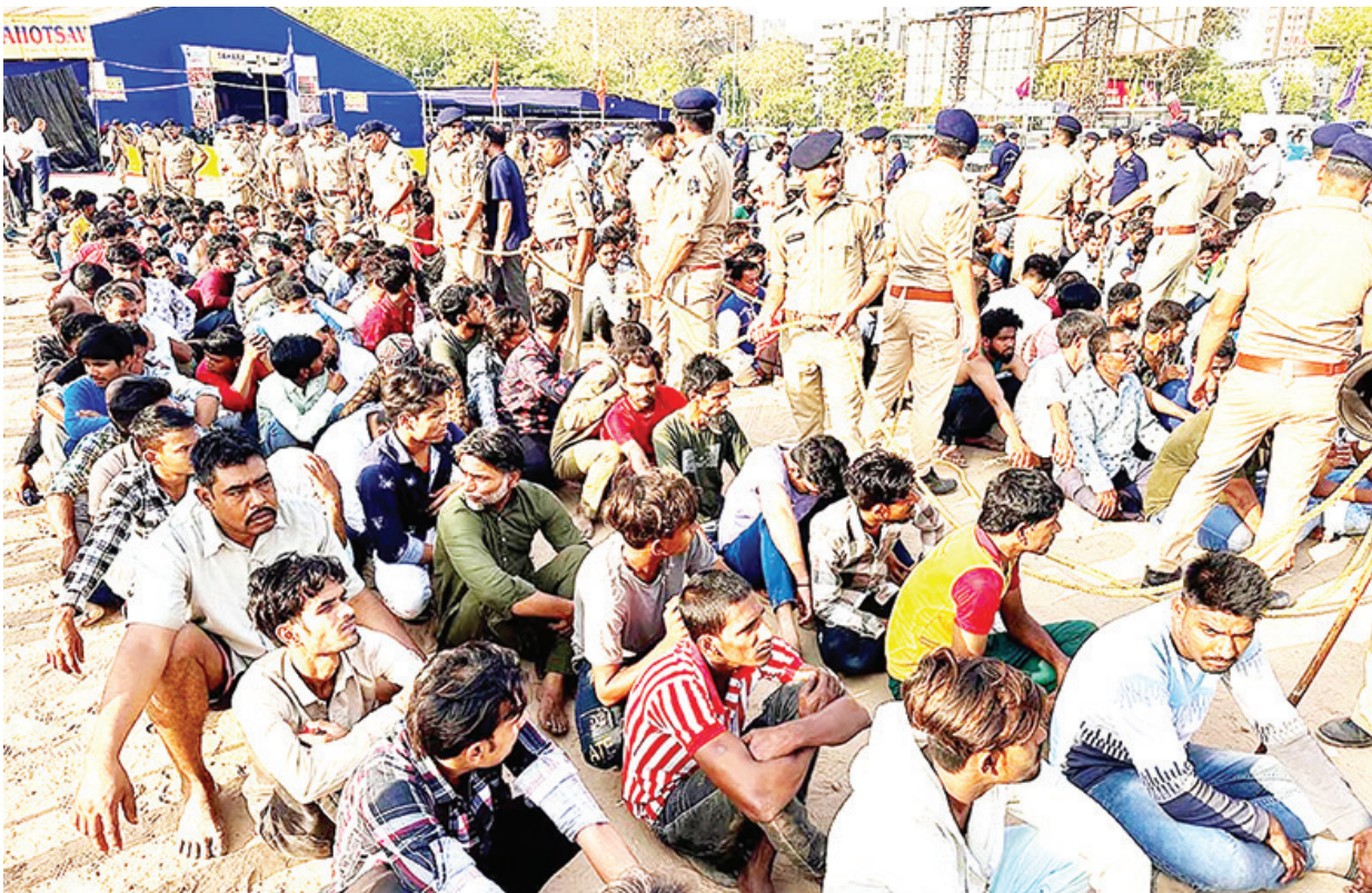
Police detain over 400 suspected immigrants in the wake of Pahalgam terror attack, in Ahmedabad.

During the operation, a Terrorist hideout was successfully located and busted. A significant cache of arms and ammunition was recovered from the site, including: five AK-47 Rifles, eight AK-47 Magazines, one Pistol, one Pistol Magazine, 660 Rounds of AK-47 Ammunition, one Pistol Round and 50 Rounds of M4 Ammunition. The recovery is a significant success, especially given indications that terrorists were preparing to carry out activities aimed at disturbing peace and order in the region. The timely action by the security forces has dealt a significant blow to such nefarious designs and has averted potential threats to civilian lives and public safety. This operation once again underscores the firm resolve and close coordination of security forces in maintaining peace and thwarting the evil intentions of anti-national elements.