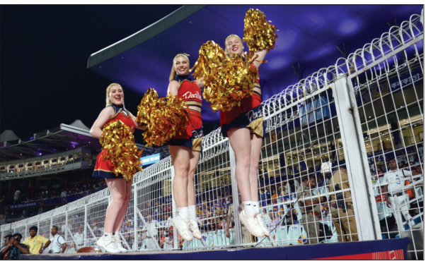
Cheer leaders during the IPL match between KKR and PBKS at Eden Gardens in Kolkata.