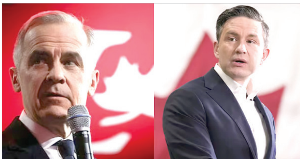
Poilievre, 45, is a career politician and firebrand populist who says he will put "Canada first." For years his party's go-to attack dog, he frequently criticizes the mainstream media and vows to defund Canada's public broadcaster. There are two other parties that have official status in Parliament.

of bilateral stability, the vote is now expected to focus on who is best equipped to deal with Trump. How will the election work? Voters nationwide will elect all 343 member of the House of Commons, one for each constituency. There are no primaries or runoffs - just a single round of voting. Like the UK, Canada uses a "first-past-the-post" voting system, meaning the candidate who finishes first in each constituency will be elected, even if they don't get 50% of the vote. This has generally cemented the dominance of the two largest parties, the Liberals and Conservatives, because it's difficult for smaller parties to win seats unless they have concentrated support in particular areas. How is the prime minister chosen? The party that commands a majority in the House of Commons, either alone or with the support of