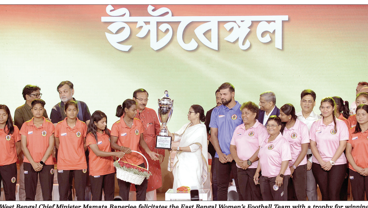
West Bengal Chief Minister Mamata Banerjee felicitates the East Bengal Women's Football Team with a trophy for winning the Indian Women's League, on the occasion of East Bengal Club's centenary celebration, in the presence of State Minister Aroop Biswas and other eminent personalities, at Rabindra Sadan in Kolkata on Thursday.

The state government has indicated that recruitment for these posts will commence without delay. This strategic employment push not only addresses infra-structure needs but also reflects the government's commitment to public safety, healthcare, and religious tourism development in West Bengal.