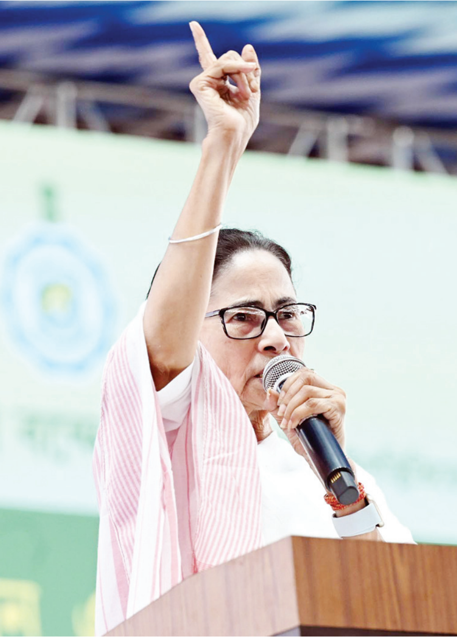
West Bengal Chief Minister Mamata Banerjee addresses the public during the inauguration programme of a solar power generation facility at Goaltore in Paschim Medinipur on Tuesday.