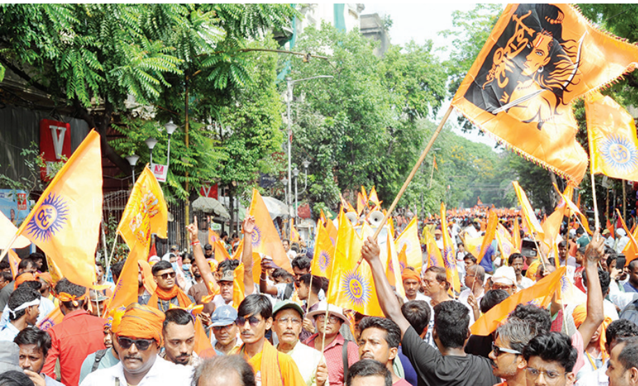
Hindu Suraksha Manch organised a protest rally, 'Dharamtala Chalo', demanding justice for the displaced, oppressed, and voiceless victims. The rally concluded at Dharamtala in Kolkata on Tuesday.

Court on behalf of the Group C and Group D staff who had lost their jobs. "Keep your faith in us until then," she said, urging the teachers to trust the state government's efforts in resolving the issue. In a strong message, Banerjee warned the teachers not to be swayed by external provocateurs. "Had I been in Kolkata, I could have solved the issue within seconds. Do not pay heed to those who are trying to provoke you. Let the state government handle this," she asserted. Comparing the situation in West Bengal with similar developments in Uttar Pradesh and Tripura, where large-scale job losses had occurred without any recovery, Banerjee cautioned the teachers not to let that happen in the state. "People in those states lost their jobs in huge numbers and never got them back. Don't let that happen here," she warned. The teachers had gathered at the WBSSC headquarters following the Supreme Court's April 3 ruling, which cited "widespread irregularities" in the 2016 recruitment process. They demanded the publication of a list of those appointed on merit and those allegedly involved in bribery. The protests have continued despite the government's assurances of job security and support for the affected staff.