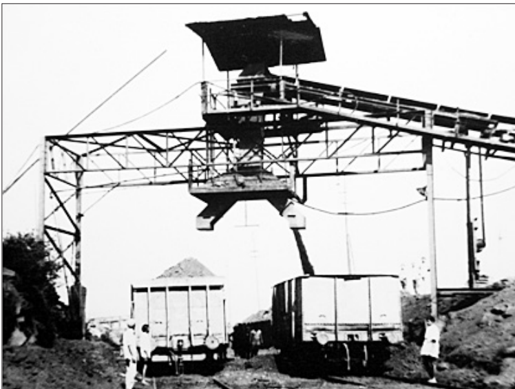
Coal being loaded into a wagon

Earlier, Dwarkanath Tagore, a prominent Bengali businessman and the enterprising grandfather of Rabindranath Tagore, had envisioned connecting Raniganj to Howrah by rail, but faced opposition from the East India Company. However, ten years after his death in 1855, his desire of building a rail connection between Raniganj and Howrah was realised. During the year 1855-56, after the East Indian Railway had extended the line up to Raniganj, 100,000tons of coal were transported from Raniganj to Calcutta. By 1860, however, 50 collieries were