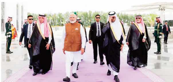
Prime Minister Narendra Modi has hailed Saudi Arabia as one of India's most values partners, and a trusted friend and ally, describing the current period as promising times for their ties having a "limitless potential".

Describing the India-Saudi Arabia partnership as having a "limitless potential" Prime minister Modi said the Saudi kingdom is a trusted and strategic ally of India. "In a world full of uncertainties, our bond stands strong, as a pillar of stability," Modi said prior to his third visit to the Kingdom since 2016. The PM emphasized that bilateral relations had expanded significantly