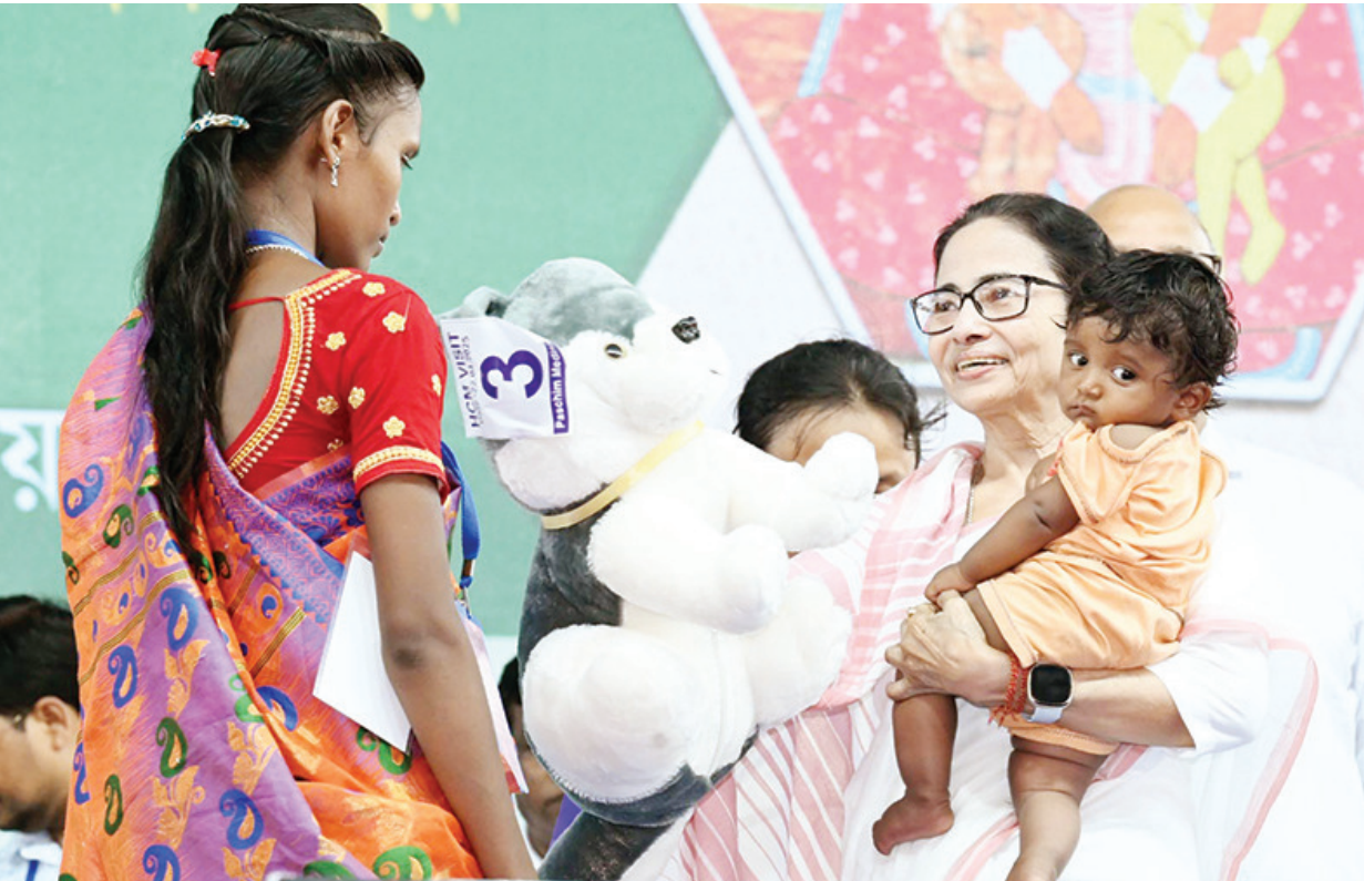
West Bengal Chief Minister Mamata Banerjee participated in a public distribution programme, where she extended the benefits of various state government schemes and services to the people, including children, at Goaltore in Paschim Medinipur on Tuesday.