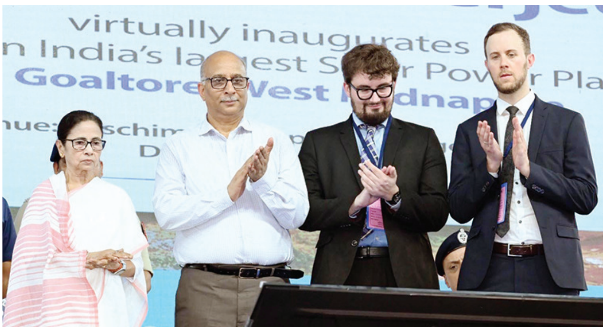
West Bengal Chief Minister Mamata Banerjee inaugurated solar power generation facility in presence of State Chief Secretary Manoj Pant and eminent foreign delegates at Goaltore in Paschim Medinipur on Tuesday.