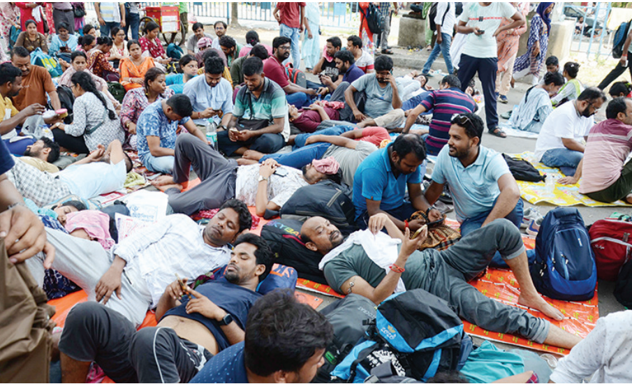
Teachers and non-teaching staff who lost their permanent jobs after the Supreme Court verdict took part in a protest. Tuesday marked the second day of the protest at SSC Bhawan in Salt Lake, Kolkata.