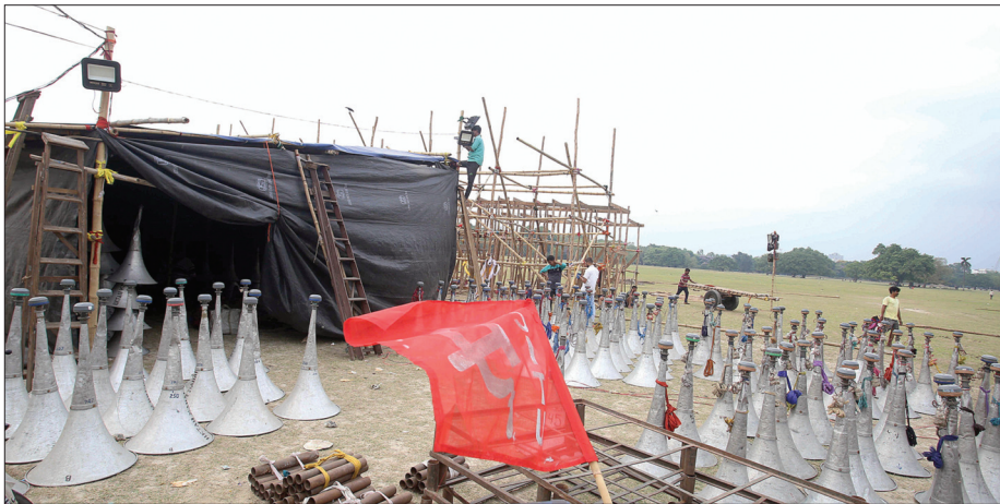
Preparation of CITU rally at Brigade Parade ground in Kolkata on Friday.

MI News Service, Kolkata: The West Bengal Legislative Assembly has decided to impose stricter regulations on health-related expense claims submitted by Members of the Legislative Assembly (MLAs), following a fresh controversy over a high-value medical bill. This renewed scrutiny particularly concerns eyewear and hospital bed expenses, which have long been points of contention. The Assembly has now capped reimbursements for spectacles at a maximum of 5,000 per MLA. This move comes in the wake of an earlier incident involving former Refugee Rehabilitation Minister Sabitri Mitra, who in 2013 submitted a medical bill amounting to 99,880. Mitra had claimed expenses for two pairs of spectacles, each costing 35,000 from a Park Street optician, along