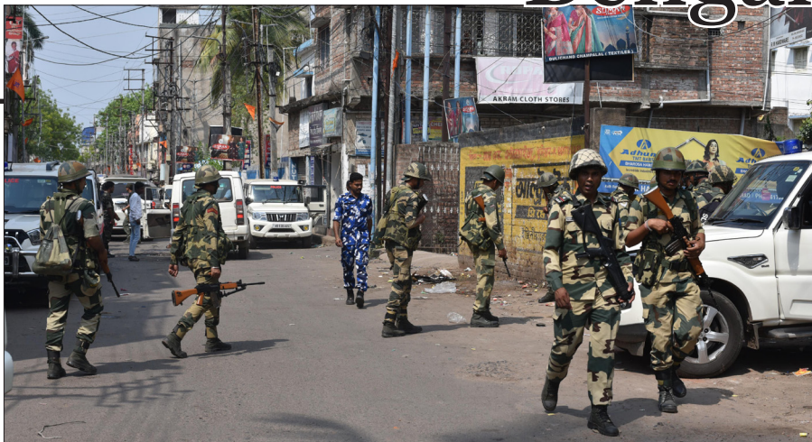
CRPF force marching at Dhuliyai in murshidabad on Friday.