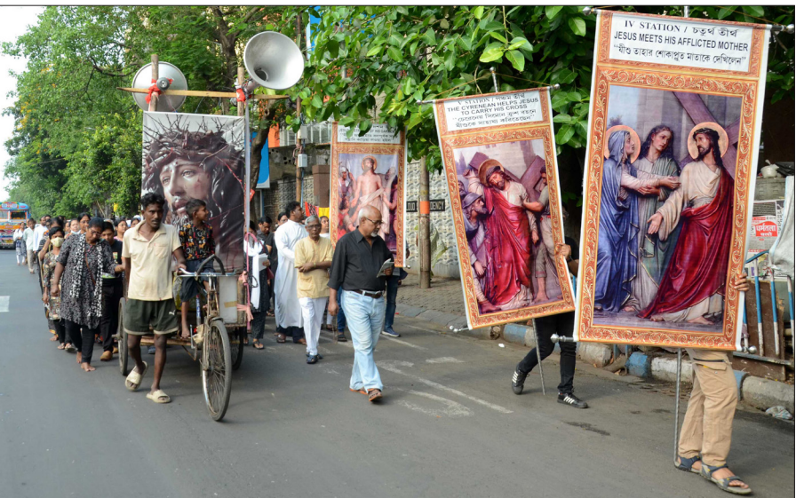
Christians community participated in a procession to mark Good Friday in Kolkata.