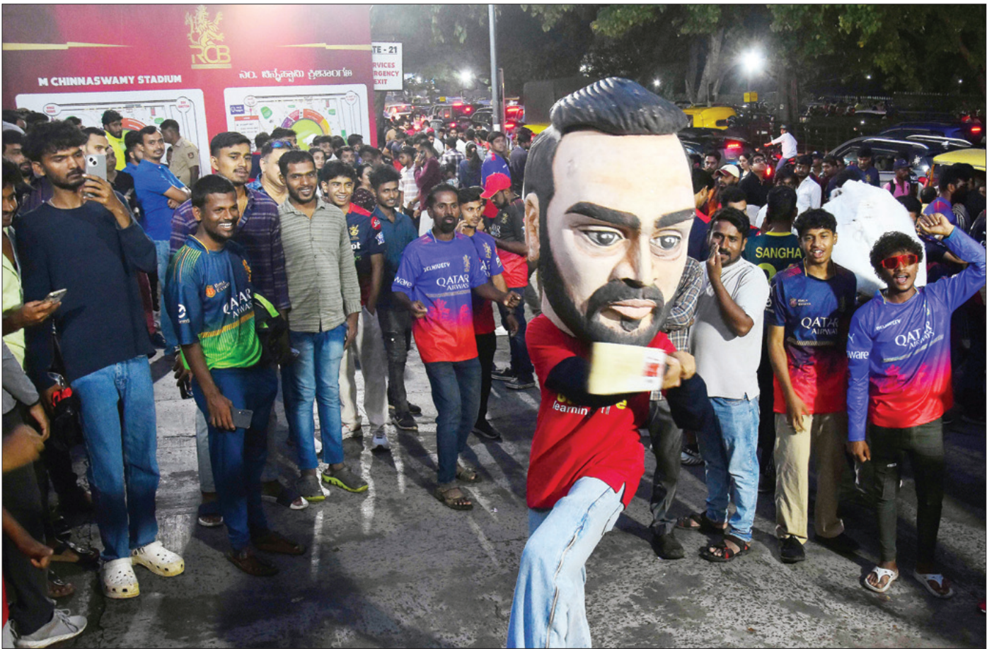
Cricket fans gather outside the stadium as rain delays the start of the 34th IPL 2025 match between Royal Challengers Bengaluru and Punjab Kings, at M. Chinnaswamy Stadium, in Bengaluru on Friday.