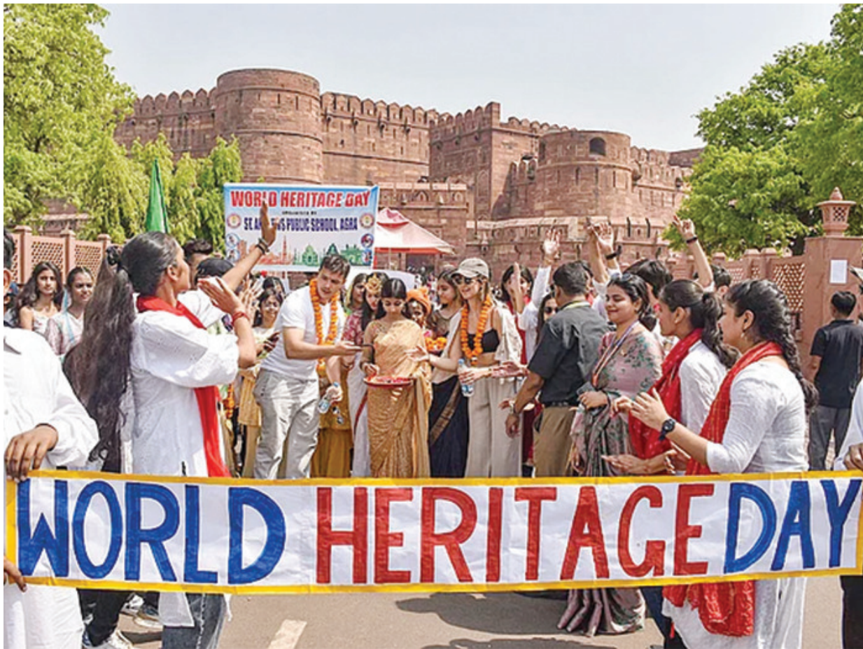
Students welcome tourists at the Red Fort on World Heritage Day, in Agra.

In response, the Houthis denounced the strikes as "a full-fledged war crime," dismissing the U.S. and the Yemeni government's accusations and insisting that "the port is a civilian, not a military facility." In a statement released Friday, the Houthis said the U.S. attacks are aimed at supporting Israel in crimes against the Palestinian people, vowing to continue their "support operations" for Palestinians. The group, meanwhile, claimed that it has successfully prevented all "Israeli navigation in the Red Sea." It also assured citizens in northern Yemen that "the oil supply is stable," while warning that "the U.S. crime will not pass without painful punishment."