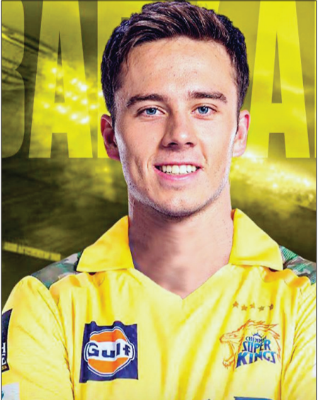
However, he's been in great form lately, finishing as the second-highest run-scorer in both