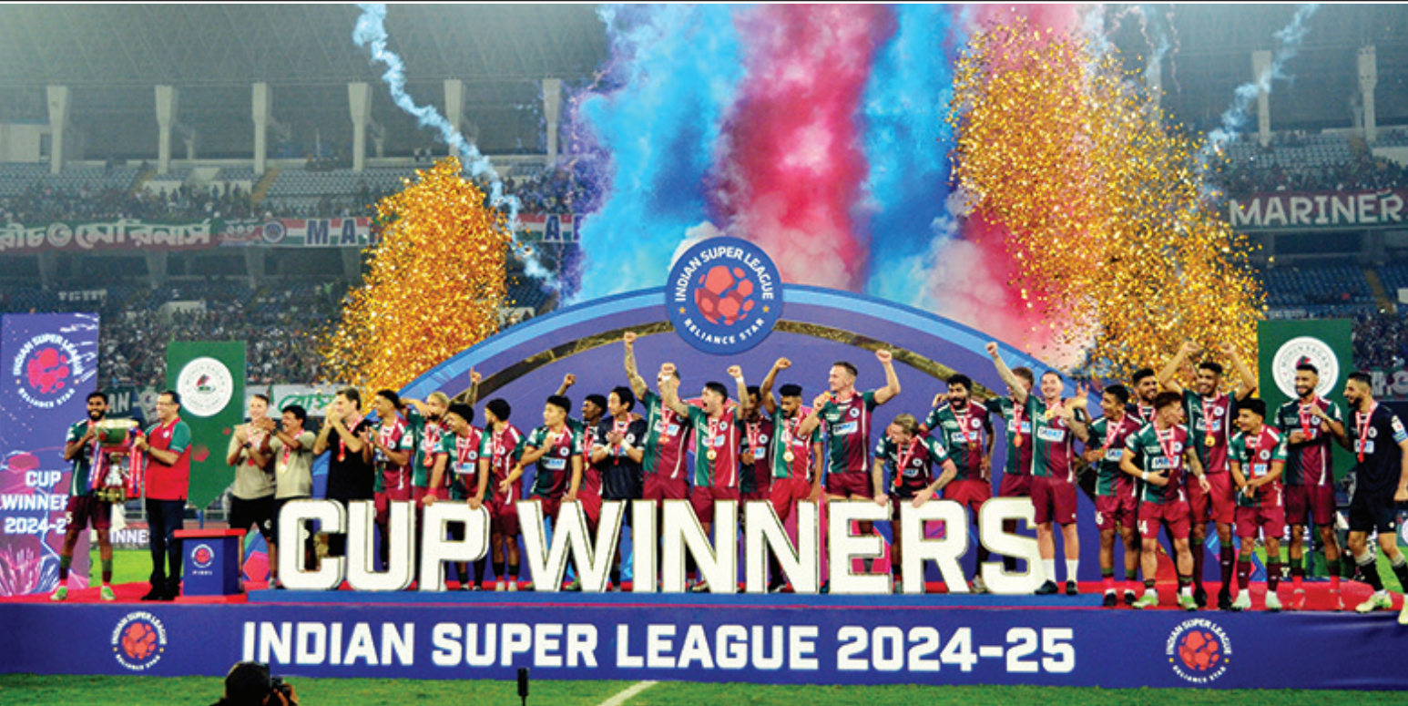
Mohun Bagan Super Giant team celebrates at the Salt Lake Stadium after winning the ISL Cup.