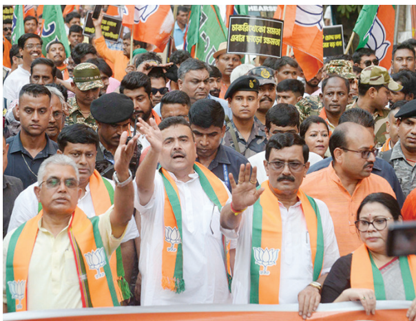
Union Minister and State BJP President Sukanta Majumdar, Opposition leader Suwendu Adhikari with other BJP leaders took part in a protest rally against the West Bengal Government in Kolkata on Sunday.

MI News Service, Darjeeling: At a time when communal tensions have been rising in the region—before Eid, during Ram Navami, and amid protests against the amended Waqf Act—Darjeeling MP Raju Bista, along with BJP MLAs from Siliguri and Dabgram-Fulbari, visited the Khoribari police station in the Phansidewa Assembly constituency of Darjeeling district on Saturday. The visit followed a disturbing incident of desecration at a temple ahead of Ram Navami. Miscreants allegedly vandalised the Maa Kali Mandir in Vivekananda Pally, Chakkarmari, Bhanjanpur, under the jurisdiction of Khoribari police station, leaving the local community shocked and outraged. “It has been more than 12 days since the incident happened, yet the police have failed to identify or apprehend the culprits responsible for this heinous act,” said Raju Bista. He also claimed that this was the third such instance of sacrilege in local temples, with no conclusive action taken in any of the cases.