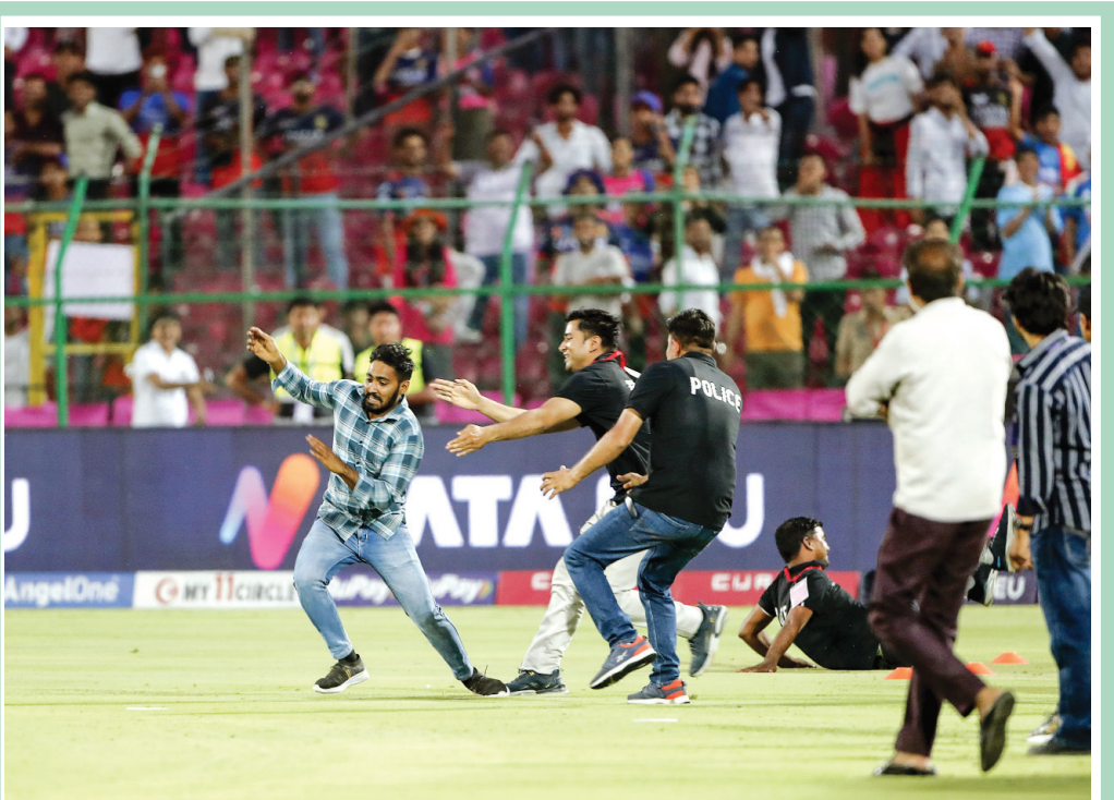
Security personnel try to stop a pitch invader, who entered the ground during the Indian Premier League (IPL) 2025 match between Rajasthan Royals and Royal Challengers Bengaluru, at Sawai Mansingh Stadium, in Jaipur on Sunday.

unbeaten 62 from 45 deliveries and his third fifty in the ongoing edition of the IPL. His sizzling 62 was laced with four boundaries and two maximums. Following its fourth win in the season, RCB moved to the third spot with eight points behind Delhi Capitals and Gujarat Titans.