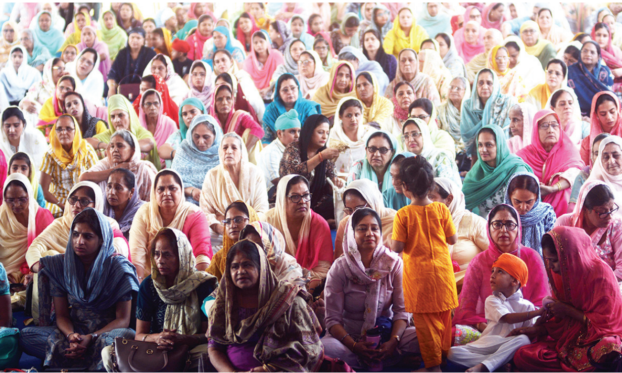
326th Khalsa Sajna Diwas & Baisakhi celebration at Sahid Minar maidan in Kolkata on Sunday.

"There were severe restrictions on when we could work. We had to stop our work every year for 15 days around Poila Boishakh, during the Gangasagar Mela and again between Durga Puja and Kali Puja because of the rush of devotees. Restricted work could be done on Tuesdays and Saturdays, and also during monsoon," an engineer said.