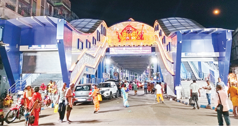
Kalighat Sky Walk is all set for a grand inauguration.

MI News Service, Kolkata: The Kalighat skywalk, which has been in the making for over four years, will be inaugurated on Monday. The trunk of the 435m-long skywalk takes off at the SP Mukherjee Road-Kali Temple Road intersection and ends outside the gates of the Kalighat temple. A 30-metre arm of the skywalk starts near the Kalighat fire brigade intersection and merges with the trunk near Kalighat police station. There are five points of entry or exit: from SP Mukherjee Road; outside the Kalighat temple; on Sadananda Road; at the Kalighat fire station intersection; and from the second floor of the new Kalighat Hawkers' Corner. The skywalk,