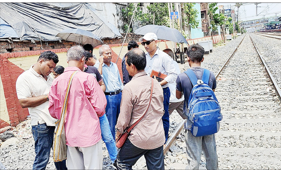
Special Drive at Ballygunje to apprehend offenders who are littering on Railway track.

With state-of-the-art manufacturing facilities in Haldia, West Bengal, MCPI operates at a robust capacity of 1.27 million tons per annum (MTPA) of Purified Terephthalic Acid (PTA). Leveraging proprietary Japanese technology, the plant is a model of energy efficiency, environmental compliance, and operational excellence. MCPI's PTA is a vital raw material for polyester, powering downstream applications across textiles, packaging, and industrial uses—placing the company at the heart of India's growing manufacturing economy.