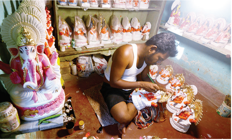
Preparations for the Lakshmi & Ganesh idols are underway in full swing for occasion of 'Poila Baishakh'.

"While chatting online personal details should not be shared. Most of these times most of the scammers are targeting multiple victims, and it can become difficult for them to keep track of their stories. Look for the loopholes" said an officer.