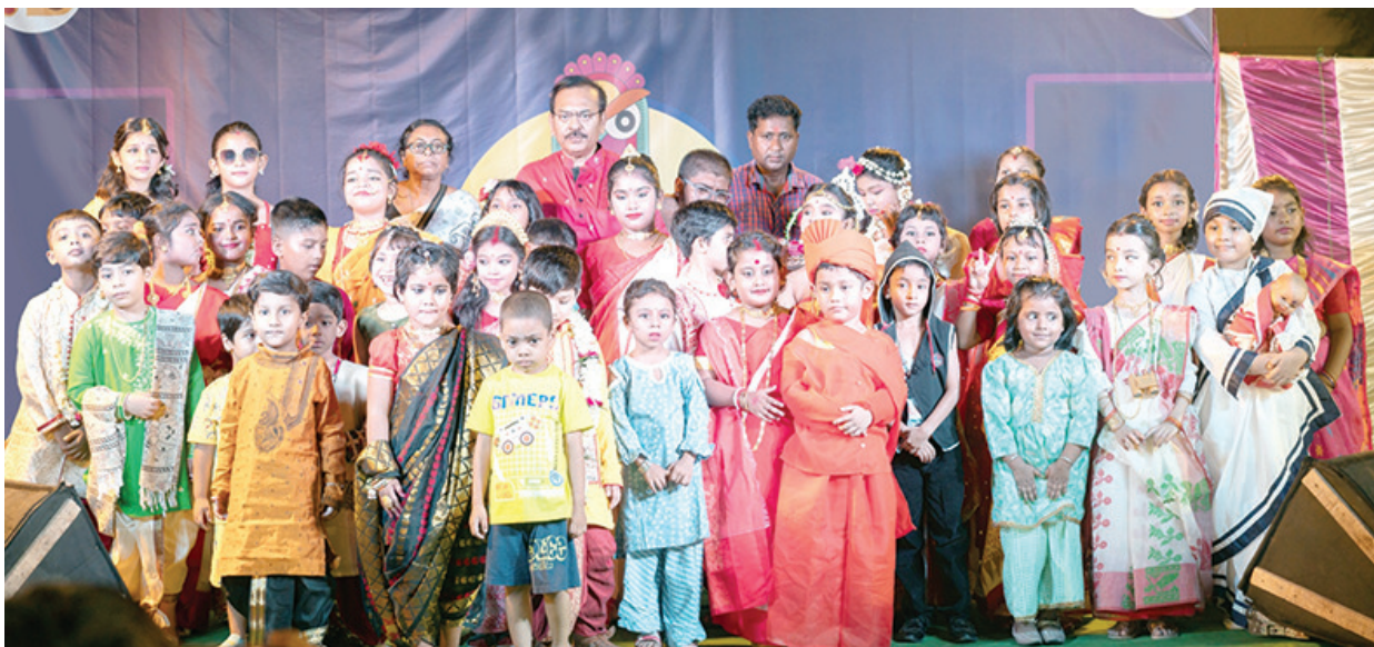
Minister Aroop Biswas attended a fashion show for children and young people on the occasion of the Bengali New Year, organized by 'Kolkata Arter Haat' in Ward No. 113, Tollygunge, on Saturday.