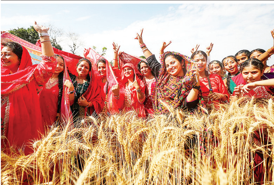
Women perform 'Bhangra' as part of the Baisakhi festival, on the outskirts of Jammu.

"Deliberations were also focused on opportunities for research, development, and demonstration (RD&D) using biomass-based biomanufacturing approaches. The DBT also participated in focused sessions on Biotechnology and Biomaterials during several visits and projects. "The participants highlighted how the BioE3 Policy promotes sustainable and low-carbon manufacturing of fuels, chemicals, and materials. The policy is designed to develop enabling technologies that foster an innovation-driven manufacturing ecosystem for a low-carbon future. Further, India's ef-