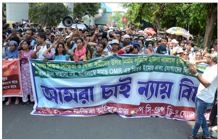
Teachers and non-teaching staff who lost their jobs following the Supreme Court verdict took part in a protest rally against the SSC, marching towards the SSC Bhawan in Salt Lake, Kolkata on Friday.

While healthcare drives by public representatives