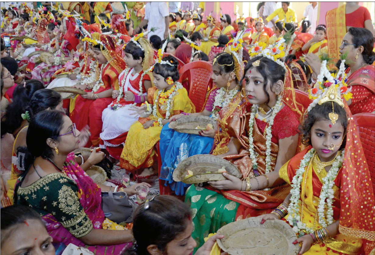
Girls participate in the 'Kumari Puja' ritual, which is part of the annual Hindu festival of 'Ram Navami' at the Adyapeath ashram on the outskirts of Kolkata on April 6, 2025.

walls. On Sunday, those slogans were seen covered with pictures of Lord Ram and Sri Aurobindo, and the national flag. The puja organisers said that Jadavpur University is Rishi Aurobindo's university, and the administration did nothing to remove the anti-national graffiti from the campus. Sri Aurobindo was the first principal of National College in Calcutta, which later became the Jadavpur University. The university had refused to grant permission to the students to celebrate Ram Navami citing the absence of the Vice-Chancellor. "In the absence of a Vice Chancellor, it is impossible to grant permission," the university stated. Besides, the university stated "several factors" for making the decision and pointed out that Ram Navami had never been celebrated on the campus.