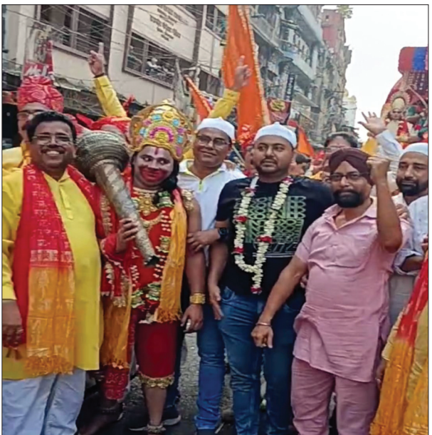
A peaceful Ram Navami procession was taken out by the MIA of Jora Sanko constituency in Kolkata's Badabazar constituency, in which water bottles were distributed by all the Muslim members of Kolkata Ehsaas Foundation. Seeing this sight, the people who took out the procession on Ram Navami were very happy to see Hindus, Muslims and Punjabis together and said that this is the beauty of their country, India.

rally. It's a spiritual congregation where people participate spontaneously. How can the police stop this rally, which has the necessary permissions?" Chatterjee said. The former MP later walked past the barricades and urged the rally participants to take an alternative route to avoid further confrontation. She was seen riding a two-wheeler at the start of the rally from a Ram Temple in New Town, and was joined by party leader Arjun Singh at its initial stage. The procession is scheduled to culminate at the Hanuman Mandir in Dum Dum.