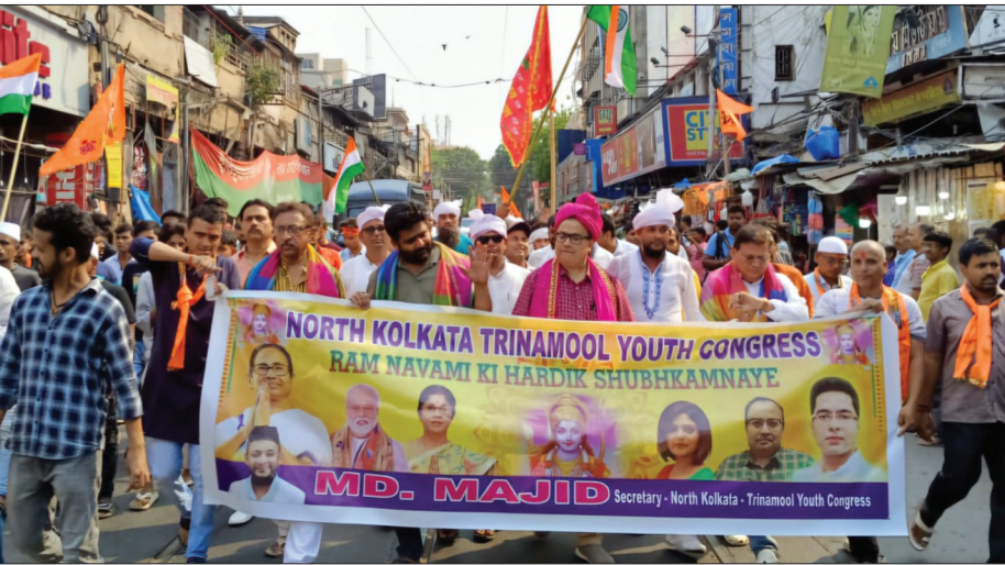
North Kolkata Trinamool Youth Congress procession was taken out on the occasion of Ram Navami in Kolkata on Sunday.

in an orderly manner. The state government and the efficient police force have strictly suppressed the misleading news that was spread in various areas regarding this procession. Despite the enthusiasm of the common people in the region, there is an atmosphere of harmony there.