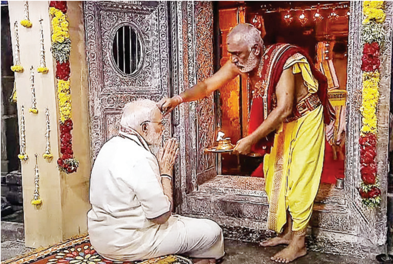
In this screengrab from a video posted by PM India website on April 6, 2025, Prime Minister Narendra Modi offers prayers at Sri Arulmigu Ramanaathaswamy Temple, in Rameswaram, Tamil Nadu.

MI News Service, Bhubaneswar: Rukuna Rath Yatra, the annual car festival of Lord Lingaraj, began on Saturday with thousands of devotees pulling the chariot in Bhubaneswar's Old Town amid tight security arrangements, officials said. The chariot could not reach the Mausima Temple as the sun set before the journey could be completed. It was pulled for only 200 metres along the Ratha Road. Pulling of the chariot will commence on Sunday morning, a priest said.