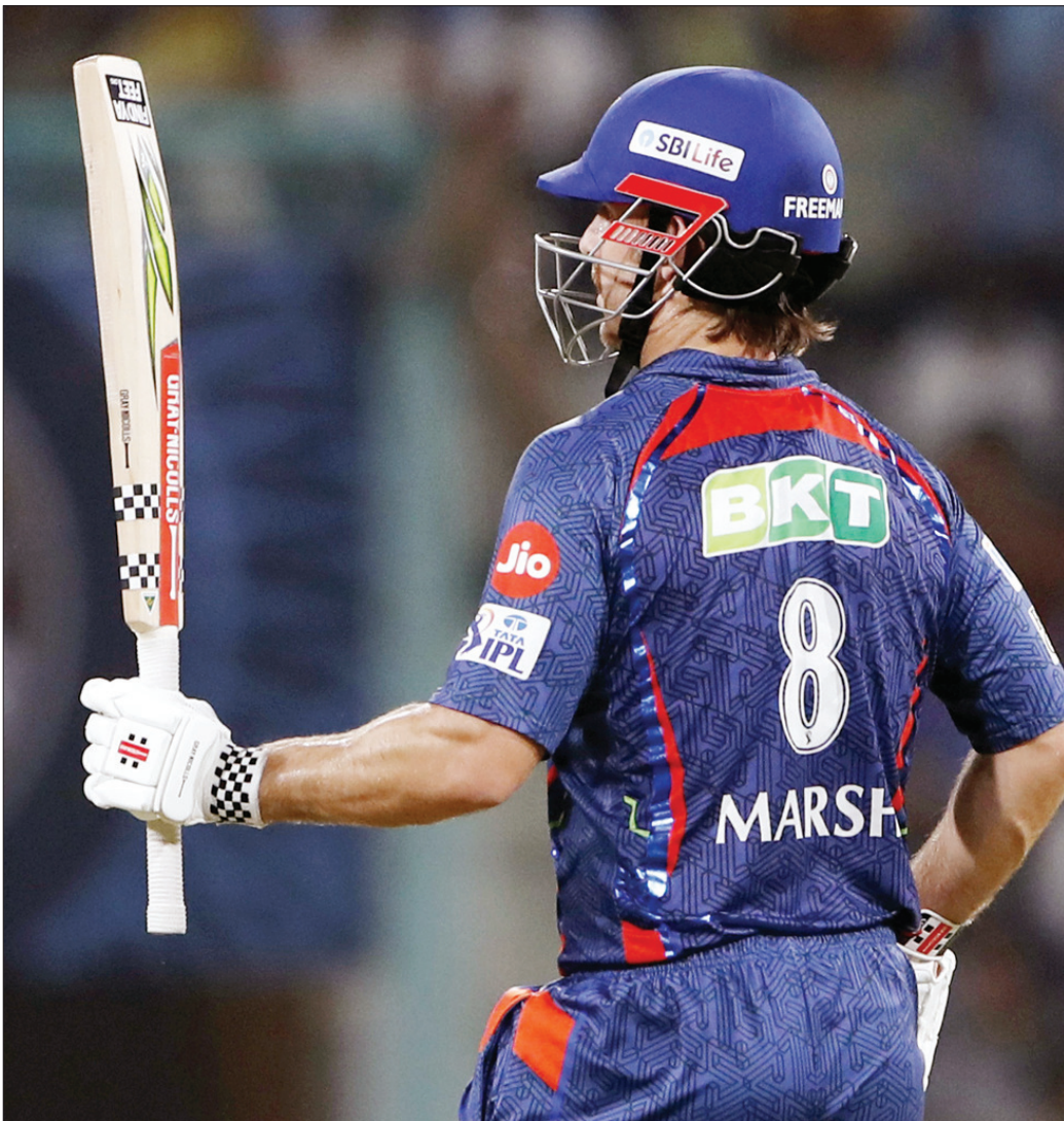
Lucknow Super Giants' Mitchell Marsh celebrates his half-century during the Indian Premier League 2025 match against Mumbai Indians, at Bharat Ratna Shri Atal Bihari Vajpayee Ekana Cricket Stadium, in Lucknow on Friday.

NEW DELHI [INDIA] : Gujarat Titans head coach Ashish Nehra gave a sneak peek into his coaching philosophy and mindset while advocating for captain Shubman Gill to take the franchise forward ahead of their upcoming fixture against Sunrisers Hyderabad in the ongoing Indian Premier League (IPL) 2025. With his calm demeanour, Nehra pulled the strings behind the scenes and lifted the Titans to the trophy in their maiden season in the cash-rich league in 2022. He continued with his role at the helm in the next season and laid the blueprint for GT to go all the way to the final to defend its title, but eventually falling short against Chennai Super Kings. If it weren't for Ravindra Jadeja flaunting his boundary-hitting muscle and smoking the ball away for 10 runs in the last two balls, Nehra and GT would have had two IPL titles in their first two seasons. With Nehra into his fourth year as GT head coach, Nehra allows his players to be themselves. In a fast-paced and long-format tournament, Nehra believes the key to success lies in offering players the much-needed stability. "For me, I don't see things only from a coach's perspective. Even if I put myself in the shoes of a player in such an environment—the hectic IPL, a long yet fast-paced tournament—the first thing players need is stability. That's how I feel.