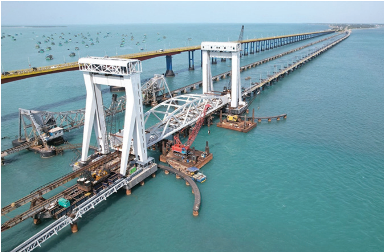
The newly built Pamban Bridge, connecting Rameswaram to mainland India, has given Indian infrastructure a new identity.

Of the 16 sorties, 15 crossed the median line and entered Taiwan's northern and southwestern ADIZ (Air Defence Identification Zone). In a post on X, the MND said, "16 sorties of PLA aircraft, 9 PLAN vessels and 2 official ships operating around Taiwan were detected up until 6 a.m. (UTC+8) today. 15 sorties crossed the median line and entered Taiwan's northern and southwestern ADIZ. We have monitored the situation and responded accordingly." Earlier on Thursday, Taiwan detected 59 Chinese aircraft, 23 Chinese naval vessels and eight official ships operating around itself as of 6am (local time), a statement by the Taiwanese Ministry of Defence said. Of the 59 aircraft, 31 sorties crossed the median line and entered Taiwan's northern, central, southwestern, and eastern ADIZ (Air Defence Identification Zone).