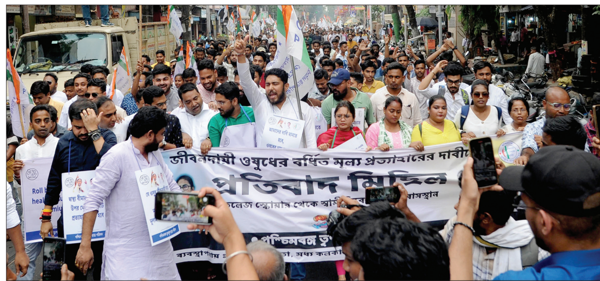
Minority community people took part in a protest for Waqf protection, and demanded the withdrawal of recent amendments to the Waqf Bill, in Kolkata on Friday.

While China has quantified the aid it has despatched to Myanmar, India has maintained that it does not believe in putting a monetary value to the humanitarian aid it extends to countries in times of crisis. However, according to informed sources more than 240 tonnes of relief materials of different kinds were sent to Myanmar by the government of India for the earthquake victims in Myanmar alone.