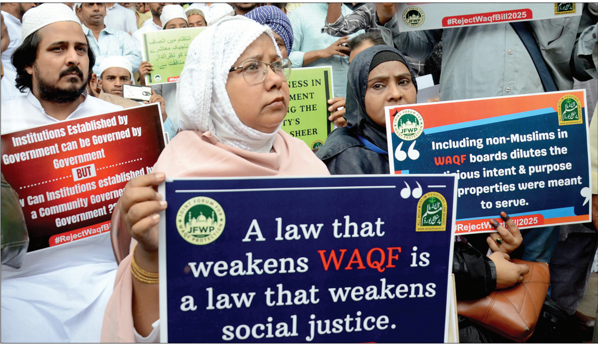
People from muslim community took part in a protest rally against recently passed Waqf(Amendmend) Bill in Kolkata on Friday.

historically marginalised Muslims. We remain committed to prioritising the dignity of every citizen. This is also how we build a stronger, more inclusive and more compassionate India," Modi asserted. Meanwhile, also taking strong exception to the passage of the Waqf Bill in Parliament, Tamil Nadu Chief Minister and DMK president M K Stalin has also reiterated that his party would soon file a case in the Supreme Court against the Bill. Wearing a black badge as a mark of protest against the passage of the Bill, the Chief minister said it was done "at the behest of a few allies" despite the opposition of the majority parties in India. "This is an attack on the structure of the Constitution," he lamented. "I would like to inform you that a case will be filed in the Supreme Court on behalf of the Dravida Munnetra Kazhagam (DMK) against this controversial amendment. Tamil Nadu will fight to the end against the Union government's law which destroys the autonomy of the Waqf Board and threatens the minority Muslim population," Stalin said in the state Assembly on Thursday while pointing out that they had already passed a resolution in the Assembly on March 27.