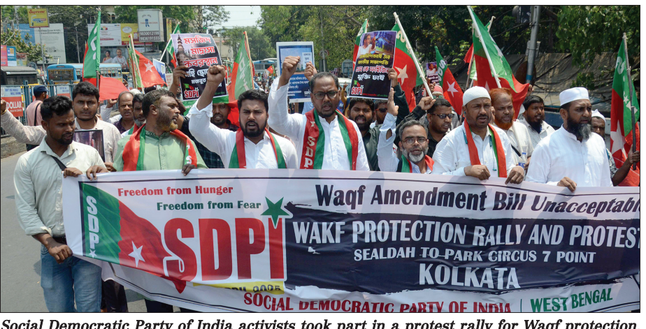
Social Democratic Party of India activists took part in a protest rally for Waqf protection, and demanded the withdrawal of recent amendments to the Waqf Bill, in Kolkata

The stipulation that the individuals who practiced Islam for at least five years only can donate properties to Waqf will prevent non-Muslims from donating properties to Waqf which will hinder the syncretic culture of the country. Since the existing Waqf Act, 1995 is adequate and has clear-cut provisions to safeguard the interest and properties of Waqfs, it is our view that there is no need for such far reaching amendments to the existing Waqf Act, 1995. Considering all such aspects, the Tamil Nadu Assembly on March 27, 2025 passed an unanimous resolution to urge the union government to completely withdraw the proposed Waqf (Amendment) Bill, 2024, the Chief minister in his letter to the PM said.