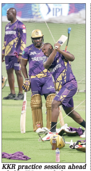
of the IPL match between KKR and SRH at Eden Gar-

marking the beginning of this ambitious endeavor. The Mega Cycle Rally featured two teams that commenced their journey simultaneously from the eastern and western coasts of India. In addition to the 125 CISF personnel, more than 1,100 participants joined the Cyclothon at various stages, reflecting strong public support for the initiative. This effort underscores CISF's ongoing commitment to safeguarding India's extensive coastline, which hosts over 250 ports, including 72 major ports that handle 95% of the country's trade by volume and 70% by value.