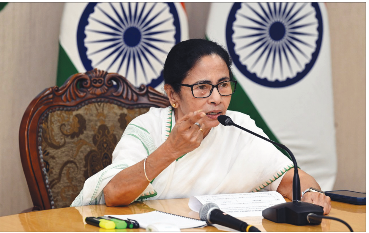
West Bengal Chief Minister Mamata Banerjee at a press conference at Nabanna in Howrah.