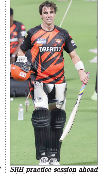
of the IPL match between KKR and SRH at Eden Gar-dens in Kolkata.