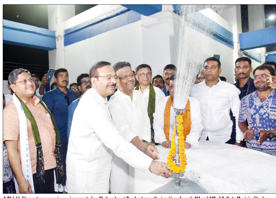
A 21-lakh-liter water reservoir was inaugurated on Wednesday at Ramkantapur, the junction of wards 114 and 142 of Kolkata Municipality, by Kolkata Mayor Firhad Hakim and Minister Aroop Biswas. Municipal representatives from Boroughs 11 and 16 were present. The project cost Rs 38

Kolkata: In a bid for promoting coastal security awareness to curb restriction on drugs and weapon sellings across coastal lines, 125 dedicated cyclists jawans including 14 women personnel from Central Industrial Security Force (CISF), Bengal unit completed the arduous journey, covering the 6,553 km distance across 11 states and Union Territories in 25 days and finally reached at Vivekananda Rock Memorial in Kanyakumari in Tamil Nadu to conclude the Cyclothon 2025. The Cyclothon was virtually flagged off by Union Home Minister, Amit Shah, on 7 March, from the Rajaditya Regional Training Centre, Thakkolam, Tamil Nadu, setting the stage for this ambitious