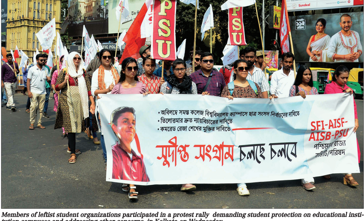
Members of leftist student organizations participated in a protest rally demanding student protection on educational institution campuses and addressing other concerns, in Kolkata on Wednesday.