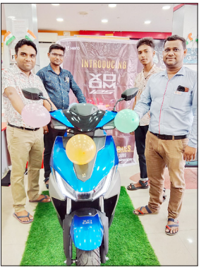
diamond-cut alloy wheels fitted with chunky tyres, including a 120-section one at the rear. Xoom 125 is available in 4 colour options: Metallic Turbo Blue, Matt Storm Grey, Inferno Red, Matt Neon Lime.

MI News Service, Ausgram: A new horizon in scooter was launched at Sinha Automobile Hero showroom in Abhirampur, Ausgram, East Burdwan on Wednesday.