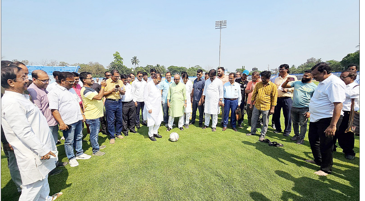
The work of replacing the astroturf with grass field at Vidyasagar Sports Ground in Barasat along with the construction of swimming pool, table tennis, badminton and cricket infrastructure is almost complete. Sports Minister Aroop Biswas went to the Vidyasagar Sports Ground in Barasat on Wednesday to supervise the work. MP Partha Bhowmik, Minister Rathin Ghosh, MLA Jyotipriya Mallick, MLA Rabiul Islam, District Magistrate, District Superintendent of Police, IFA President Ajit Bandopadhyay and officials of the Sports Department were present.

The government believes that if sufficient storage units are established, onion production will increase, making the state self-reliant in onion supply.