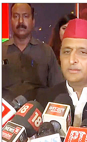
issues concerning people's livelihood, health, and security.

MI News Service, New Delhi: Samajwadi Party (SP) Chief Akhilesh Yadav on Wednesday accused BJP of using history to gain political mileage and divide the country on religious and caste lines.