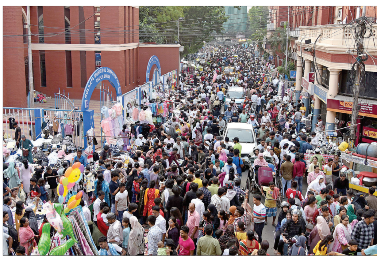
Crowd throng New Market for Eid shopping.