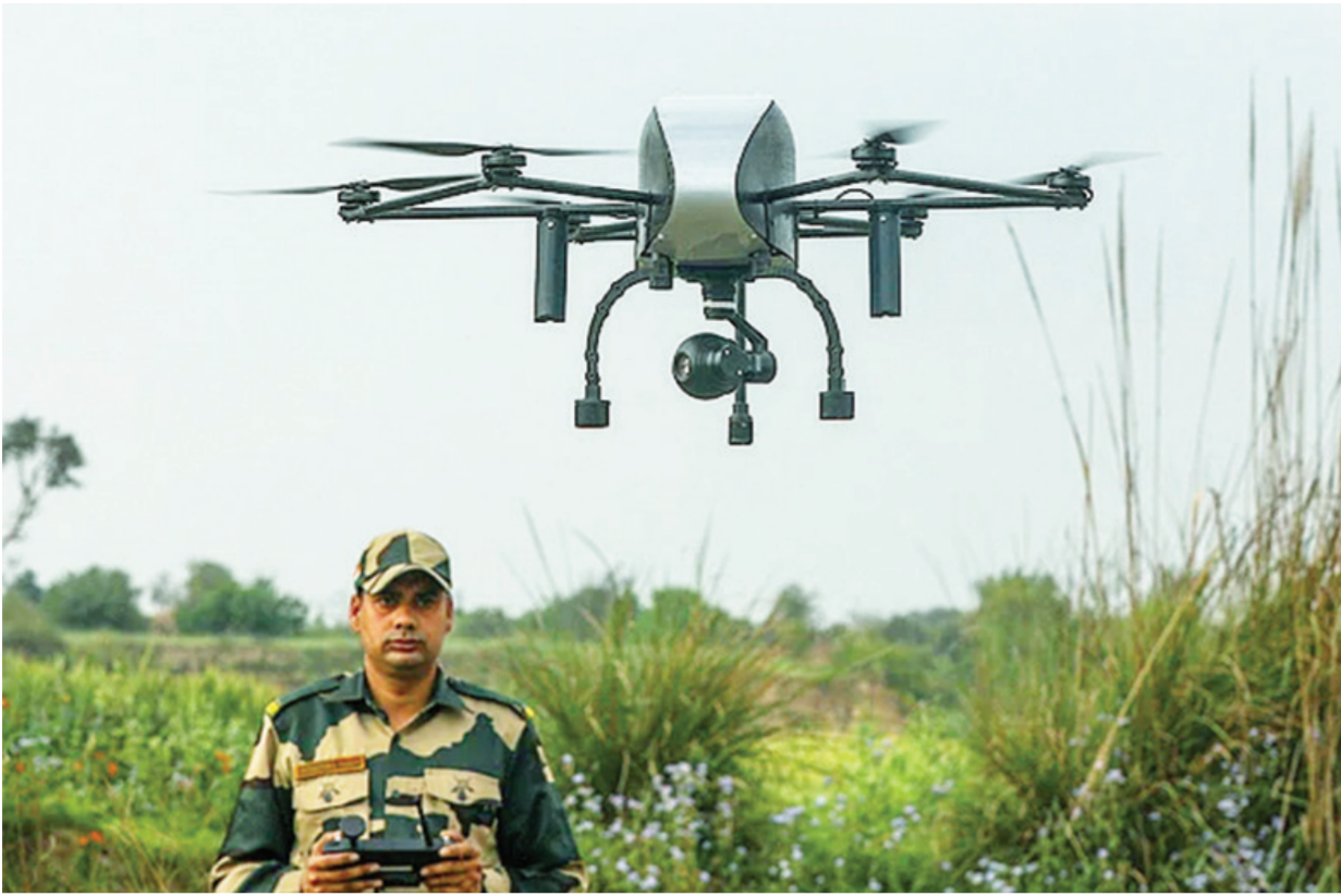
A Border Security Force (BSF) jawan uses a drone during the fourth day of the search operation following suspicious movements in the Hiranagar sector area, in Kathua district.