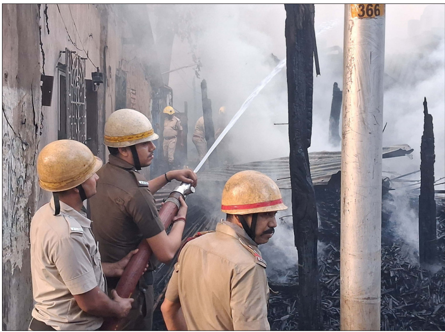
Fire fighter fighting against fire at Belegkata godown in Kolkata on Wednesday.