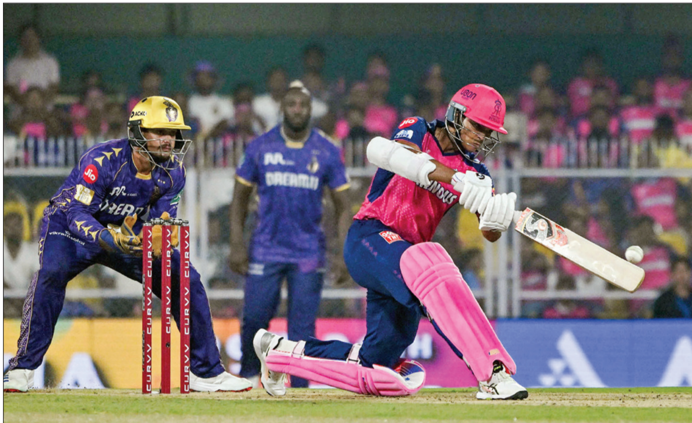
Rajasthan Royals' Yashasvi Jaiswal plays a shot during the match against Kolkata Knight Riders in the Indian Premier League 2025, at Barsapara Cricket Stadium in Guwahati on Wednesday.

RANCHI : To participate in the U-20 Junior National Wrestling Competition, Jharkhand State U-20 Junior Men Greco Roman Style Men and Women Freestyle one day wrestling competition cum selection trial will be organized on March 29 at 10 am at Ganpat Rai Indoor Stadium Khelgaon Ranchi. Wrestlers up to 20 years of age from 2005, 2006, 2007 can participate in this competition and participants of 17 years (2008 date of birth) can participate with a medical certificate / parental certificate. Players will be required to bring along with them the birth certificate issued by Panchayat or Nagar Parishad, Aadhar card, original and photocopy of residential certificate and their passport size photo to participate in the selection trial.