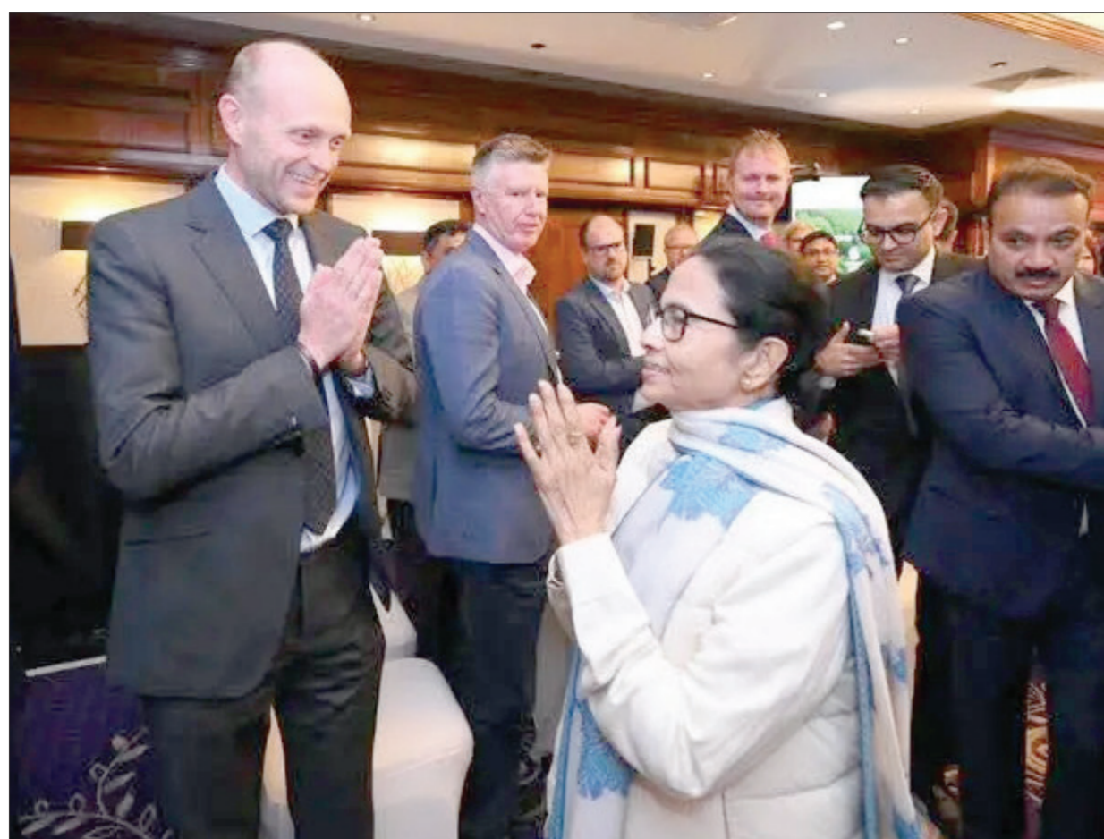
West Bengal Chief Minister Mamata Banerjee interacts with British industry leaders and exchanges greetings at a meeting called 'Opportunities in West Bengal' during her visit in London.