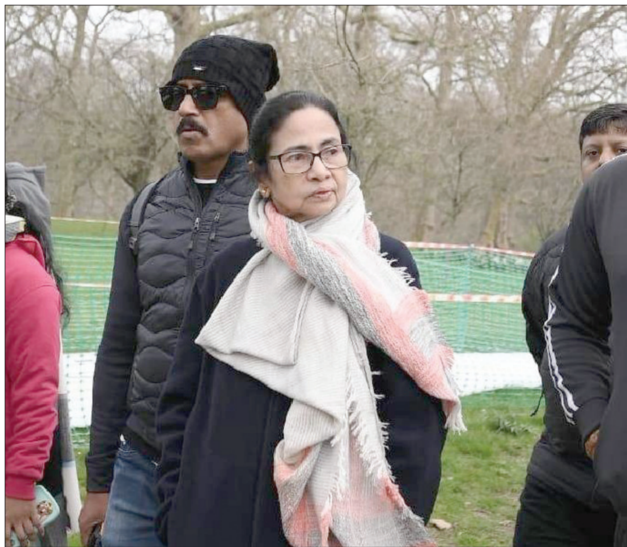
West Bengal Chief Minister Mamata Banerjee in her usual morning walk in London's famous Hyde Park on the second day of her visit to the British capital.