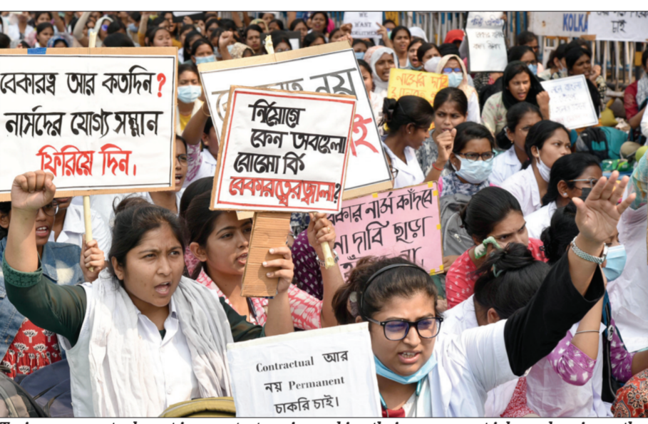
Trainee nurses took part in a protest again, seeking their permanent jobs and various other demands in Kolkata on Tuesday.

Stressing that the Modi government has always been sympathetic towards the employee and pensioner issues, Sitharaman said the government has implemented the full parity between pensioners of pre and post-seventh Central Pay Commission.