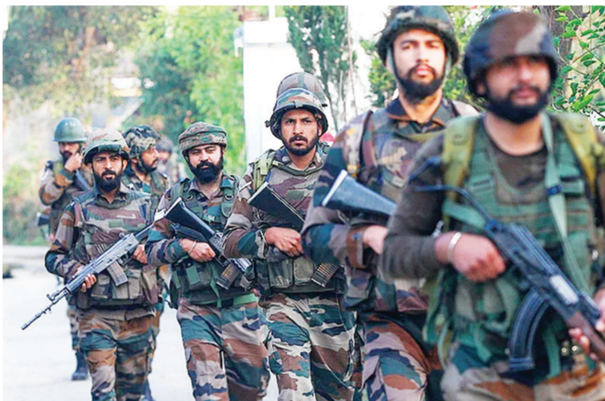
Army jawans during the third day of the search operation following suspicious movements in the Hiranagar sector area, in Kathua district.

MI News Service, Abu Dhabi: The Cybersecurity Council of the UAE Government has confirmed that the national cybersecurity systems have successfully dealt with cyberattacks targeting 634 government and private entities. These attacks aimed to leak data from vital and strategic sectors in the UAE and were addressed using the best global practices in this critical field. Mohamed AlKuwaiti, Head of Cybersecurity for the UAE Government, told the Emirates News Agency (WAM) that a threat actor known as "rose87168" claimed to have breached the Oracle Cloud's SSO and LDAP, resulting in the leak of approximately six million customer records globally, including sensitive user password data. He added that estimates suggest around 1,40,000 entities worldwide may have been affected by the breach, including 634 entities in the UAE—of which 30 are government entities, 13 are private, and the rest fall under other categories. The Cybersecurity Council clarified that emergency cybersystems have been activated across the country in coordination with relevant authorities to safeguard the UAE's cyberspace and strengthen its protection against any attempts of hacking or threats.