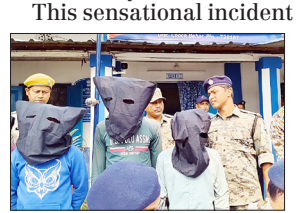
This sensational incident

MI News Service, Cooch Behar: Three youths have been accused of attempting to rape a ninth-grade student in front of her mother in Malda. The mother herself was attacked while trying to save her daughter. They were allegedly threatened on the street even when they went to file a complaint at the police station. Meanwhile, four youths have been accused of raping a housewife in Cooch Behar. The police have arrested three of them. One is still absconding. A search has been launched in full force to find him. Interrogation is underway.