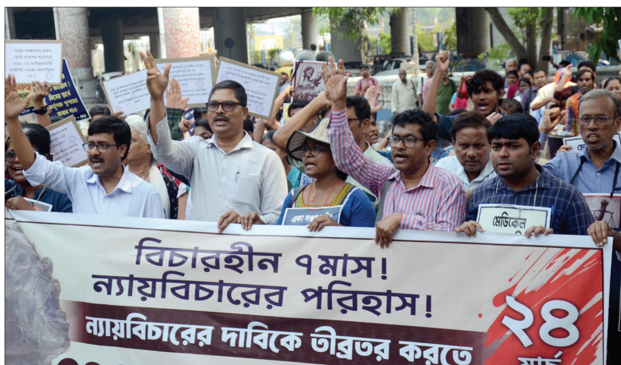
Doctors, Nurses took part in a protest rally against the barbaric rape and murder case at RG Kor Hospital for justice during their march to CGO complex at Salt Lake in Kolkata on Monday.