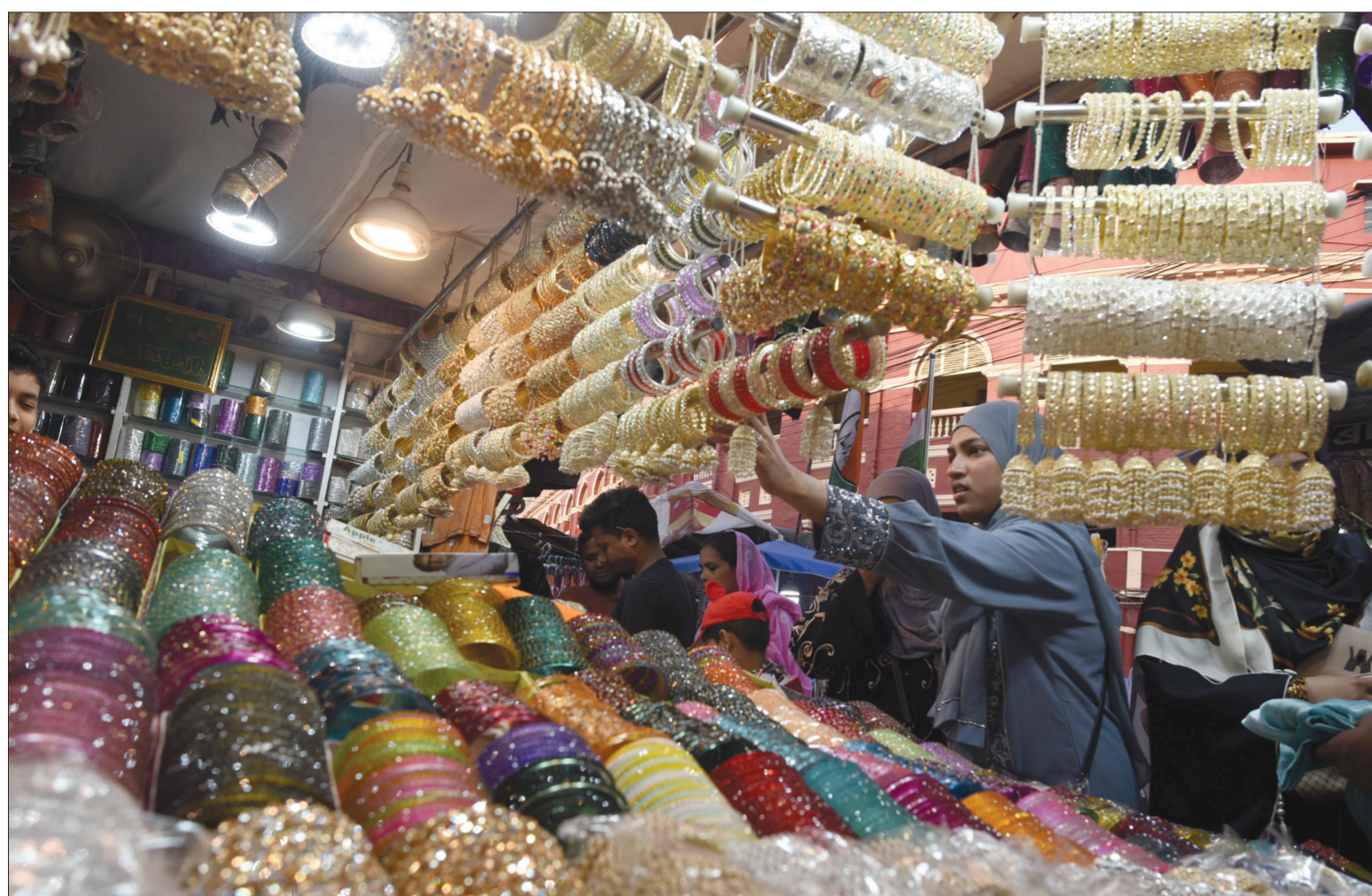
With Eid-ul-fitr knocking the door, women flock at New Market on Monday where variety of bangles are at display in a shop.