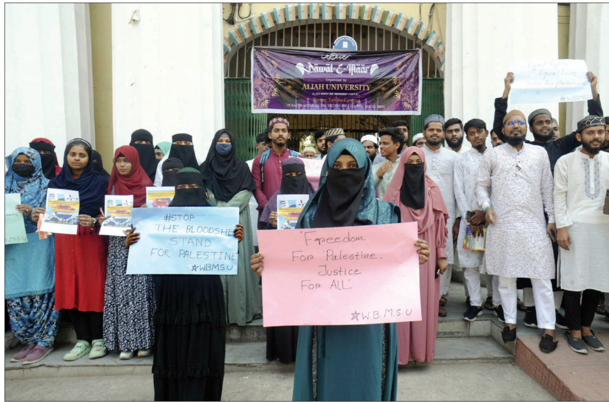
Students of Aliah University protest in solidarity with Palestine, at their college in Kolkata.

The bench said in the present case, the appellants had approached the territorial police station on July 21, 2023 and September 9, 2023 respectively for registration of an FIR, alleging foul play and commission of offence under the Scheduled Castes and the Scheduled Tribes (Prevention of Atrocities) Act, 1989.