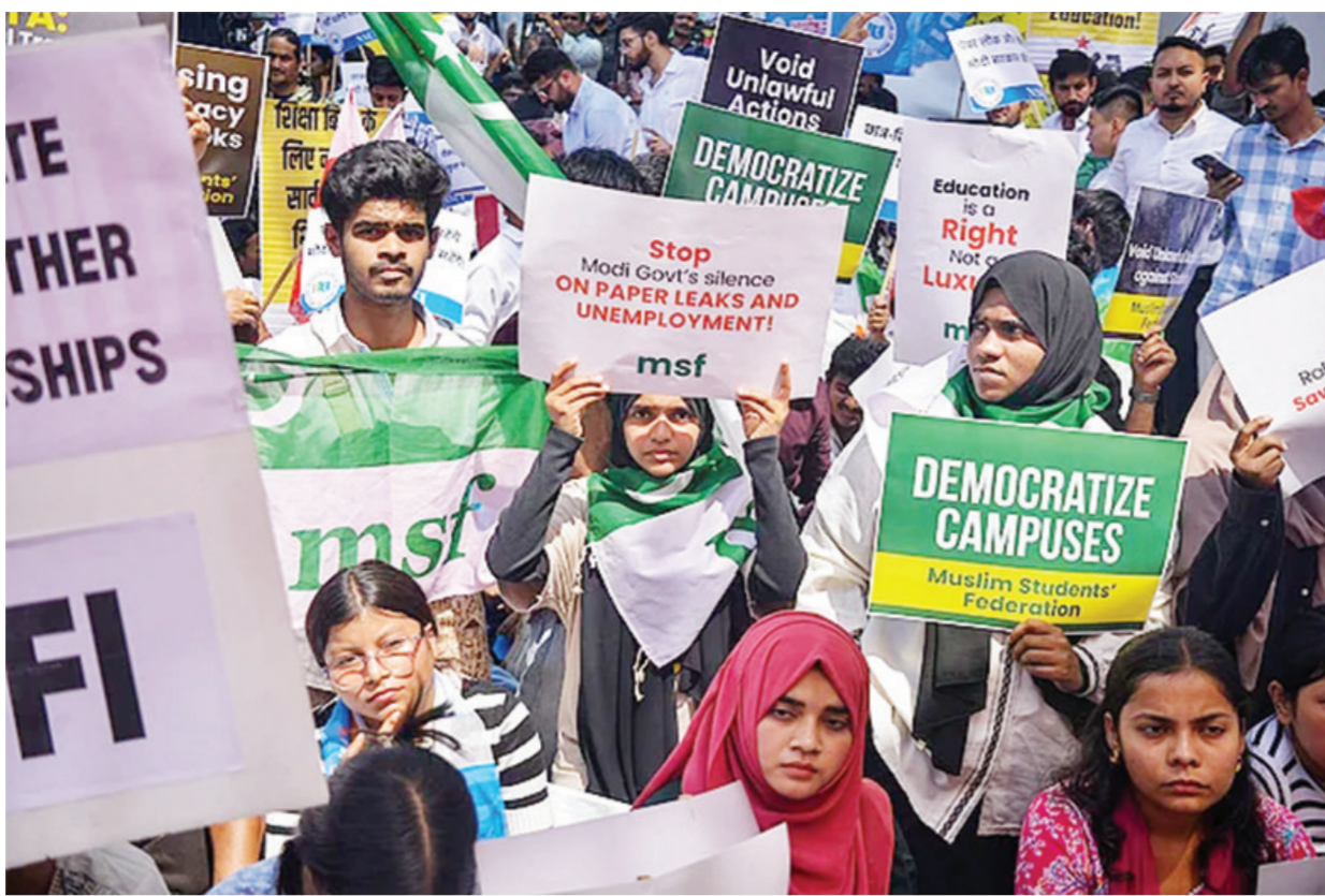
INDIA alliance student organisations supporters protest against National Education Policy, at Jantar Mantar in New Delhi.