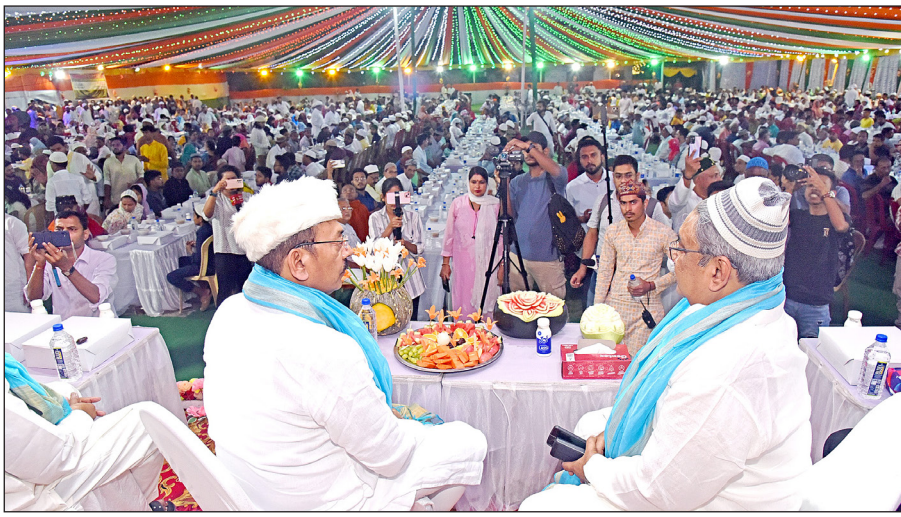
Minister Aroop Biswas joined the Daawat-e-Iftar with 4,000 fasting people in 94 wards under the Tollygunge Assembly. Representatives of all communities, including Chief Entrepreneur Municipal Representative Sandeep Nandi Majumdar and all the municipal representatives of Tollygunge were present.