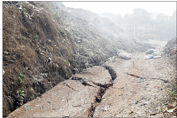
While repairing the underground water pipeline, a large area of Howrah Belgachia collapsed

MI News Service, Kolkata: Nine kilometres from Kolkata lies the Belgachia Vagar area, (garbage dumping ground), in Howrah district, resembling an earthquake-ravaged zone. Cracked roads and over 100 collapsed houses have left residents, including women and children, stranded on the streets with their belongings, and without access to food,