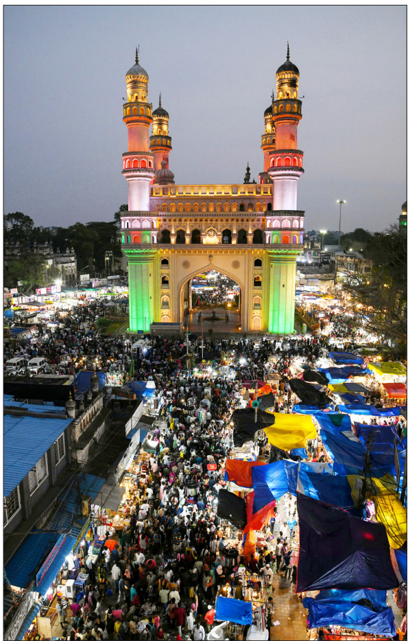
Hyderabad: A view of the illuminated Charminar surrounded by a bustling night bazaar during the ongoing month of Ramadan, in Hyderabad on Sunday.