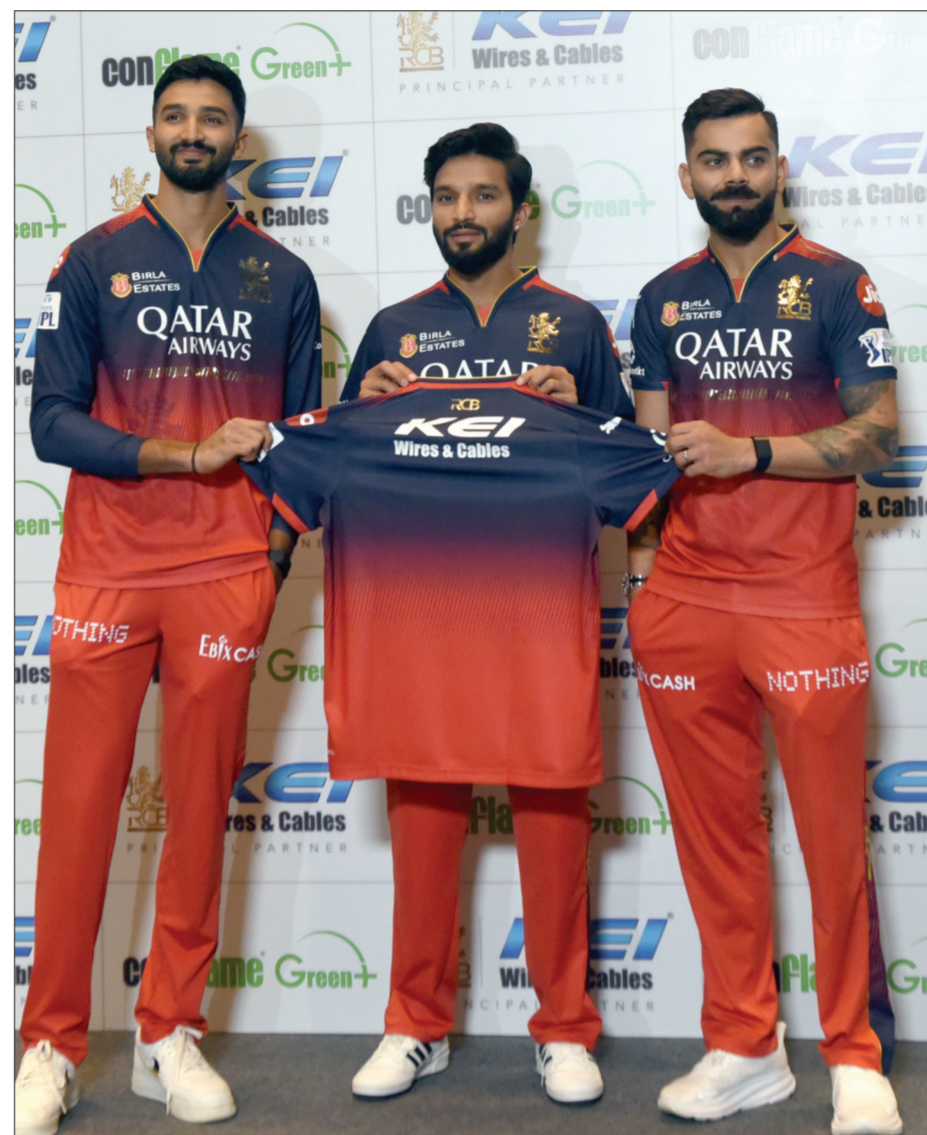
RCB players Virat Kohli, Rajat Patidar, Devdutt Padikkal during jersey launch in Kolkata.

standards. Against this backdrop, the alarming spread of counterfeit drugs across districts has raised concerns about public health risks. The CID's probe is expected to shed light on the distribution channels and regulatory lapses that enabled the illicit trade to flourish. As the investigation unfolds, authorities remain vigilant to prevent further circulation of spurious medicines, ensuring stringent actions against those responsible for endangering public health.