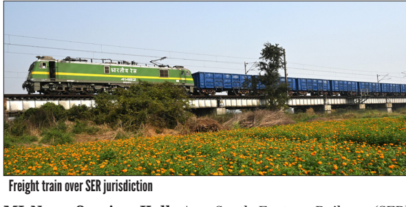
Freight train over SER jurisdiction

MI News Service, Kolkata: South Eastern Railway (SER) has achieved a major milestone in freight transportation by crossing 200 Million Tonnes mark in current Financial Year. Till date, SER has loaded 204 MT of freight in the current fiscal. This is a stellar performance by South Eastern Railway.