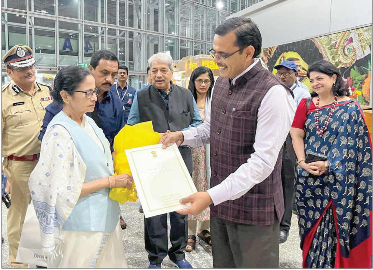
West Bengal Chief Minister Mamata Banerjee received warm wishes from State Governor C.V. Ananda Bose, conveyed through his representative, as she departed for London from Kolkata on Saturday.

On Saturday, Chief Minister Devendra Fadnis said it was too early to comment on a foreign or Bangladeshi link to the Nagpur violence as the probe was underway. Fadnis said 104 individuals have been identified so far, following an analysis of CCTV footage and video recordings. Action has been initiated against 92 persons, as per the law. He also asserted that the cost of the damage of government property would be recovered from the perpetrators of violence in Nagpur.