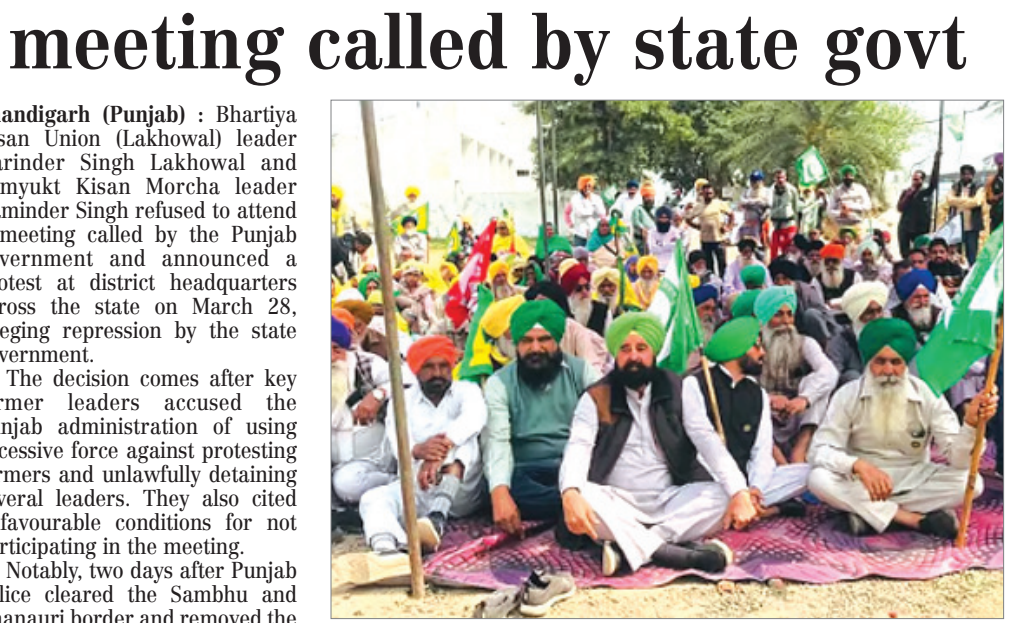
"Central govt had invited those farmer leaders for a meeting, and the Punjab govt was also a part of that meeting...still, these leaders were jailed...this is not the way that they first invited someone and then held them as they were returning. Democratic space is being curbed, "he added. "We have decided to hold a demonstration outside district headquarters and have appealed to all farmers to participate in it," he added further.

...During the meeting we held here, we have reached this conclusion that efforts are being made to make Punjab a Police state...farmers