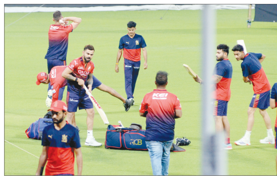
RCB's practice session ahead of the IPL opening match against RCB at Eden Gardens, Kolkata.