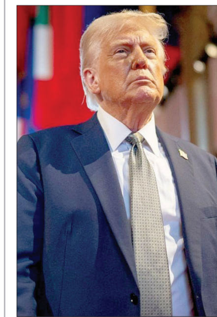
US President Donald Trump speaking at a podium.