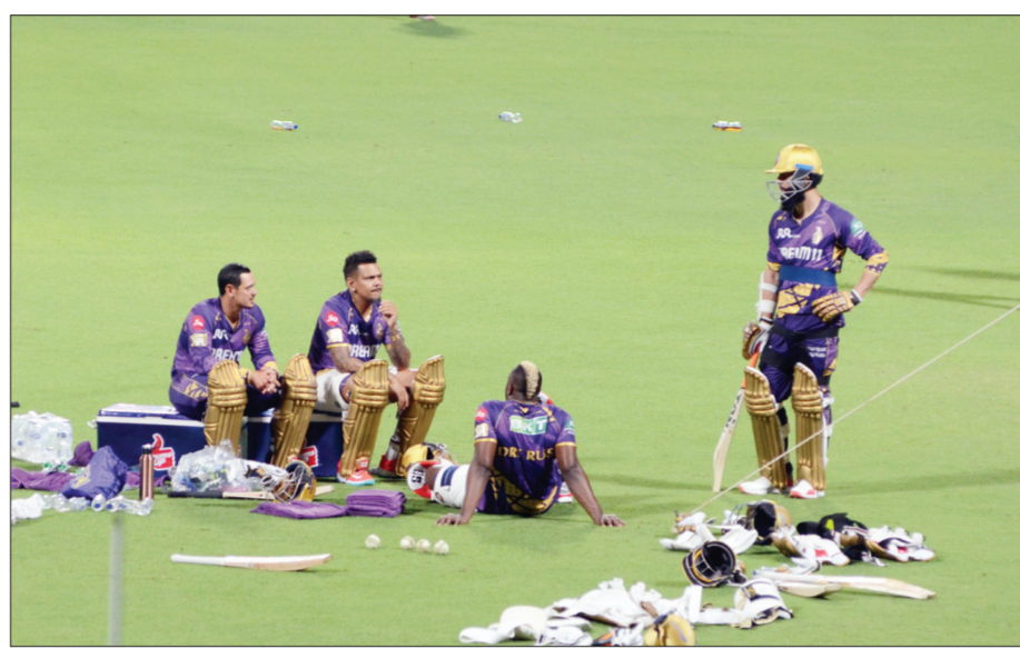
Knights in Action: Kolkata Knight Riders Team gears up with intense practice at Eden Gardens, in Kolkata on Thursday.

pipeline has been started on a war footing. However, it is not yet clear how long it will take to complete the work. It was initially said that it may take more than two days to control the situation. The chairman of the municipality said, "Water tankers are being sent to the areas to deal with the drinking water crisis of the residents. Vehicles are also being brought in from Kolkata Municipality for this." On the other hand, residents say that they are facing difficulties due to lack of water. People in the areas of Shibpur faced significant difficulties in the evening when they were preparing for Iftar.