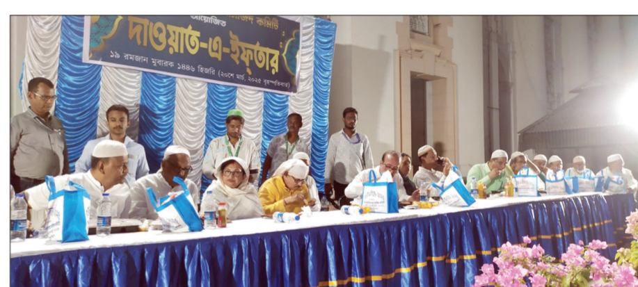
The Iftar organized by the West Bengal Legislative Assembly Mosque Committee saw the presence of Speaker Biman Banerjee, Ministers Firhad Hakim, Chandrima Bhattacharya, and Siddiquillah Chowdhury, along with other MLAs, officers, and employees at the Legislative Assembly campus.

meeting, alleging political favoritism in the selection process. The appointments have drawn criticism from the opposition, which has raised concerns over conflict of interest and political affiliations. Meanwhile, the state government has defended the decision, asserting that the selections were made in adherence to legal procedures and administrative merit.