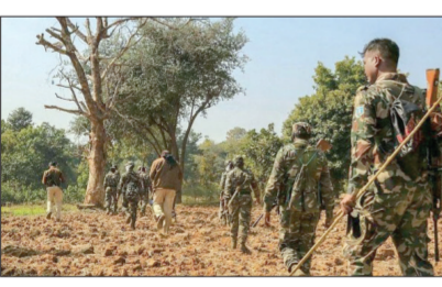
Security forces conducting an anti-Naxalite operation in a forest area in Bijapur district.