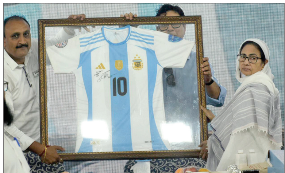
West Bengal Chief Minister Mamata Banerjee was presented with an Argentina jersey signed by footballer Lionel Messi during an iftar party organized by Firhad Hakim at Ekbalpur on Wednesday.

stall government recruitment. Additionally, the Chief Minister announced that she would be attending a session at Oxford University in London, leaving after Thursday's assembly proceedings. Her firm stance on the matter has intensified political discourse in the state, as the opposition now faces the challenge of responding to the government's claims of employment blockage.