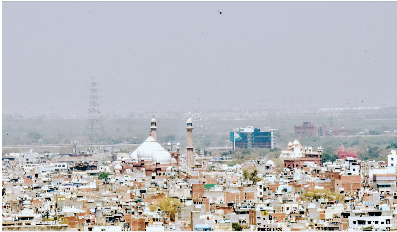
An aerial view of the city's skyline as temperature rises with the onset of summers, in New Delhi on Wednesday.

Iconiq White Whisky recorded 3.2 Lakh cases in FY22-23 during its initial launch across East and North India. In FY23-24, sales surged to 22.7 Lakh cases, earning recognition as the fastest-growing spirits brand in the world for 2023, as per Drinks International's Millionaire's Club Report 2024.