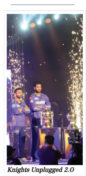
Knights Unplugged 2.0