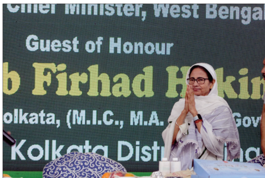
West Bengal Chief Minister Mamata Banerjee attended the Ifar party organised by Firhad Hakim at Ekbalpur on Wednesday.