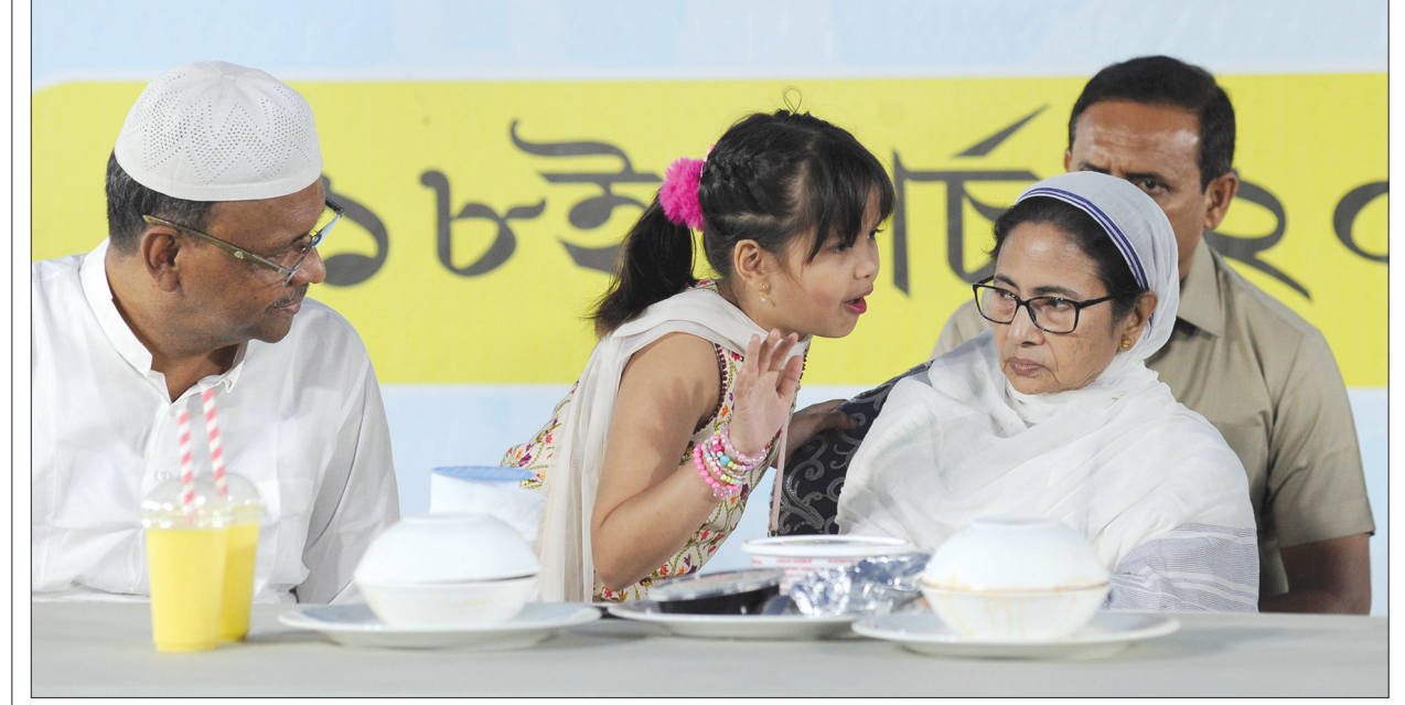
West Bengal Chief Minister Mamata Banerjee interacts with Mayor Firhad Hakim's granddaughter during the 'Dawat-E-Iftar' event organized by the Kolkata Municipal Corporation at Park Circus Maidan in Kolkata on Tuesday.