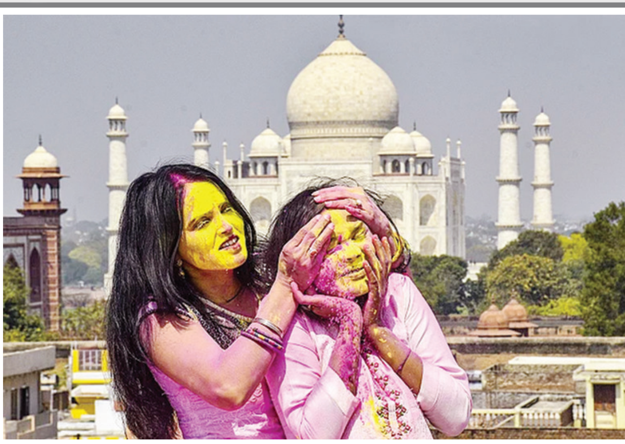
Young women celebrate Holi on the roof of their house in the backdrop of the Taj Mahal, in Agra.