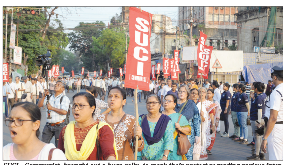
SUCI - Communist brought out a huge rally to mark their protest regarding various inter-

As the state navigates these pressing educational challenges, the effectiveness of the proposed measures will be crucial in determining the future trajectory of both higher education and school fee regulations in West