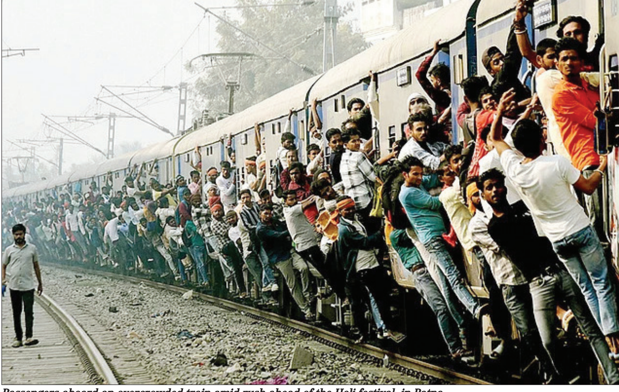
Passengers aboard an overcrowded train amid rush ahead of the Holi festival, in Patna.