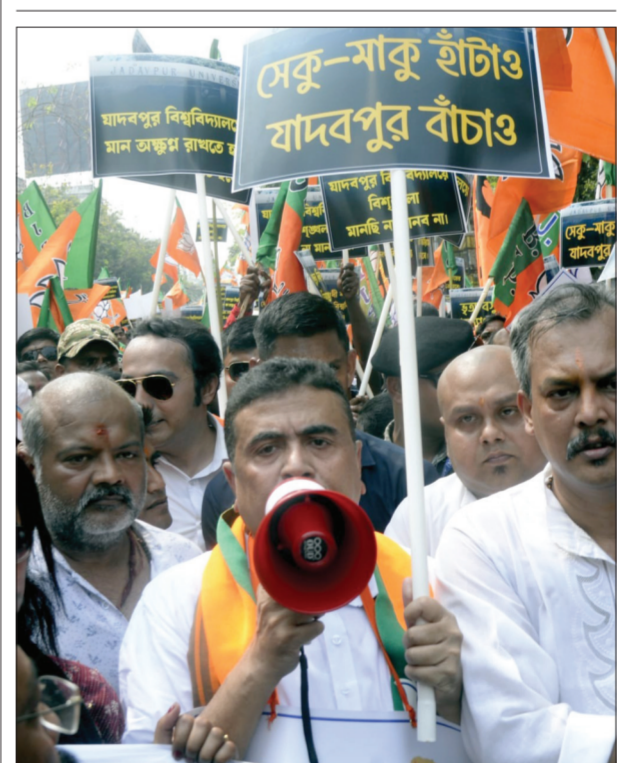
BJP leader Suwendu Adhikari with other leaders and activists took part in a protest rally against the State Government in Kolkata on Sunday.