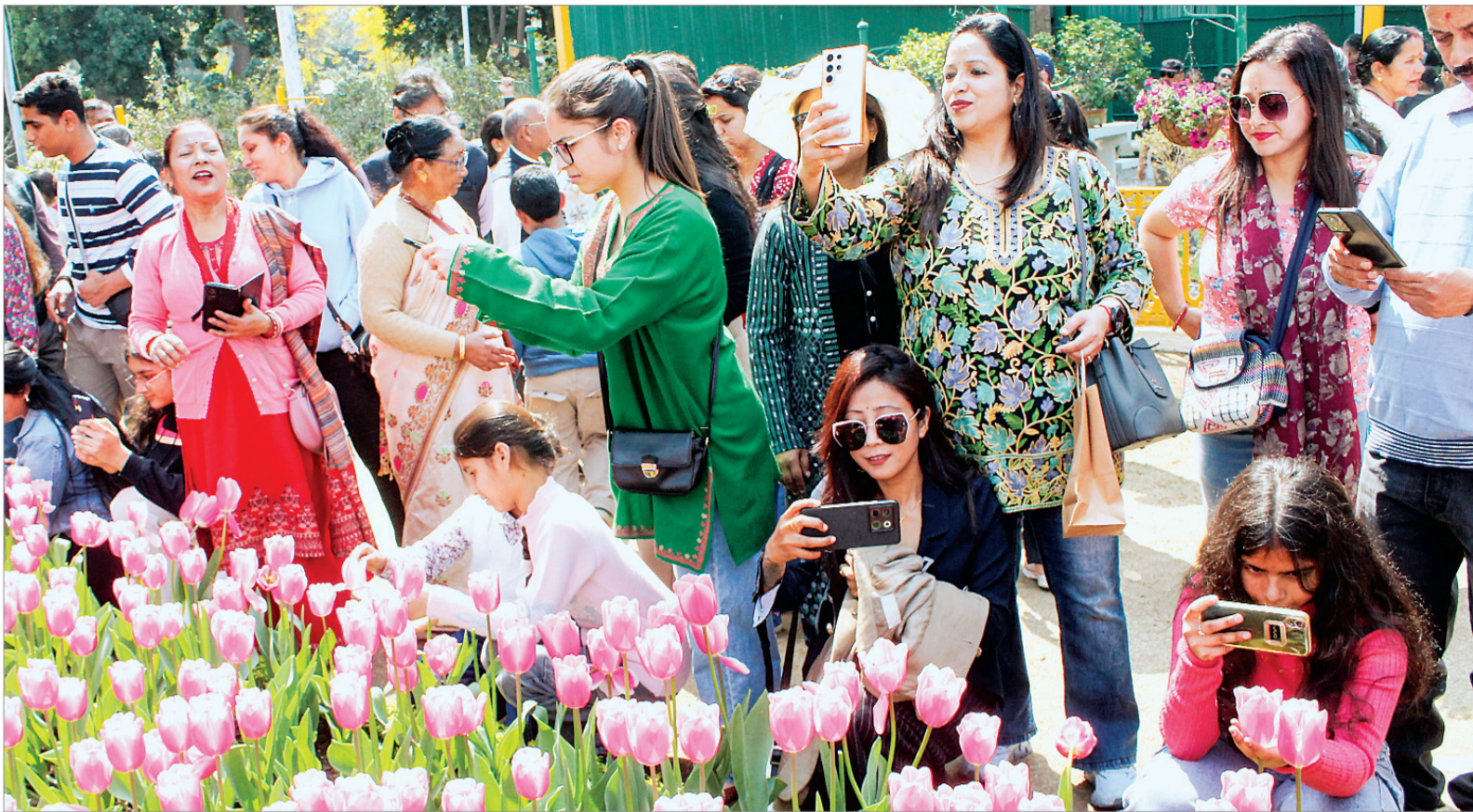
People take pictures of tulips on the last day of the three-day Vasantotsav 2025 (Flower Exhibition) organised by Raj Bhawan, in Dehradun on Sunday.