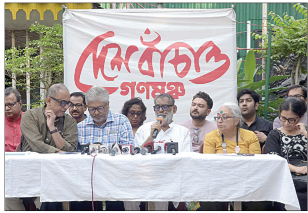
A press conference was organised at Kolkata Press Club by Desh Bachao Gana Mancha regarding recent incident at JU in Kolkata on Sunday. Many eminent personalities were present at the occasion.