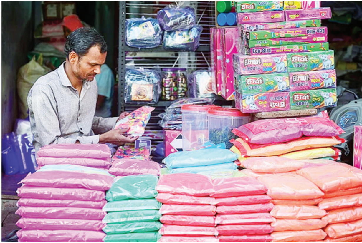
A vendor sells herbal coloured powder at his shop, ahead of Holi festival, in Prayagraj, Uttar Pradesh.