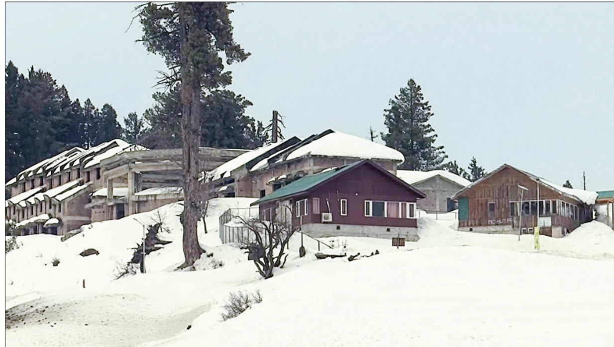
A view of the snow clad Gulmarg Ski Resort as it gears up to host 5th edition of Khelo India Winter Games (KIWG) to boost adventure sports & tourism, on Sunday.