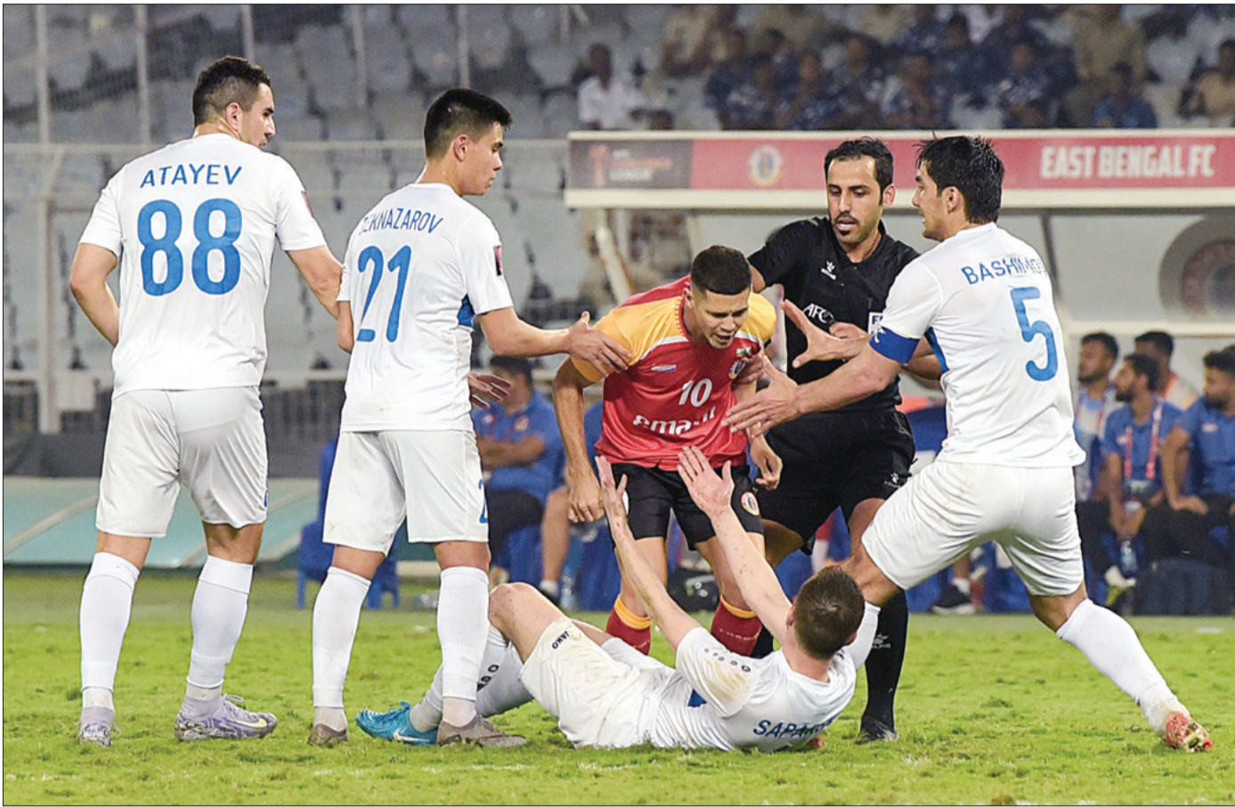
An East Bengal FC player in a scuffle with a FK Arkadag player during their AFC Challenge League 2024-25 quarter-final match, at Salt Lake Stadium in Kolkata on Wednesday.