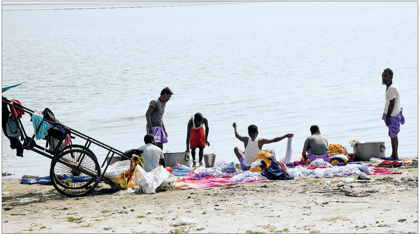
People wash clothes on the banks of the River Brahmaputra, in Guwahati on Thursday.