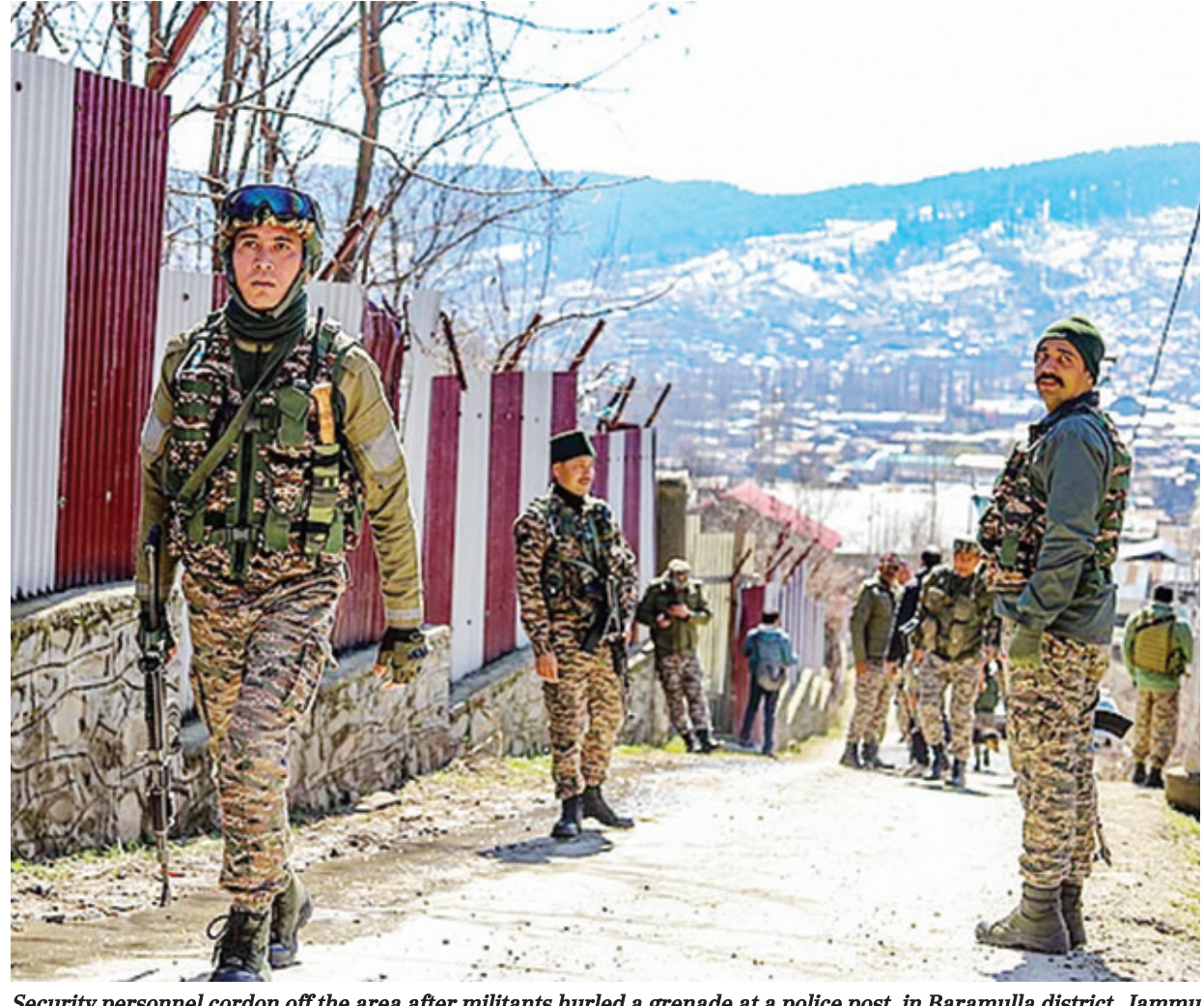
Security personnel cordon off the area after militants hurled a grenade at a police post, in Baramulla district, Jammu

The organization explained, however, given the "magnitude of the disaster, we see great importance in reflecting the main findings to the public." As such it decided to publish parts of the investigation in a way that the organization hopes will provide "as balanced and complete a picture as possible, without compromising matters that must be kept secret for reasons of national security.