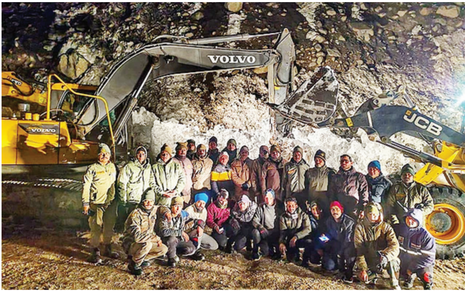
In this image posted by @BR0India via X, rescue team members pose for group photos after the conclusion of Mana Rescue operations following an avalanche, in Chamoli district.

The Minister reviewed with the Secretary Hegseth the IDF's (Israel Defense Forces) activities in Judea and Samaria against terrorism, emphasized the importance of the security areas Israel's military established in Lebanon and Syria, and thanked America for its support. In addition, Katz and Hegseth agreed that Iran is the main threat to the region, and that close cooperation between Israel and the US must continue with the aim of preventing it from obtaining nuclear weapons.