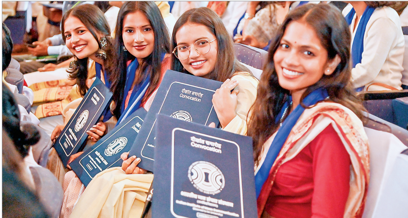
Graduates pose for a picture during the 56th convocation ceremony of the Indian Institute of Mass Communication, in New Delhi on Tuesday.