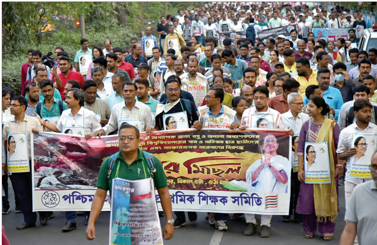
Members of West Bengal College & University Professors' Association (WBCUPA) and other organizations took part in a protest rally against leftist students organization over Jadavpur University incident issue in Kolkata.