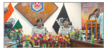
bai, Goa, Mangalore, Kochi, Visakhapatnam, Chennai, and Pondichery before concluding at the Swami Vivekananda Memorial in Kanyakumari on

MI News Service, Kolkata: In a historic first, the Central Industrial Security Force (CISF) is set to launch the CISF Coastal Cyclothon on March 7, commemorating its 56th