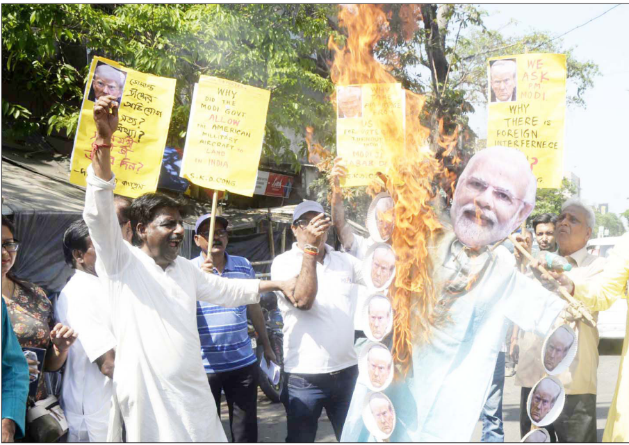
Congress activists took part in a protest against Prime Minister Narendra Modi in Kolkata on Tuesday