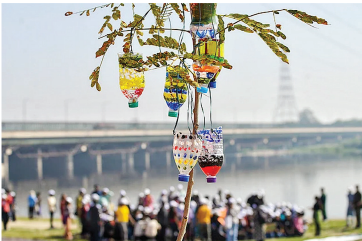
Artistic models from used plastic bottles hung from a tree during a 'Climate March' by volunteers at the Yamuna bank to raise awareness about cleanliness of the Yamuna river and other environmental issues, near ITO in New Delhi.

Punjab won the war against militancy in the past, and now all the concerned officers in the state will play a major role in the war against drugs, Mann said. He also directed the police officers present at the meeting to ensure that no drugs are available in the state within the next three months.