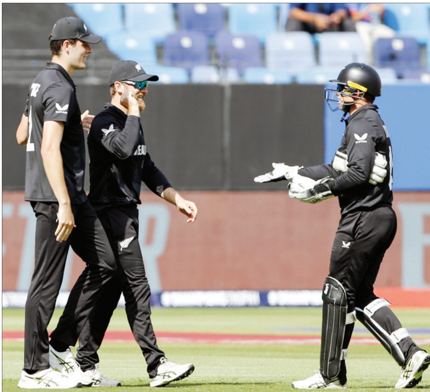
New Zealand's Tom Latham, Kane Williamson and William O'Rourke celebrate the wicket of India's KL Rahul during their ICC Champions Trophy 2025 - Group A match, at Dubai International Cricket Stadium in Dubai on Sunday.

Vidarbha's gritty style of cricket had once again prevailed, cementing their place among India's domestic cricket powerhouses.