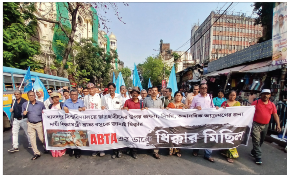
ABTA activists took part in a protest rally in Kolkata on Sunday.

advancing for massive industrialization in the state." She also mentioned very candidly that a "very conscious and deliberate conspiracy has been hatched both inside and outside the state to thwart Bengal's progress."