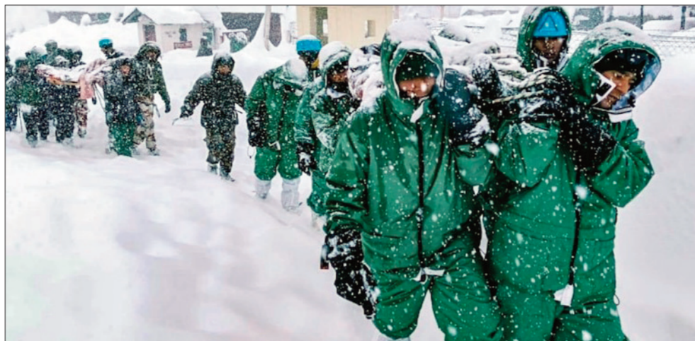
the number of workers who lost their lives in the Mana avalanche has mounted to seven.

Three bodies of the missing labourers were found on Sunday, district administration officials said in Gopeshwar. With this,