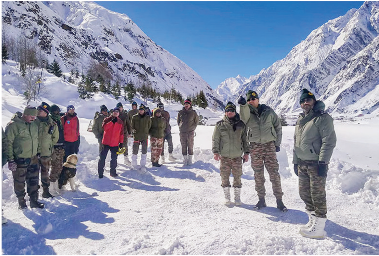
Army personnel during rescue work after several labourers got trapped under snow following an avalanche in Mana area, in Chamoli district.

MI News Service, Tel Aviv: Israel has adopted the framework of US Presidential envoy Steve Witkoff for a temporary ceasefire during Ramzan and Passover period. The decision was taken after a security discussion chaired by Israel Prime Minister Benjamin Netanyahu and with the participation of Israel's Defence Minister, senior security establishment officials and the negotiating team. In a post on X, the Israel Prime Minister's Office stated, "Following a security discussion chaired by Prime Minister Benjamin Netanyahu, and with the participation of the Defense Minister, senior security establishment officials and the negotiating team, it was decided. Israel adopts the framework of US Presidential envoy Steve Witkoff for a temporary ceasefire during the Ramadan and Passover period." On the first day of the framework, half of the living and deceased hostages will be released. Upon its conclusion, if agreement is reached on a permanent ceasefire, the remaining living and deceased hostages will be released, according to the statement released by Israel Prime Minister's Office. The statement released by Israel Prime Minister's Office states, "Steve Witkoff proposed the framework on extending the ceasefire after gaining the impression that, at present, there was no possibility of bridging between the positions of the sides on ending the