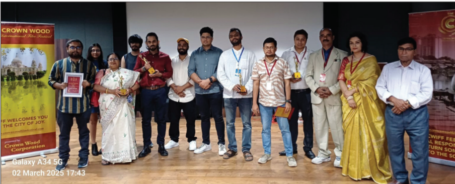
Another international film festival was held in the city on Sunday. With this film festival at its center, New Town's 'Nazrul Tirtha' briefly turned into a gathering of respected people. People associated with the renowned film industry from India, South Africa, France, Korea, Iran and other countries attended the Crownwood International Film Festival. Actors, actresses, directors, producers, and directors, along with film artists, were in attendance. This time, the Crownwood International Film Festival has been held for six years. In total, about three thousand films have participated in these years. Awards have been given in a total of 99 categories from different countries and languages. About 50 awards have been given in these 99 categories. The participants are happy to attend this film festival and receive awards. The Crownwood International Film Festival authorities said that this film festival is an initiative to make the public more cinema-orient

under pressure from a leader of the West Bengal College and University Professors' Association (WBCUPA), who allegedly compelled the teacher-in-charge to seek rescheduling of the CBCS exam (general elective-I) for BA (general) fifth-semester students. WBCUPA has denied the allegation. According to university sources, the authorities of Vivekananda Mahavidyalaya, the Burdwan college, mailed the varsity seeking rescheduling of the exam, which needed many teachers as invigilators.