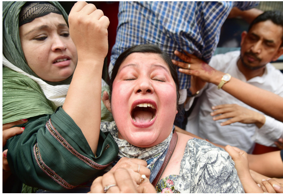
Congress activists took part in a protest and agitated during their march to Lalbazar (Kolkata Police headquarter) in Kolkata.