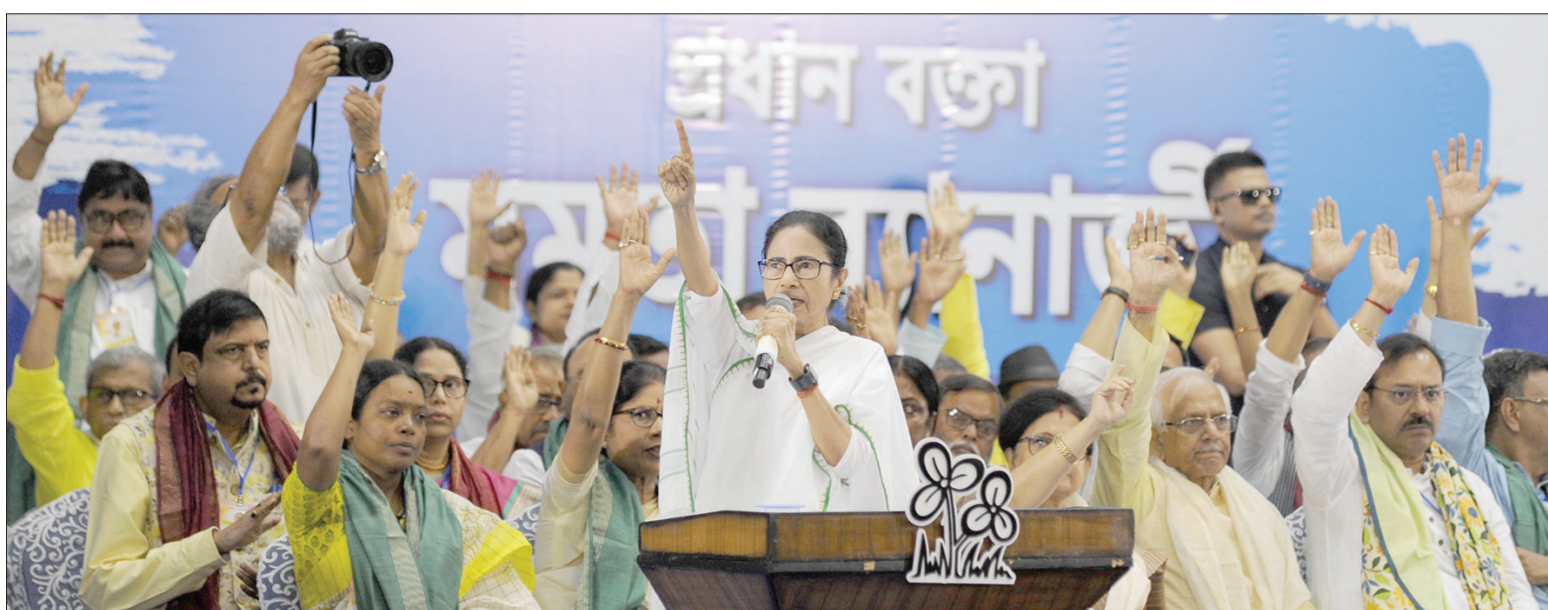
TMC Supremo and Chief Minister of West Bengal Mamata Banerjee in a commanding gesture as she addresses a mega TMC Workers' rally at Netaji Indoor Stadium in Kolkata on Thursday.