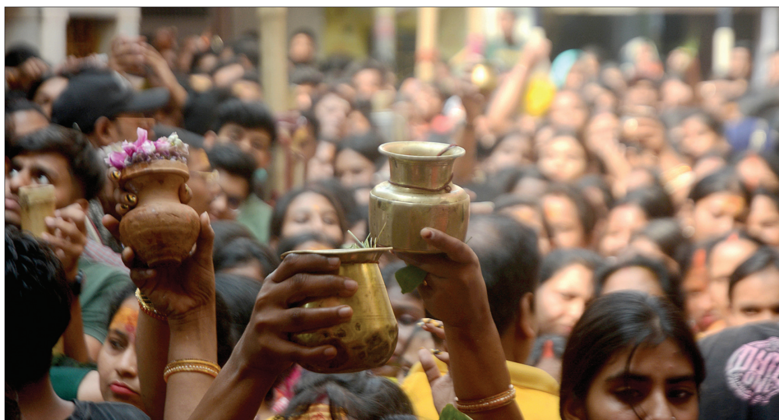
Devotees throng Bhutanath Siva temple in Kolkata on Wednesday to offer Maha Sivaratri puja.