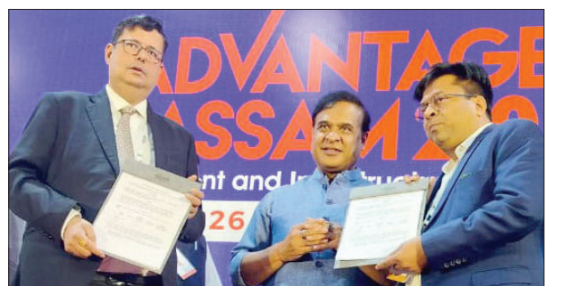
Amit Saraogi, President, MCCI with Himanta Biswa Sarma, CM of Assam at Investment & Infrastructure Summit of Advantage Assam.

MI News Service, Kolkata/Howrah: West Bengal Chief Minister Mamata Banerjee asserted that there would be no compromise with tea plantations, stating that the uncultivated tea garden land would be used for tourism purposes. She also cleared a proposal to lease land, which belongs to six tea bagans (gardens), where the development of tourism-related activities will occur. "No compromise with tea plantations. If any land is vacant or uncultivated, it will be used for tourism. The policy is clear that 15 per cent of tea garden land which remains uncultivated will be used for tourism. 80 per cent of manpower (workforce) must be locals," Banerjee said.