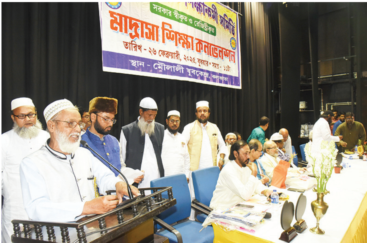
Protest against the derogatory remarks made by the opposition leader of West Bengal regarding madrasa education. Madrasa teachers and staff at the invitation of MSSS association Madrasa Education Convention at Moulali Youth Centre Auditorium on Wednesday.

MI News Service, Tel Aviv: The Israeli military has arrested dozens of Palestinians as part of an expansion of its military operations across the occupied West Bank. At least 50 people were arrested in overnight raids, according to the Palestinian Prisoner's Society (PPS) and the Commission of Detainees and Ex-Detainees Affairs, both cited by a report by the Palestinian news agency Wafa on Wednesday. According to Wafa's report, the military rounded up people for interrogation in the governorates of Hebron, Tulkarem, Qalqilya, Nablus, Ramallah, Bethlehem, Jericho and Tubas. As part of the campaign, Israeli troops stormed the Majed Abu Sharar School in the city of Dura near Hebron and arrested two students, the Palestinian Prisoners' Media Office said on Wednesday.