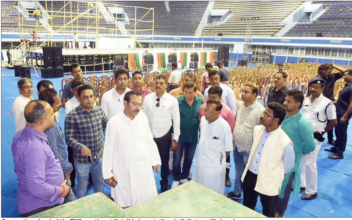
Preparation ahead of the TMC meeting at Netaji Indoor stadium in Kolkata on Wednesday.