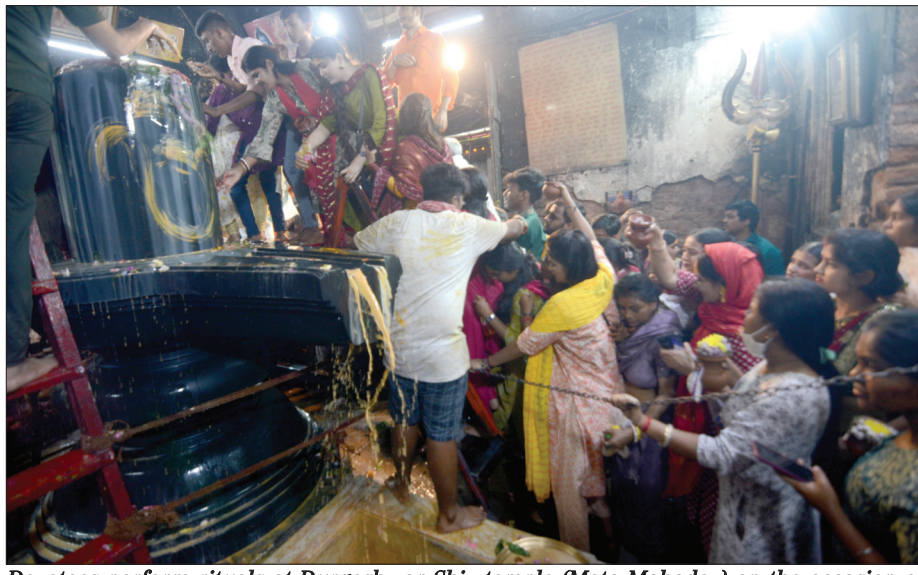
Devotees perform rituals at Durgeshwar Shiv temple (Mota Mahadev) on the occasion of Maha Shivratri on Wednesday at Kolkata.