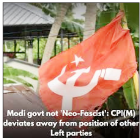
Modi gov't not 'Neo-Fascist': CPIM(M) deviates away from position of other Left parties

MI News Service, New Delhi: In a sudden volt-face Communist Party of India (Marxist) i.e. CPIM has men-