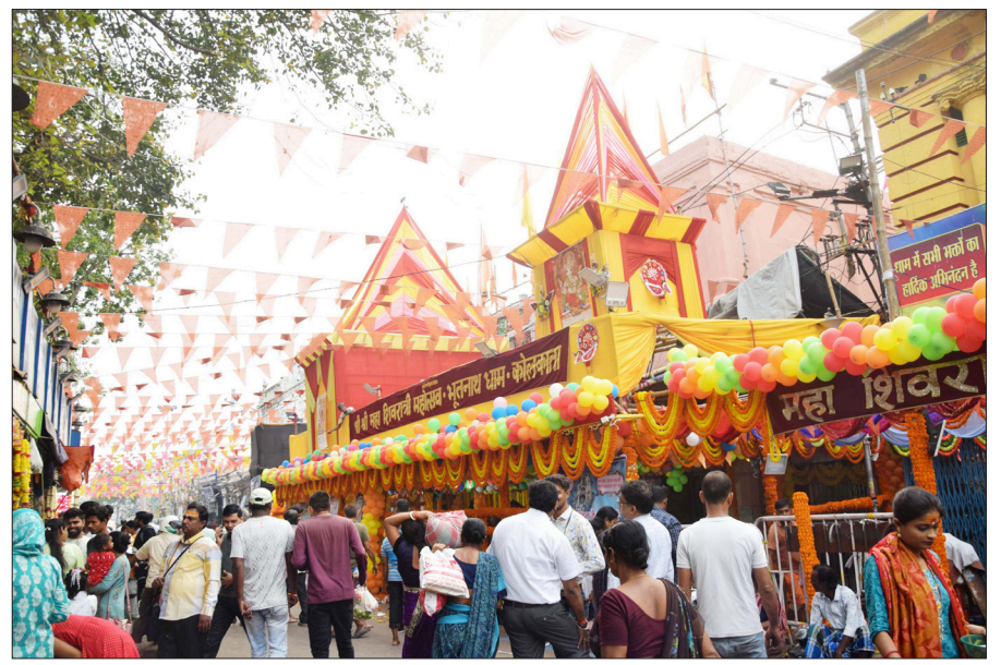
Maha Shivaratri preparation at Bhutnath Temple in Kolkata on Tuesday.

MI News Service, Kolkata/Bhubaneswar: JSW MG Motor India has produced 15,000 units of the MG Windsor, India's first Intelligent CUV, which has been the best-selling EV in India for four months. JSW MG Motor India plans to diversify its portfolio with the launch of the MG Cyberster and MG M9 under the MG Select brand channel.