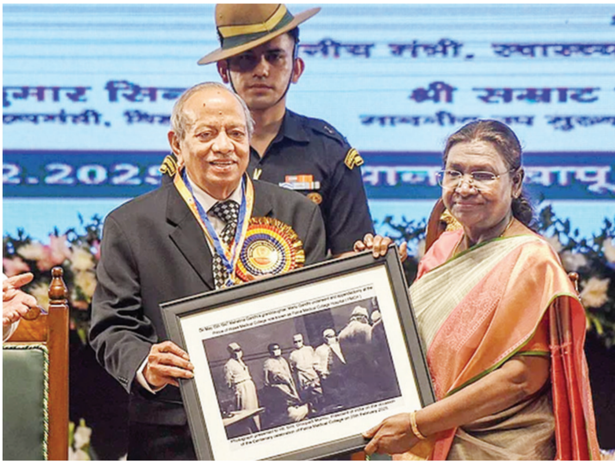
President Droupadi Murmu during the centenary celebration of Patna Medical College and Hospital, in Patna.

MI News Service, Kolkata: One pair of EMU special train between Howrah & Tarakeswar will run on 26.02.2025 (Wednesday) & 27.02.2025 (Thursday) to cope up with the expected heavy rush of visitors during the occasion of "Shiva Ratri Mela" at Tarakeswar. Howrah - Tarakeswar EMU Special will leave Howrah at 14:45 hrs. to reach Tarakeswar at 16:14 hrs. and Tarakeswar - Howrah EMU Special will leave Tarakeswar at 16:40 hrs. to reach Howrah at 18:15 hrs. Both the special trains will stop at all stations enroute.