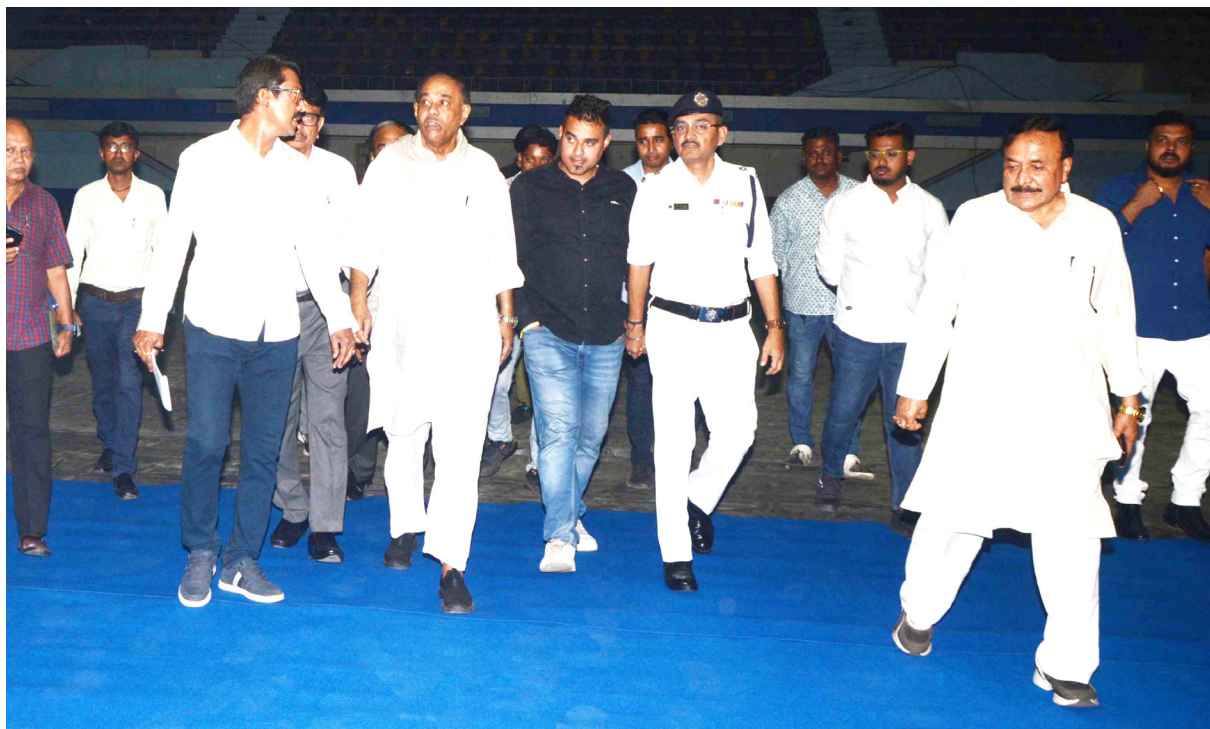
Trinamool leaders at Netaji Indoor Stadium on Tuesday to review preparations ahead of TMC's key meeting scheduled for February 27 in Kolkata.