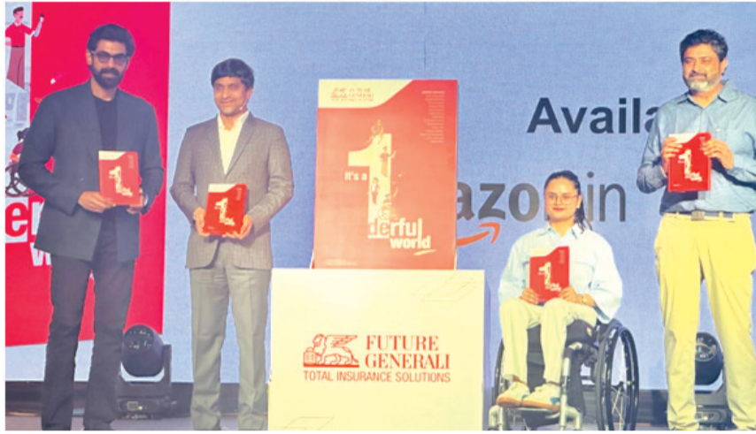
~ It's official!: Persons with Disabilities (PwDs) now account for 1% of FGII's workforce ~ ~ FGII launched a special edition book to celebrate this landmark achievement in the presence of Ranadaggubati, ShrikantBolla, AvaniLeKhara, SudhaChandran etc.

Mumbai : Future Generali India Insurance Company (FGII) has proudly turned a new page in its DEI journey with the launch of 'It's a Wonderful World'-a coffee table book that brings to life stories of inclusion, resilience, and change. Launched at a grand event, this book marks a powerful milestone in FGII's unwavering commitment to Diversity, Equity, and Inclusion (DEI), proving that when every voice is heard, the world truly becomes 'wonderful.' The book brings alive inspirational stories of individuals across various walks of life as well as FGII's PwD employees. It celebrates FGII's milestone of achieving 1% representation of Persons with Disabilities (PwDs). The book launch was graced by a distinguished lineup of celebrity guests, including acclaimed actor and producer Ranadaggubati; renowned actress and Bharatanatyam dancer SudhaChandran; two-time Paralympic champion AvaniLeKhara and CEO of Bollant Industries, SrikanthBolla. In 2022, FGII embarked on a journey to make DEI a strategic priority. From introducing policy changes to conducting sensitization and awareness sessions to launching truly inclusive products for the LGBTQIA+ community and women, FGII left no stone