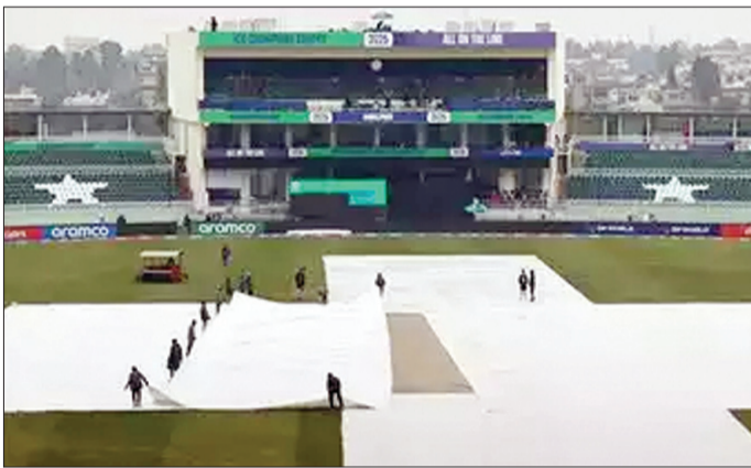
Australia are now on three points each, occupying Group B's first and second spots, respectively. The washout has turned Wednesday's clash between Afghanistan and England into a virtual knockout.

It had been raining since the morning, which hardly gave the ground staff any chance to prepare the venue for the match. A relentless downpour washed away the game, and both teams shared a point each. South Africa and