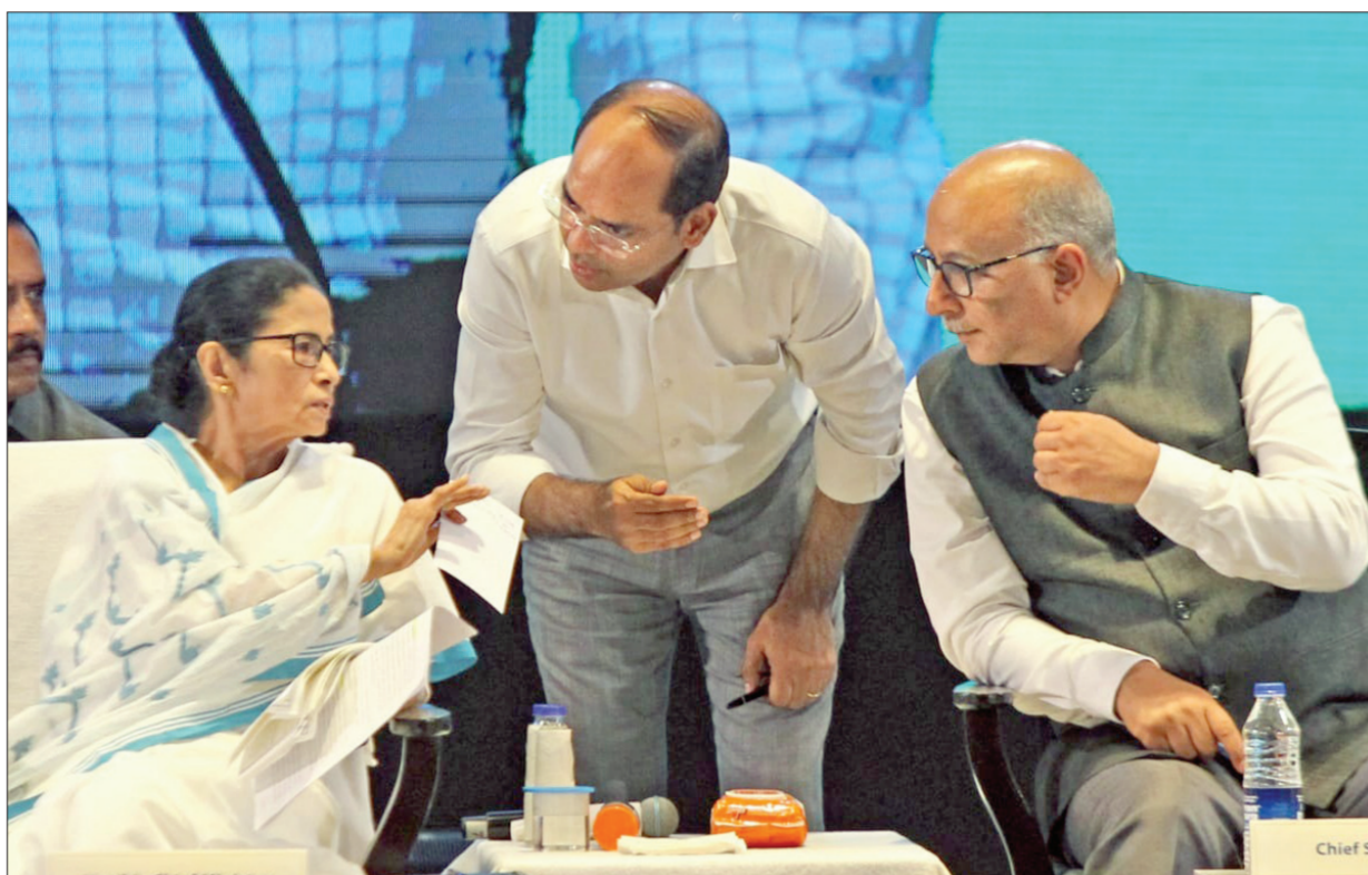
West Bengal Chief Minister Mamata Banerjee during a Government program on "Chikitsar R Ek Naam Seva" in Kolkata on Monday.