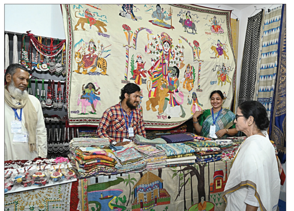
West Bengal Chief Minister Mamata Banerjee visited stalls at 'Banglar Haat' at New Town, beside Biswa Bangla Convention Centre, in Kolkata on Thursday.

The decision to launch the scheme was taken by the Mamata Banerjee government in 2019, after over 16 lakh students had failed to avail a scholarship granted by the Centre. The state had launched the scheme and shoulders the entire cost of providing scholarships to students of minority communities.