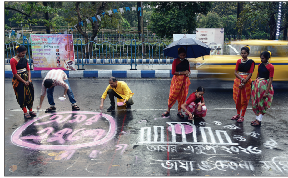
Activists create graffiti on the road ahead of International Mother Language Day, in Kolkata.

would continue but "corruption" in such programmes would be eliminated. The BJP also has to implement its own flagship programmes in Delhi. The BJP had promised to introduce the Ayushman Bharat health insurance scheme in Delhi and it had become an electoral issue. The scheme provides free treatment up to Rs 5 lakh per beneficiary, with an additional Rs 5 lakh covered by the state government. The AAP government had previously refused to implement it, claiming that Delhi's existing healthcare system was superior and more inclusive. The BJP has also vowed to reform Delhi's Mohalla Clinics, alleging corruption in its functioning. BJP MLA Manjinder Singh Sirsa from Rajouri Garden said that the clinics will be rebranded as "Ayushman Arogya Mandirs" and will deliver better healthcare delivery. BJP has consistently accused the AAP of corruption, alleging that it was deliberately trying to avoid the tabling of the Comptroller and Auditor General (CAG) reports in the assembly to hide financial irregularities.