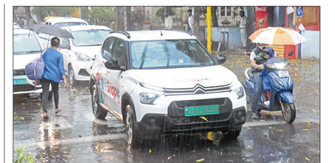
Heavy rain batters Kolkata on Thursday.