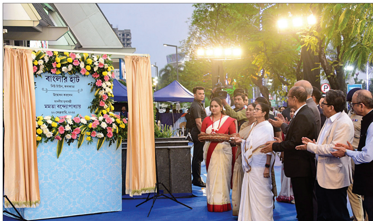
West Bengal Chief Minister Mamata Banerjee inaugurates 'Banglar Haat' at New Town, beside Biswa Bangla Convention Centre, in Kolkata on Thursday.

This shocking case highlights the dangers of personal disputes turning violent and underscores the importance of law enforcement intervention in such matters. Experts warn that threats and coercion in relationships often stem from control, possessiveness, and deeply rooted societal biases. Seeking police and legal support in such cases is crucial to prevent further harm.