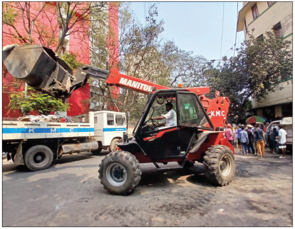
KMC and Kolkata Police evacuated the footpath near Yogayog Bhavan at Central Avenue, in Kolkata.