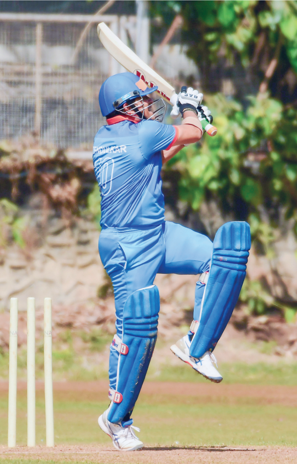
Former Indian cricketer Sachin Tendulkar plays a shot during a practice session ahead of the International Masters League T20 2025, in Mumbai on Tuesday.