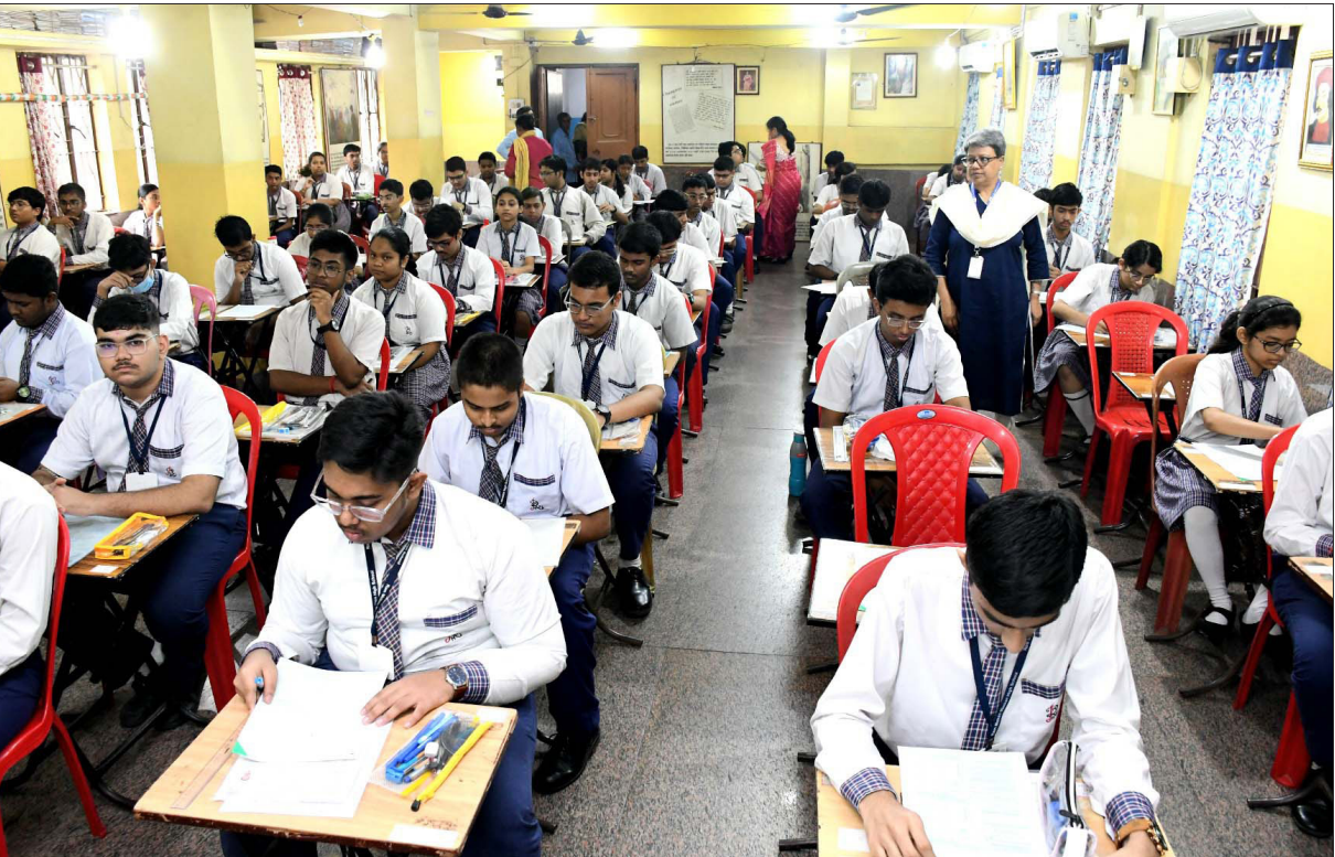
ICSE Class X exams begin on Tuesday; a glimpse of the exam hall at Rammohan Mission High School.