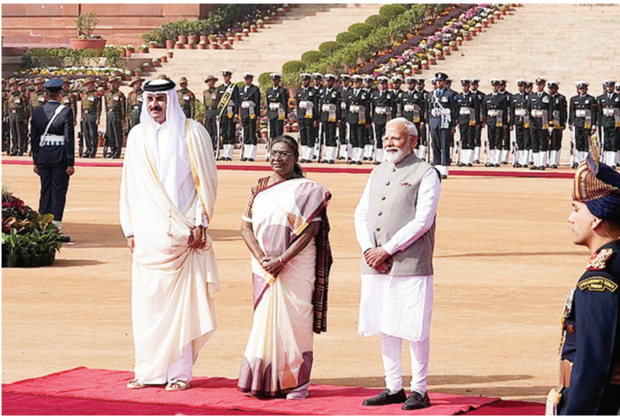
From left, Qatar's Emir Sheikh Tamim bin Hamad Al-Thani, Indian President Droupadi Murmu and Indian Prime Minister Narendra Modi pose for a photograph during the ceremonial reception of Emir at the Indian presidential palace in New Delhi.

MI News Service, Jerusalem: Israeli Prime Minister Benjamin Netanyahu dismissed the possibility of the Palestinian Authority (PA) governing post-war Gaza. In a response to media reports that Hamas had expressed willingness to relinquish control of the enclave to the PA, Netanyahu said in a statement: "As I promised -- the day after the war in Gaza, there will be no Hamas and no Palestinian Authority." He reiterated his support for former U.S. President Donald Trump's plan for Gaza, which includes the transfer of the enclave's Palestinian population to neighboring countries. Arab leaders have rejected the proposal. "I am committed to President Trump's plan for creating a different Gaza," Netanyahu said. Israel objects to Palestinian sovereignty in the Gaza Strip, West Bank, and East Jerusalem, territories it seized in the 1967 Middle East war.