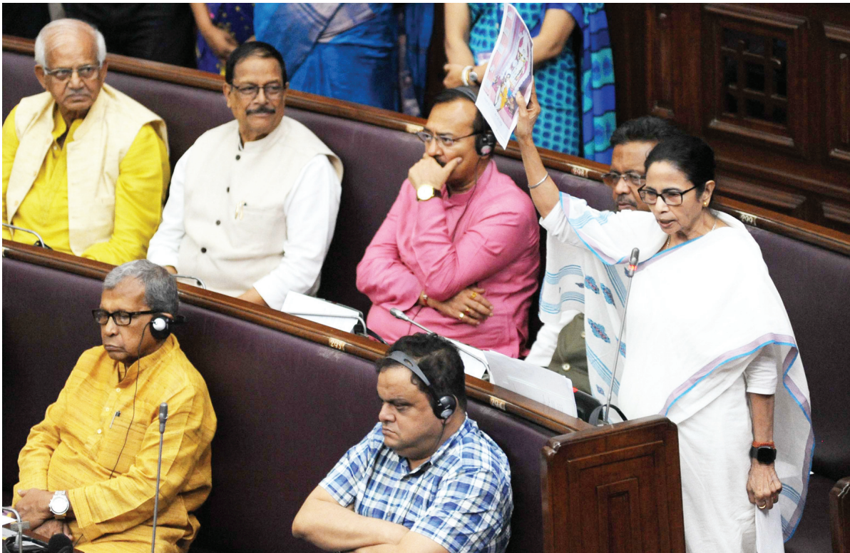
West Bengal Chief Minister Mamata Banerjee addressing the West Bengal Assembly in Kolkata on Tuesday.

MI News Service, Kolkata: Amid continuous political attacks against her and her party and counterat-