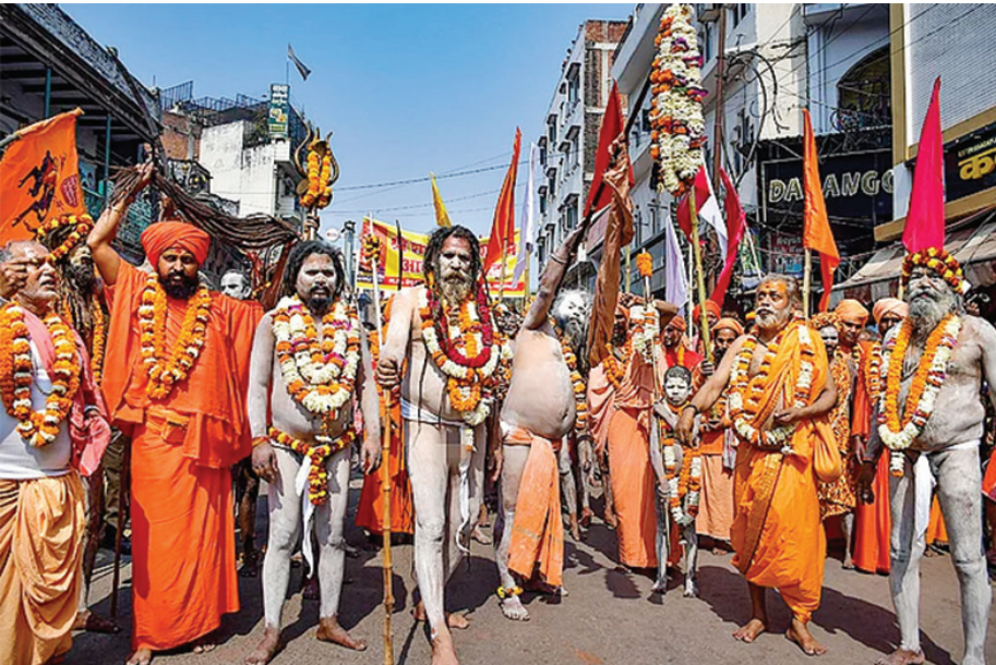
Sadhus of 'Avahan Akhara' take part in a procession, in Varanasi.