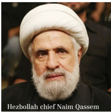
Hezbollah chief Naim Qassem

MI News Service, Beirut: Hezbollah Secretary-General Naim Qassem said on Sunday that Israel must fully withdraw from Lebanon by Feb. 18. "Today, we are facing the Feb. 18 deadline, and the occupation army must fully withdraw from southern Lebanon. It should have no positions or presence whatsoever," Qassem said in a televised speech. He added that it is the responsibility of the Lebanese state to "exert every effort" to ensure that Israel withdraws on time as agreed. Israel had previously postponed its full withdrawal from Lebanon to Feb. 18 after missing the initial deadline. The Israeli military also intended to retain control over five strategic positions in southern Lebanon beyond the deadline, a move also rejected by Hezbollah. There are "no five points and no other details ... this is the agreement," Qassem said in the speech. Meanwhile, the Israeli forces