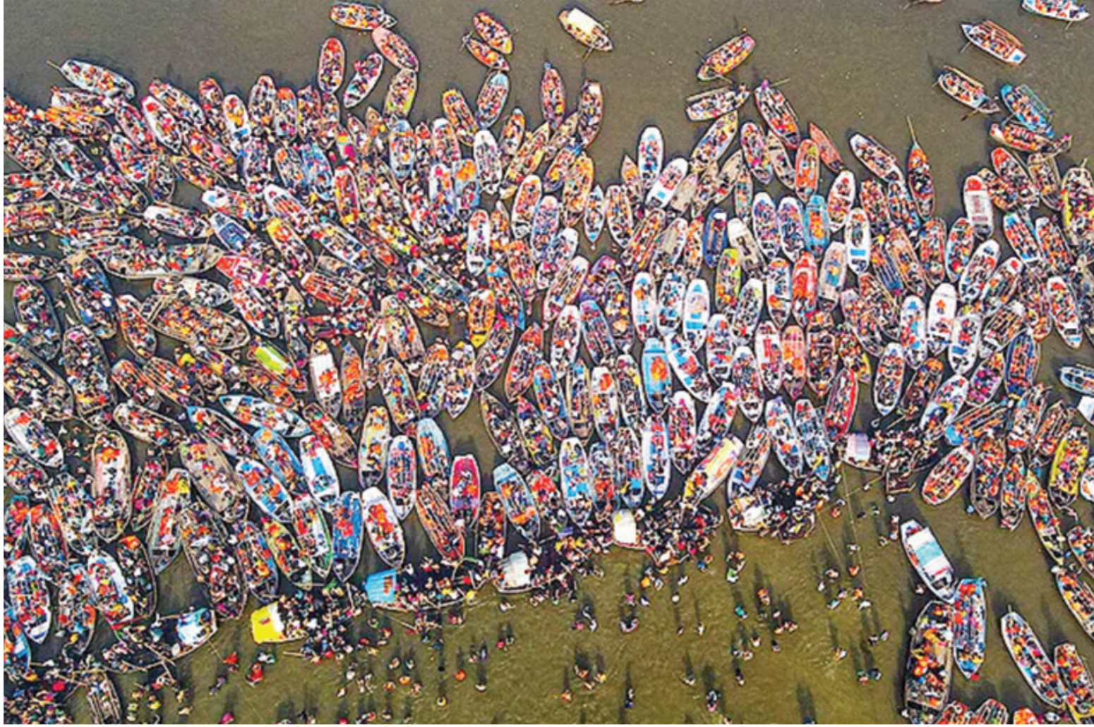
A drone shot of devotees taking a boat ride during ongoing Mahakumbh Mela, at the Sangam in Prayagraj.

MI News Service, Hyderabad: The Telangana government has granted permission for Muslim government employees to leave offices or schools an hour early during Ramzan, applicable from March 2 to March 31, 2025. It is applicable to contract, outsourcing, board, and Public Sector employees. Meanwhile, the Central Ruet-e-Hilal Committee of Sadar Majlis-e-Ulama-e-Deccan, also known as the Moon Sighting Committee, will convene its monthly meeting to determine the start date of Ramzan in India. It is decided based on the sighting of the crescent moon of Ramzan. Meanwhile, Hyderabad is gearing up for the holy month. Many traders and businessmen are preparing for business in the holy month. Mosques across the city are also getting ready for the convenience of the worshippers during the holy month. In view of this, the Telangana government has also announced an hour of relaxation for Muslim government employees during Ramzan.