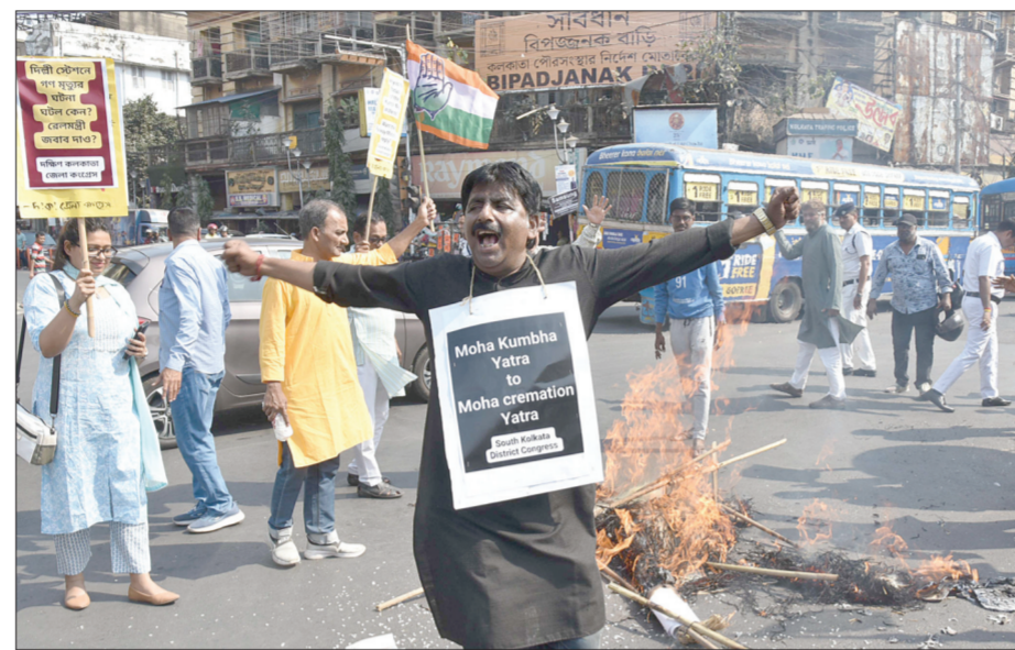
Congress activists took part in a protest rally against Union Rail Minister Ashwini Vaishnaw regarding some recent accidents that happened in relation to MahaKumbh in Kolkata on Monday.

Trinamool Congress chief whip Nirmal Ghosh brought a motion in the House, claiming that the acts of protest by the BJP MLAs were outside legislative culture and demanded action against them.