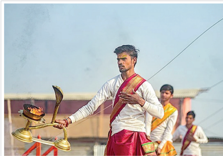
Priests perform 'Ganga Arti' during the Mahakumbh Mela, at the Sangam in Prayagraj.

by 2030. Other major investment proposals came from JSW Group chairman Sajjan Jindal, who announced the setting up of two thermal power plants of 800 MW each at Salbani in West Medinipur district with a proposed investment of Rs 16,000 crore; Harshvardhan Neotia, chairman of Ambuja Neotia Group, who announced an investment of more than Rs 15,000 crore in the next five years; and RP-Sanjiv Goenka Group chairman Sanjiv Goenka, who announced investment of Rs 10,000 crore. Opposition parties, however, have raised questions about the summit, with Leader of Opposition Suwendu Adhikari saying that while investment proposals have been talked about for decades, very little has been seen on the ground. "In reality, BGBS is a glossy facade. The real meaning of BGBS isn't Bengal Global Business Summit, it is Business' Graveyard in a Bankrupt State," Adhikari said in a post on X.