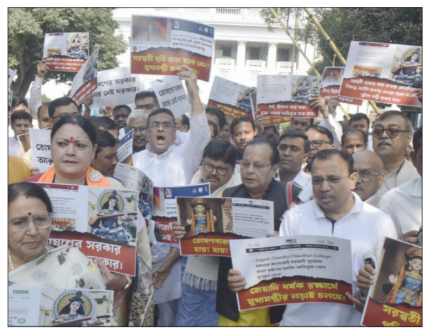
BJP MLA's agitated protest against the State Government at West Bengal Assembly House in Kolkata on Monday.

hance road safety awareness. Additionally, a Road Show featuring placard displays with social messages on safe driving will be organized to engage citizens and spread awareness about responsible road behavior. This initiative reinforces Ujjivan SFB's commitment to community well-being and public safety while supporting the city's ongoing road safety efforts.