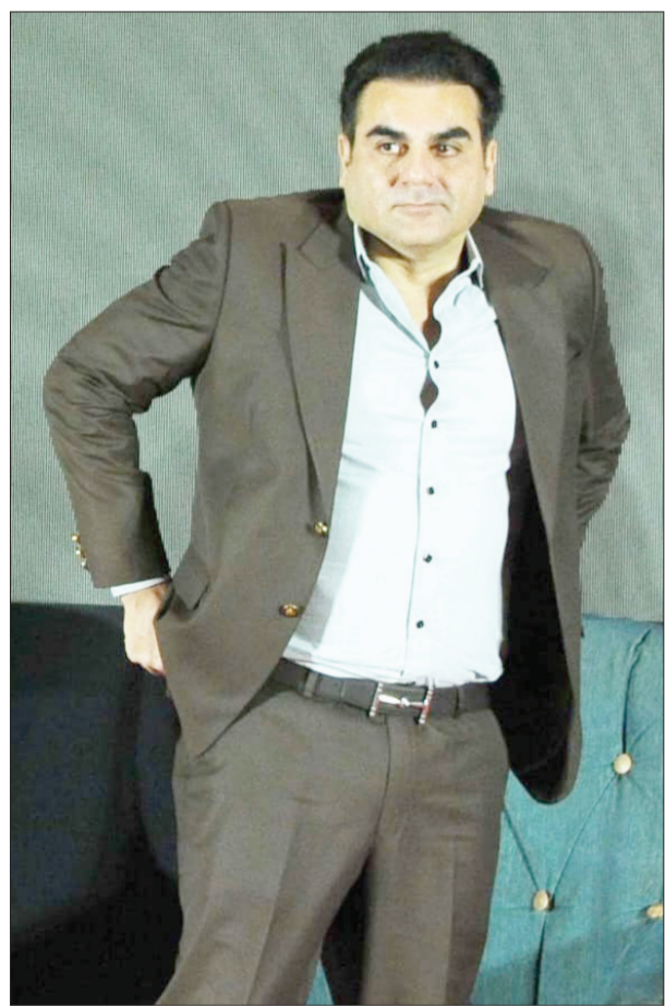
In a promotional programme Indian actor and film producer Arbaaz Khan were present in city on Monday.