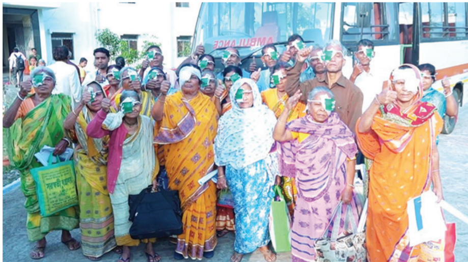
After being referred from the Model Sebaashray Camp at Falta, 24 senior citizens have successfully undergone cataract surgeries at Vivekananda Mission Asram Netra Niramay Niketan, reclaiming their clarity of vision.