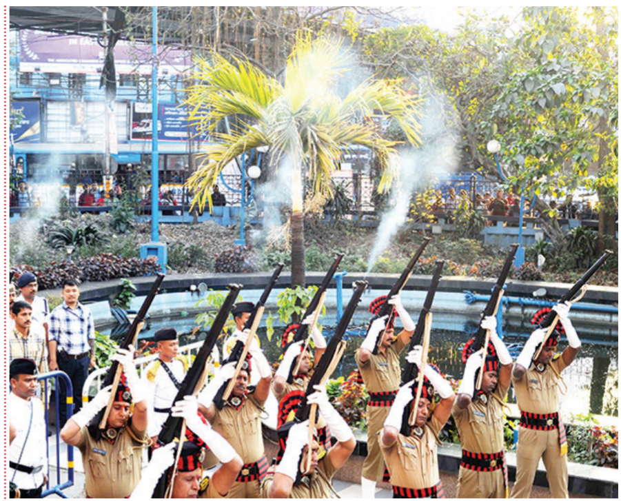
The last rites of veteran Bengali singer-songwriter Pratul Mukhopadhyay being performed with full state honours and gun salute at Rabindra Sadan in Kolkata.